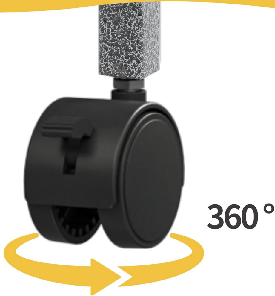
Figure 3: A 360-degree rotatable wheel, highlighting the cage's easy mobility.

Easily move your product anywhere in your home!