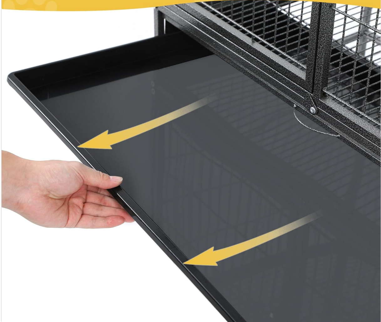
Figure 4: The slide-out tray being removed for easy cleaning of animal waste.

Makes it easy for pet owners to clean up animal waste