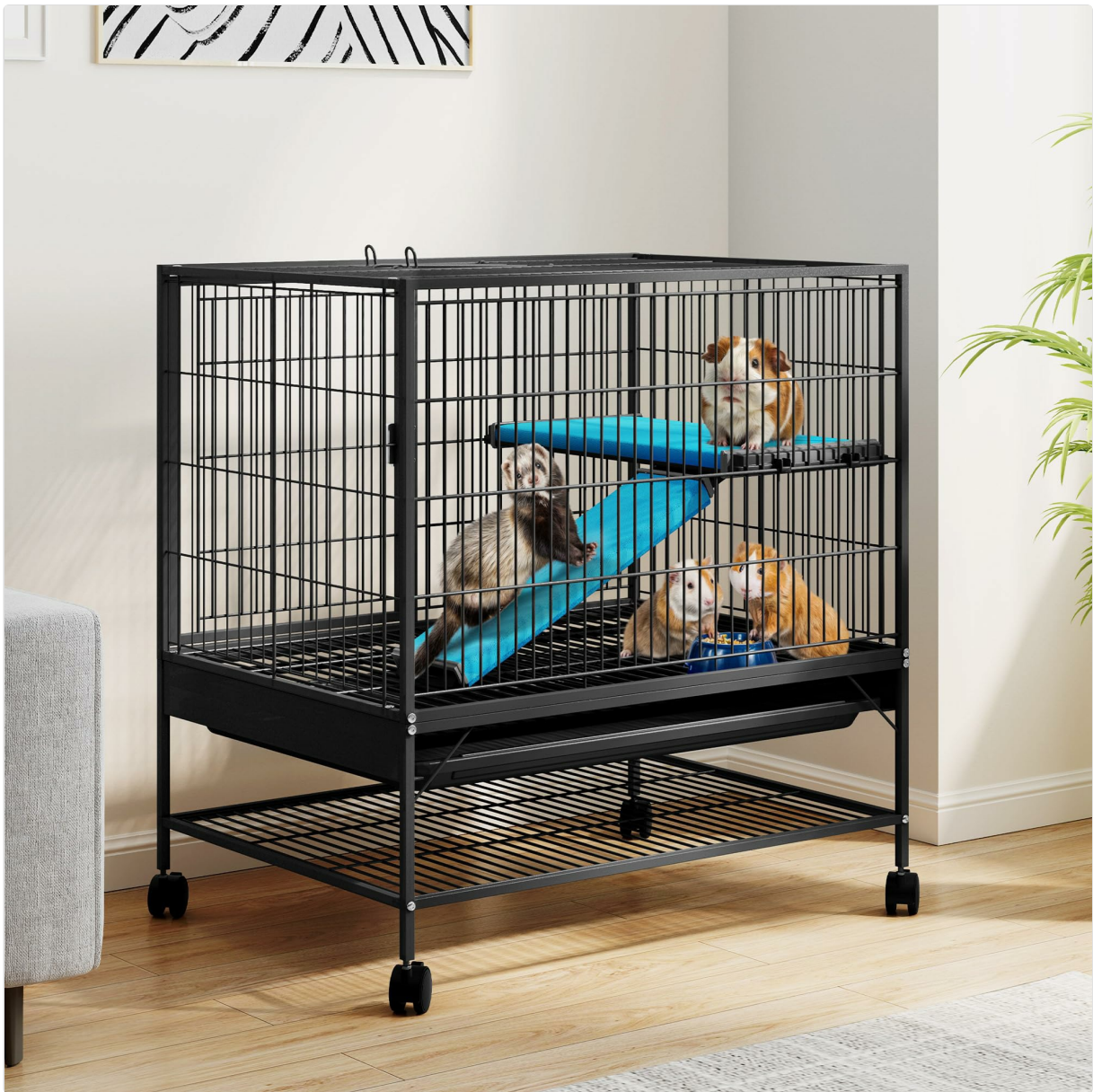
Figure 1: Overall view of the DWVO Two-Tier Small Animal Cage with dimensions and component breakdown. The cage measures approximately 32 inches (L) x 22 inches (W) x 33 inches (H). Key features like the slide-out tray, platforms, and wheels are indicated.