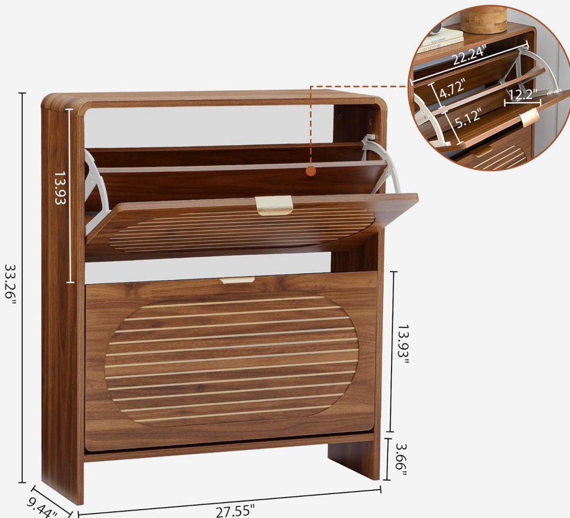
Image: The shoe cabinet with one flip-down drawer open, displaying organized shoes.

Your browser does not support the video tag.