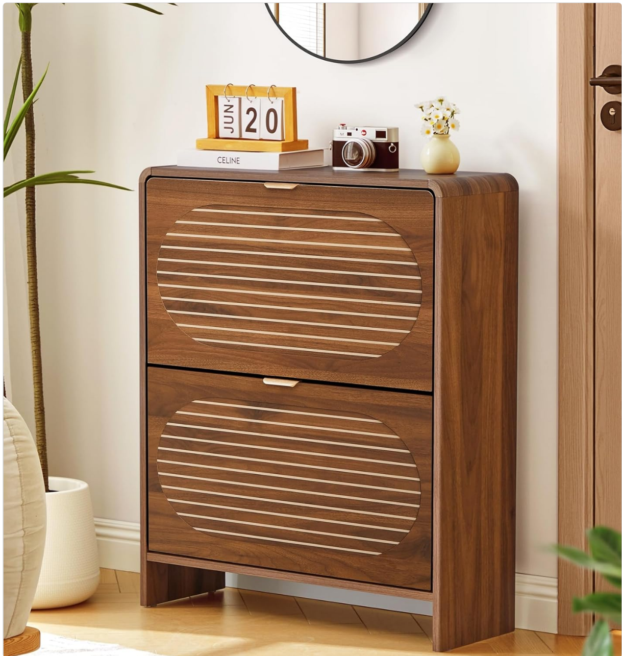
Image: The fully assembled RUSTYER Narrow Shoe Storage Cabinet.