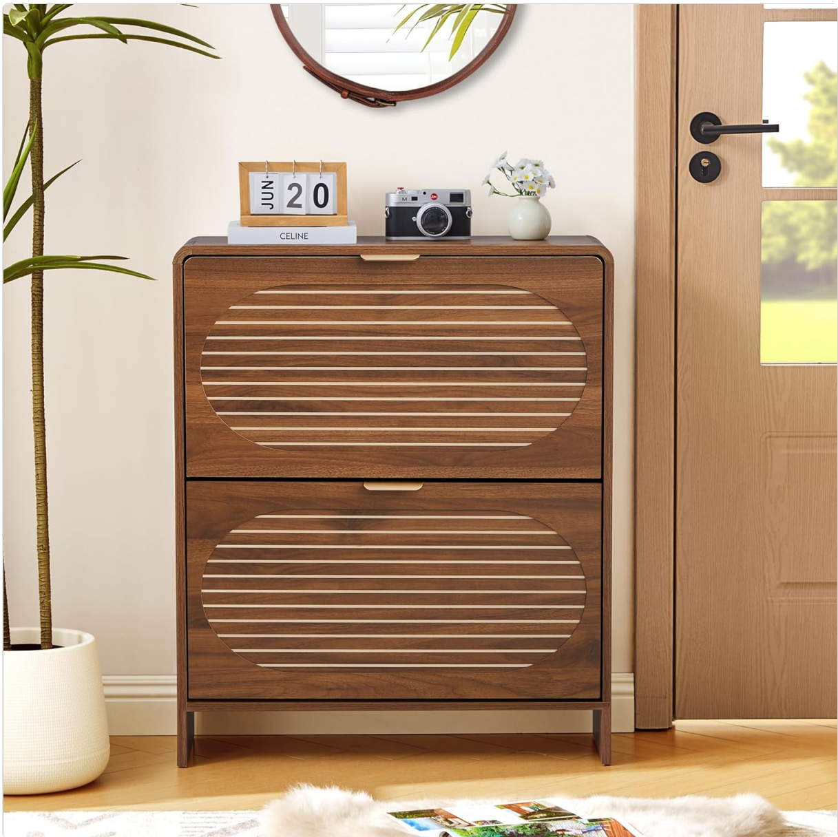
Image: Close-up details of the cabinet, showing the fluted design, stable structure, removable laminates, and curved edges.