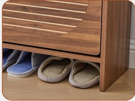
○ Stable and Sturdy Structure