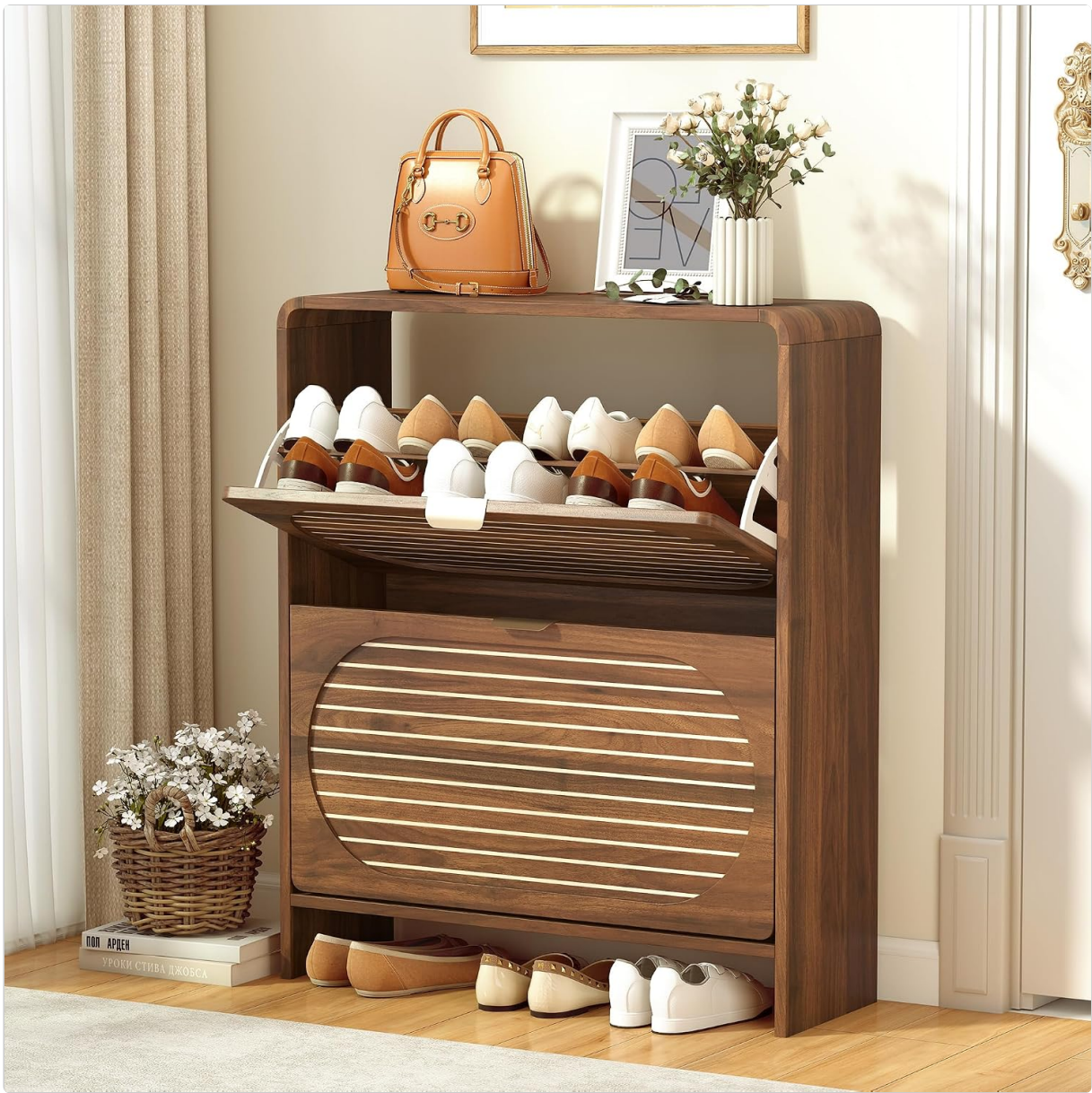
Image: The RUSTYER shoe cabinet showcasing its compact dimensions in a living area.