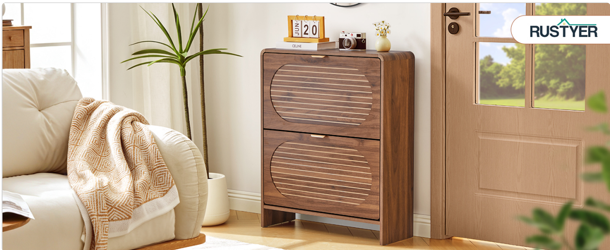
Image: The RUSTYER Narrow Shoe Storage Cabinet in a modern entryway setting.

This manual provides detailed instructions for the assembly, operation, and maintenance of your RUSTYER Narrow Shoe Storage Cabinet. Designed for efficient space utilization, this cabinet features two flip-down drawers and an elegant walnut finish, making it suitable for entryways, hallways, or living areas.