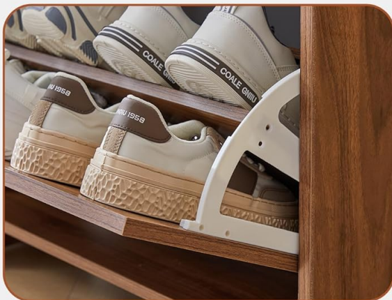
○ Removable Laminates