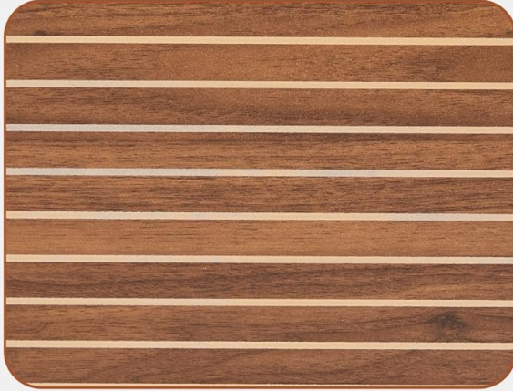
○ Exquisite Fluted Design