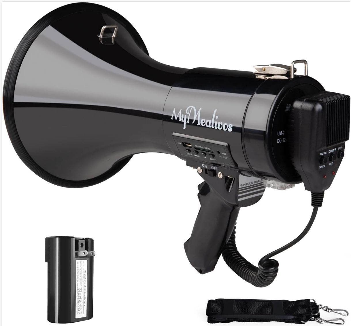
Figure 3.1: MyMealivos 50W Megaphone Speaker with accessories.

Familiarize yourself with the components and controls of your megaphone.