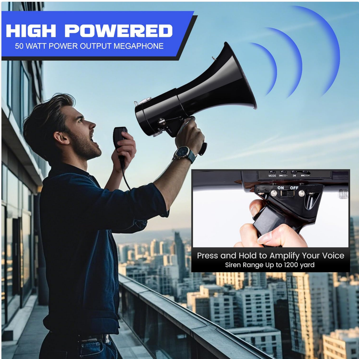
Figure 5.1: Using the megaphone for voice amplification.