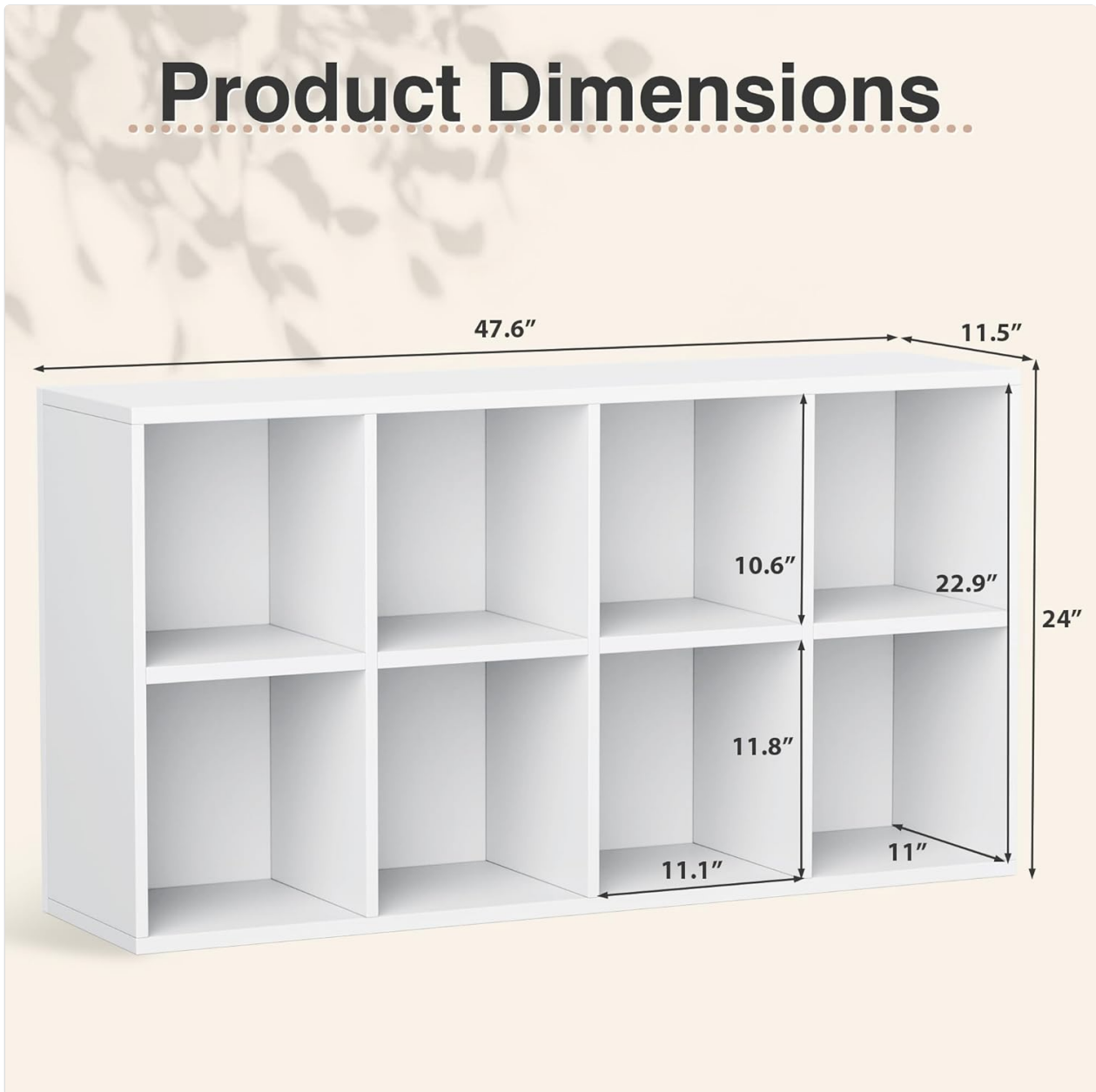
Image: Product dimensions diagram. Overall dimensions: 47.6"W x 11.5"D x 24"H. Individual cube dimensions: 11.1"W x 11"D x 11.8"H.

Refer to the diagram below for detailed product dimensions to ensure it fits your intended space.