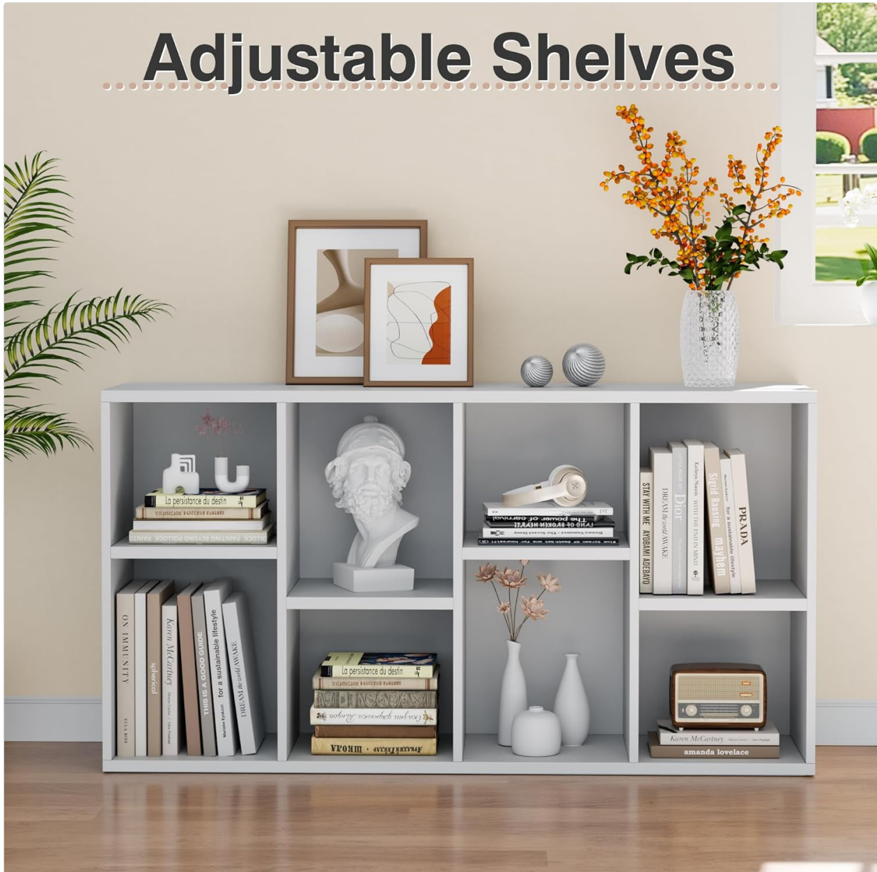
Image: Close-up of the adjustable shelves, highlighting the peg holes for height customization.

The YESHOMY 8 Cube Bookcase features adjustable shelves, allowing you to customize the height of each storage compartment. This flexibility is ideal for accommodating items of varying sizes, from small books to decorative objects.