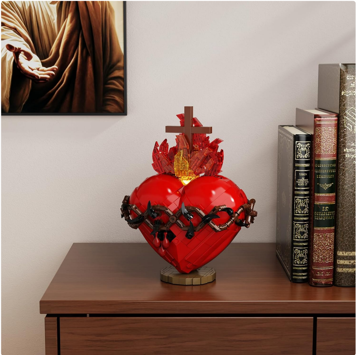
Figure 1: The completed Sacred Heart Building Set, featuring the heart, crown of thorns, cross, and illuminated flame.