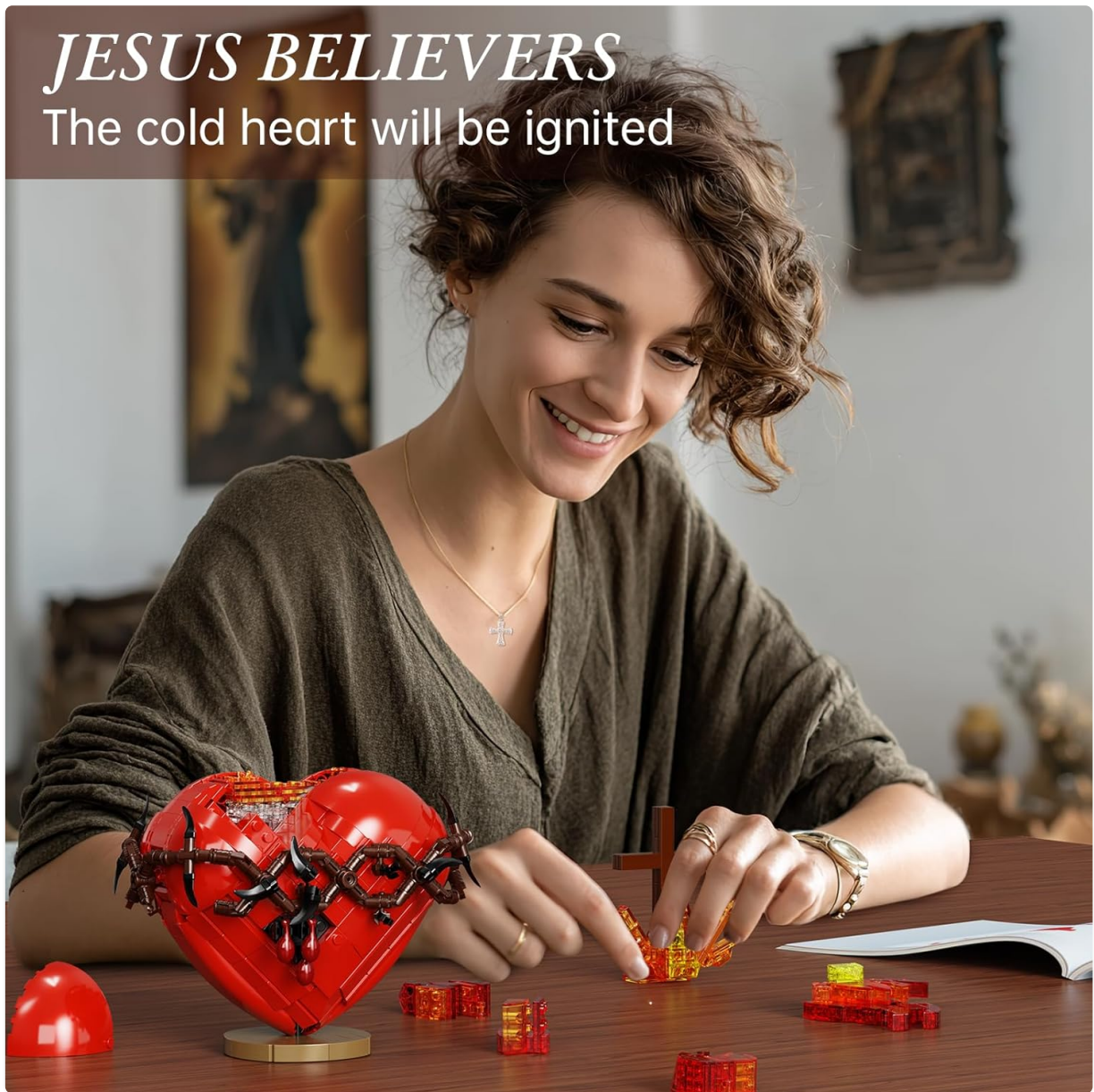
Figure 2: A user engaged in the assembly process of the Sacred Heart Building Set.

Your browser does not support the video tag.