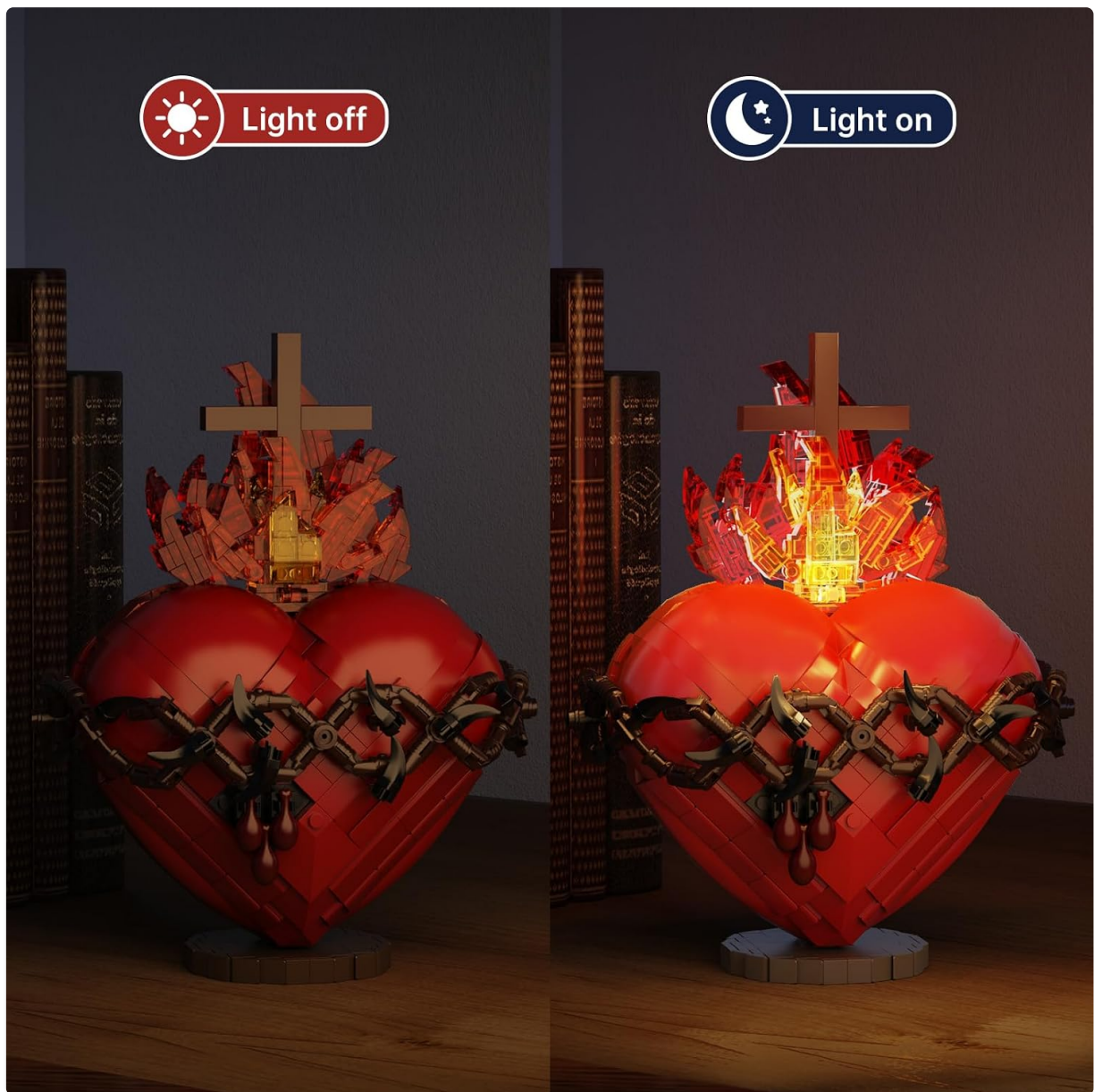
Figure 4: Comparison of the Sacred Heart model with the flame light off and on.