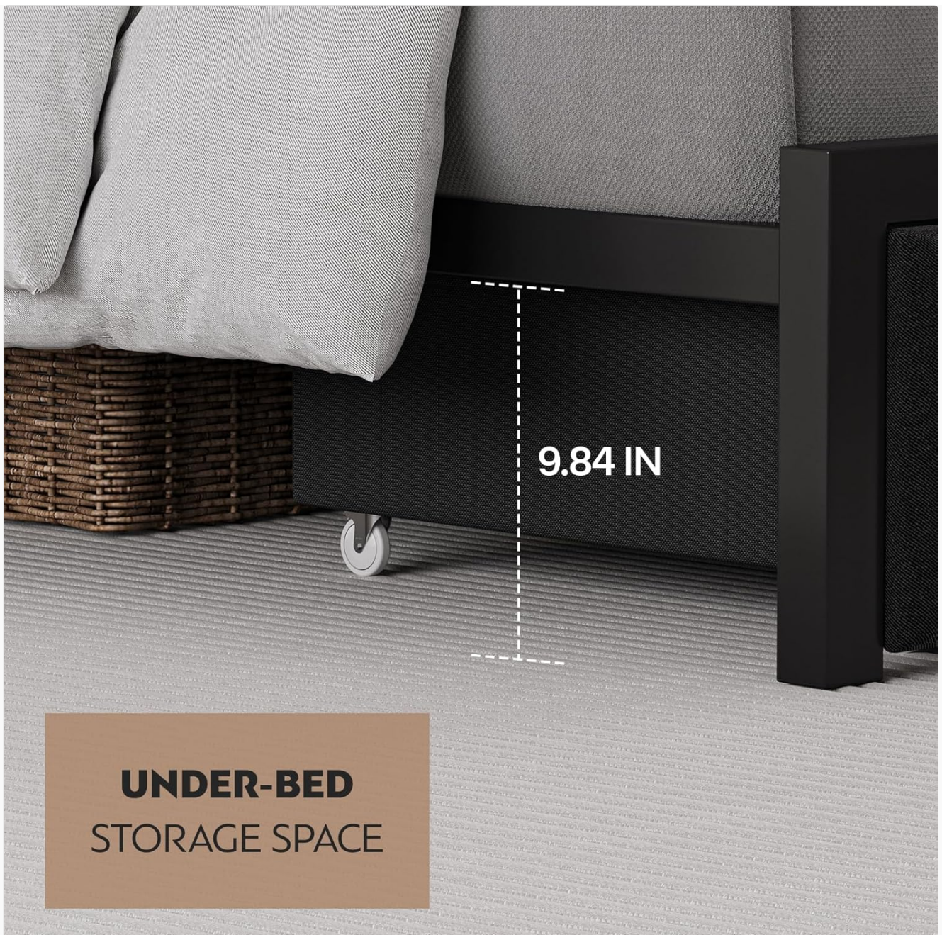
Image 5.2: Measurement indicating 9.84 inches of under-bed clearance, highlighting the space available for storage.