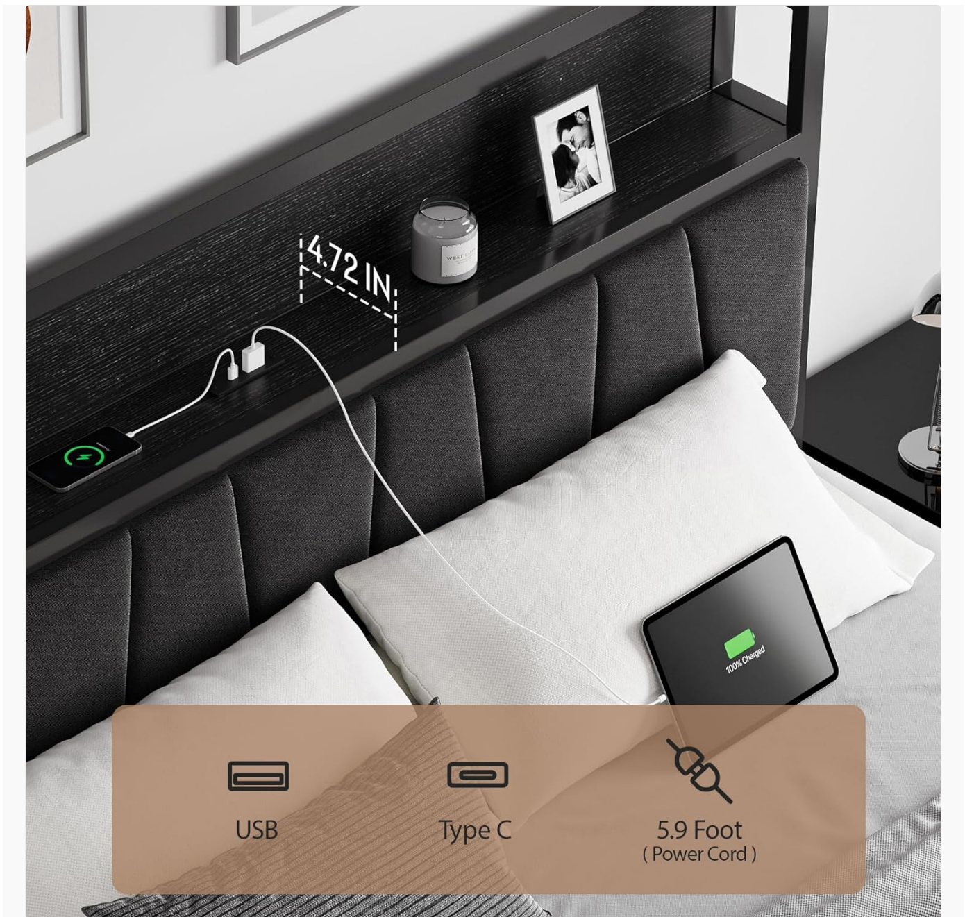
Image 4.1: Detail of the headboard's integrated charging station, featuring USB and Type-C ports, and a power cord.