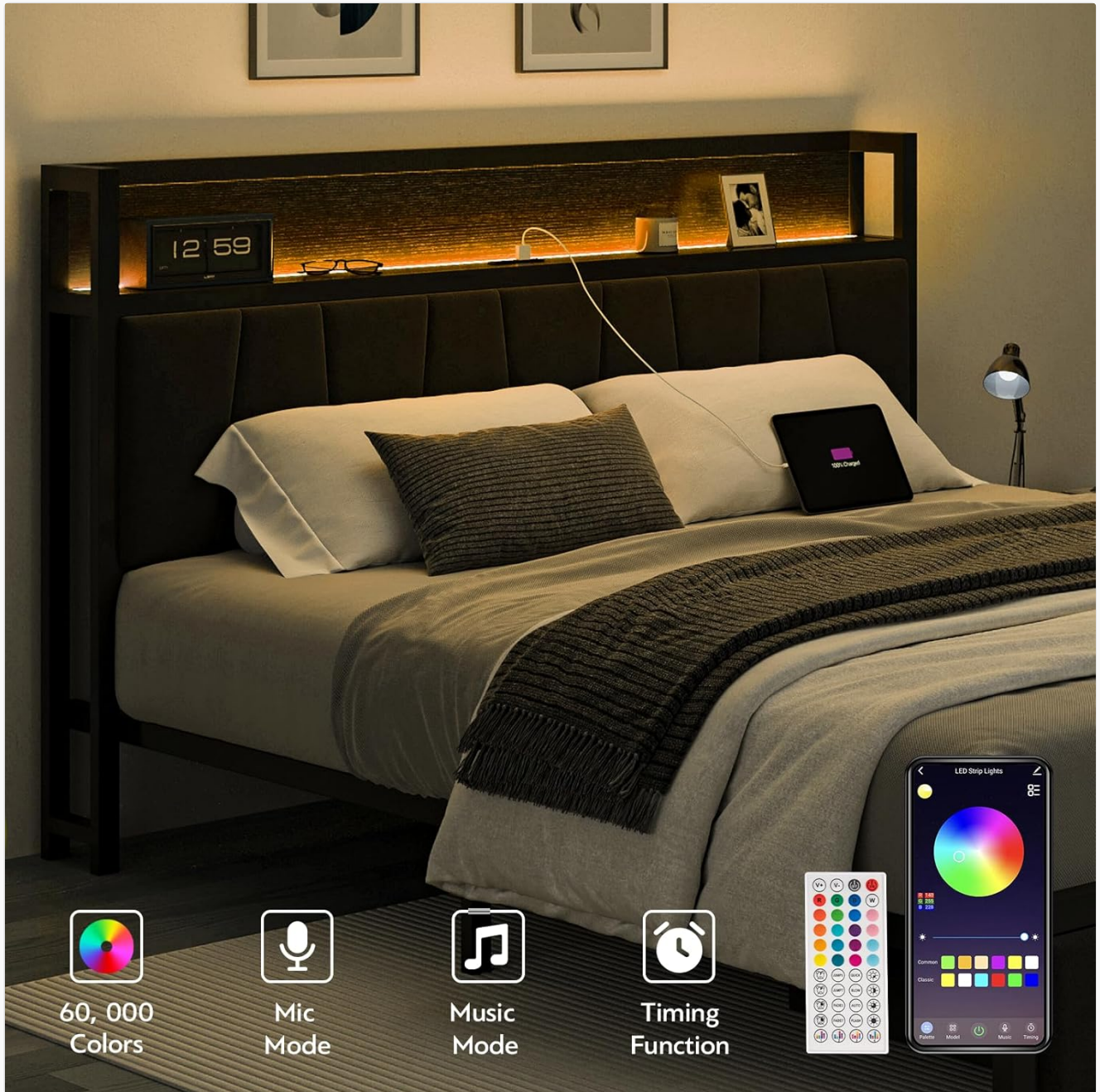
Image 5.1: Illustration of the LED light features, including 60,000 colors, Mic Mode, Music Mode, and Timing Function, controllable via remote or app.