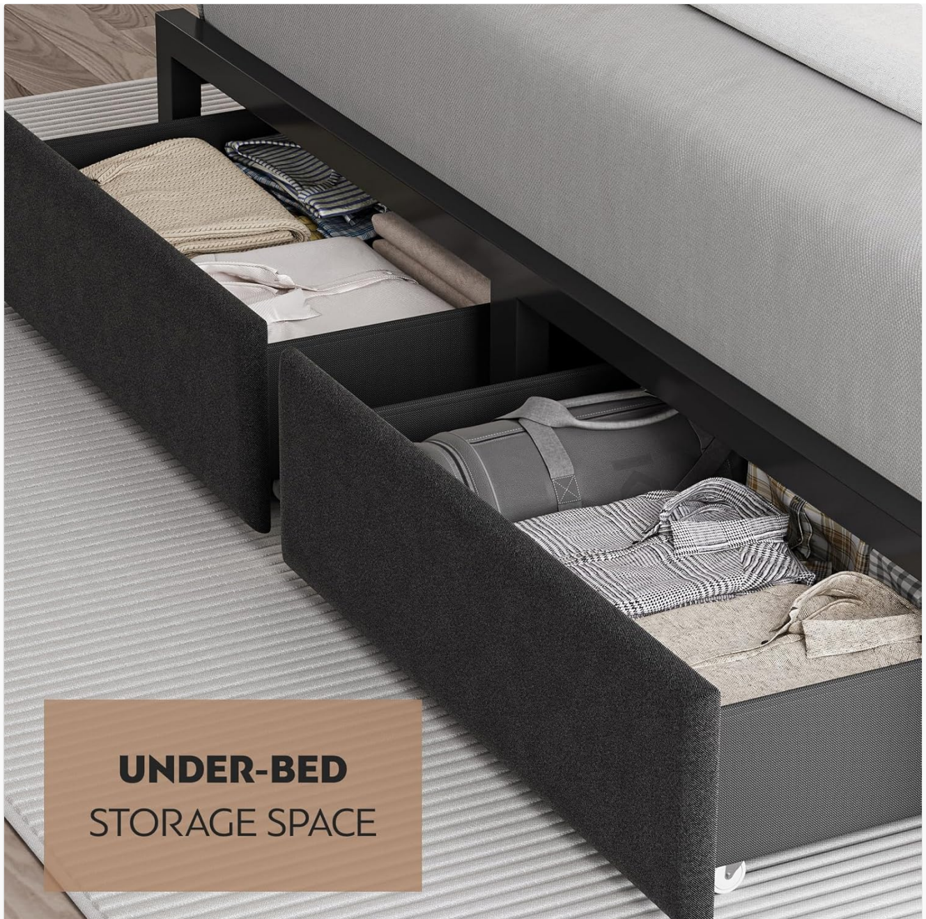
Image 4.2: View of the two fabric storage drawers pulled out from under the bed frame, showing ample space for various items.