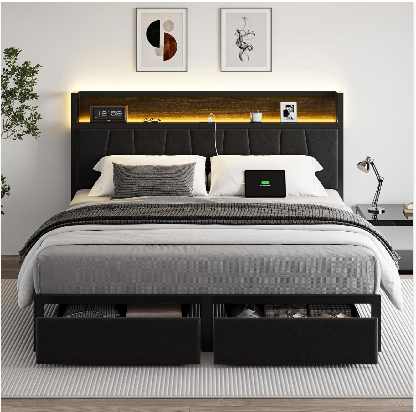
Image 1.1: Overview of the CIKUNASI Queen Size Bed Frame, showcasing the headboard with integrated lighting and charging station, and under-bed storage drawers.