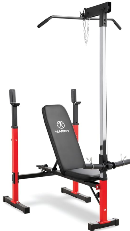
Lat Tower ( ACC-8048LT )