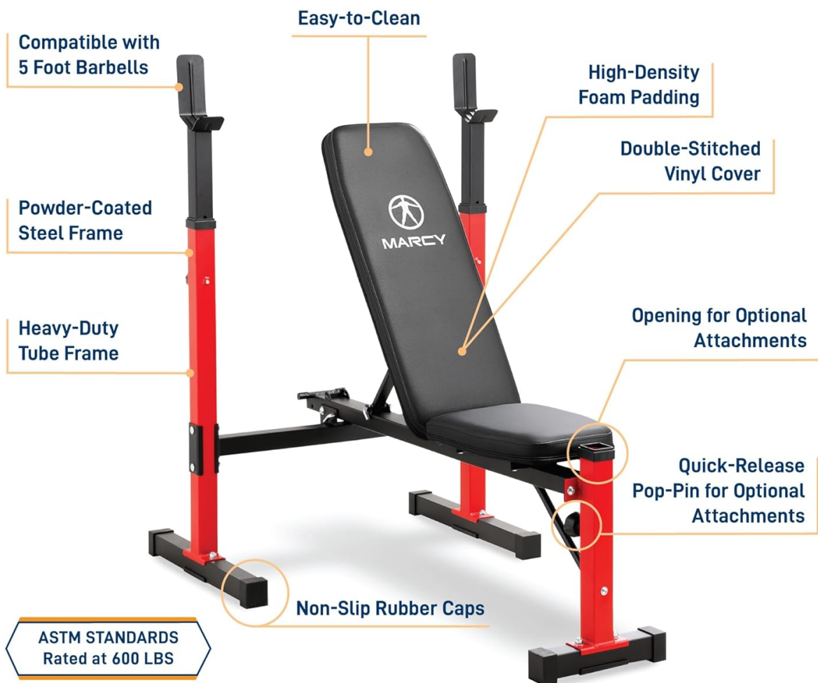
Image: Diagram highlighting construction features such as powder-coated steel frame, high-density foam padding, double-stitched vinyl cover, non-slip rubber caps, and openings for optional attachments.