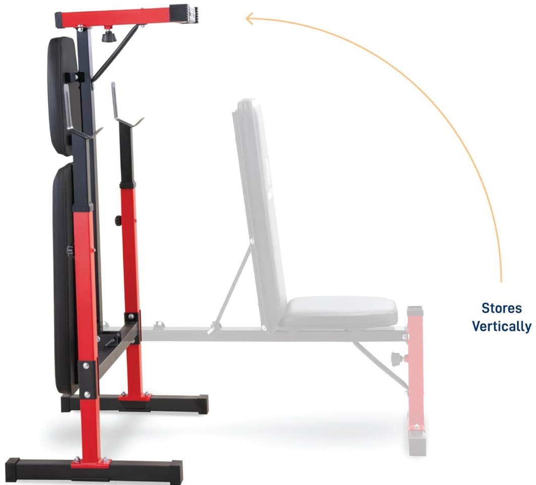
Image: Depiction of the weight bench folding vertically for compact storage, showing the transition from an open to a folded state.