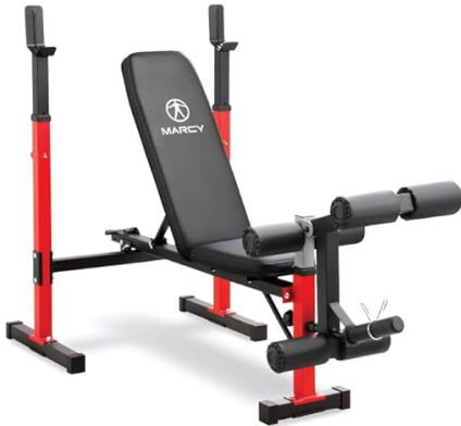
Leg Developer ( ACC-8116LD )