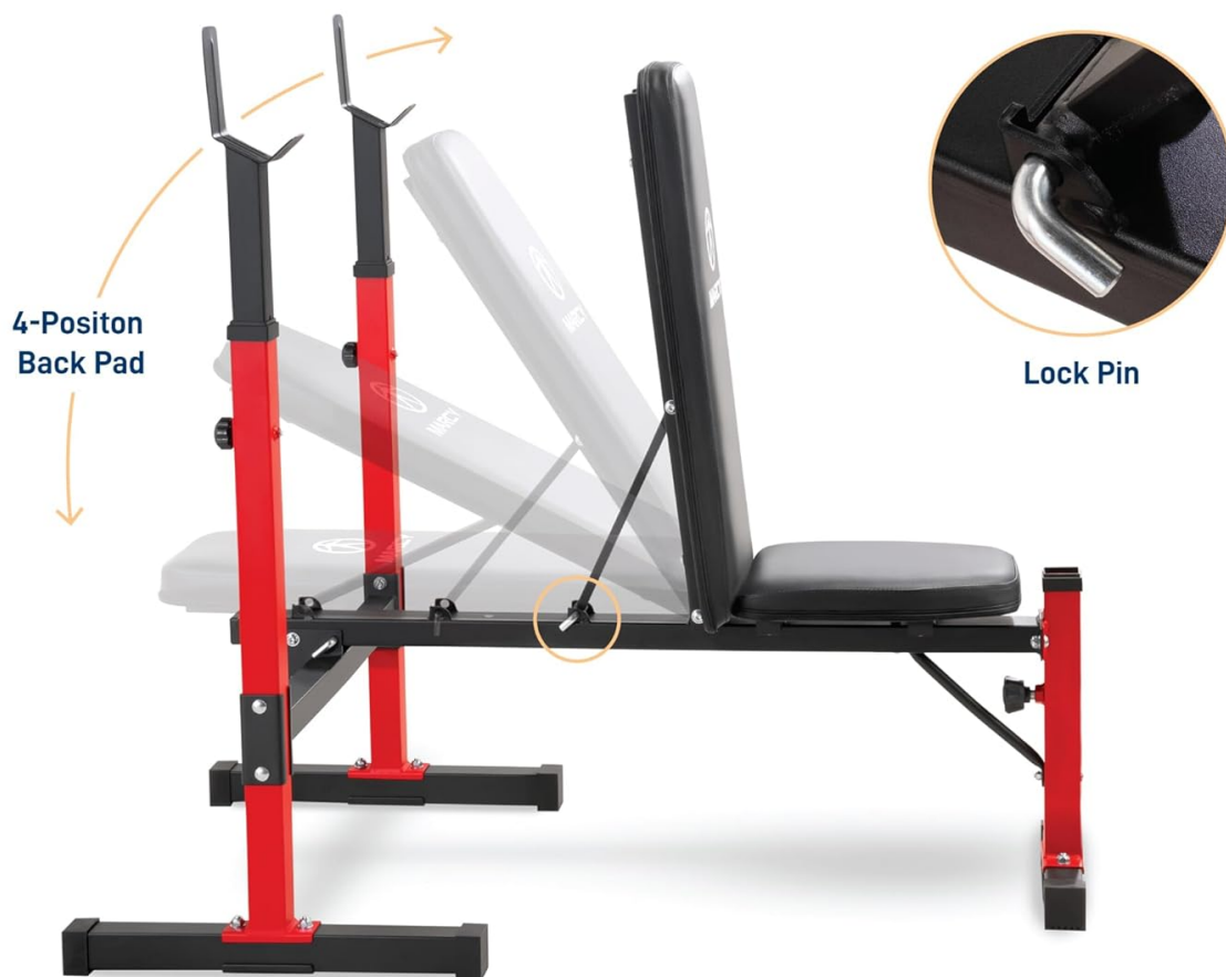
Image: Illustration showing the 4-position adjustable back pad and the lock pin used for adjustment.