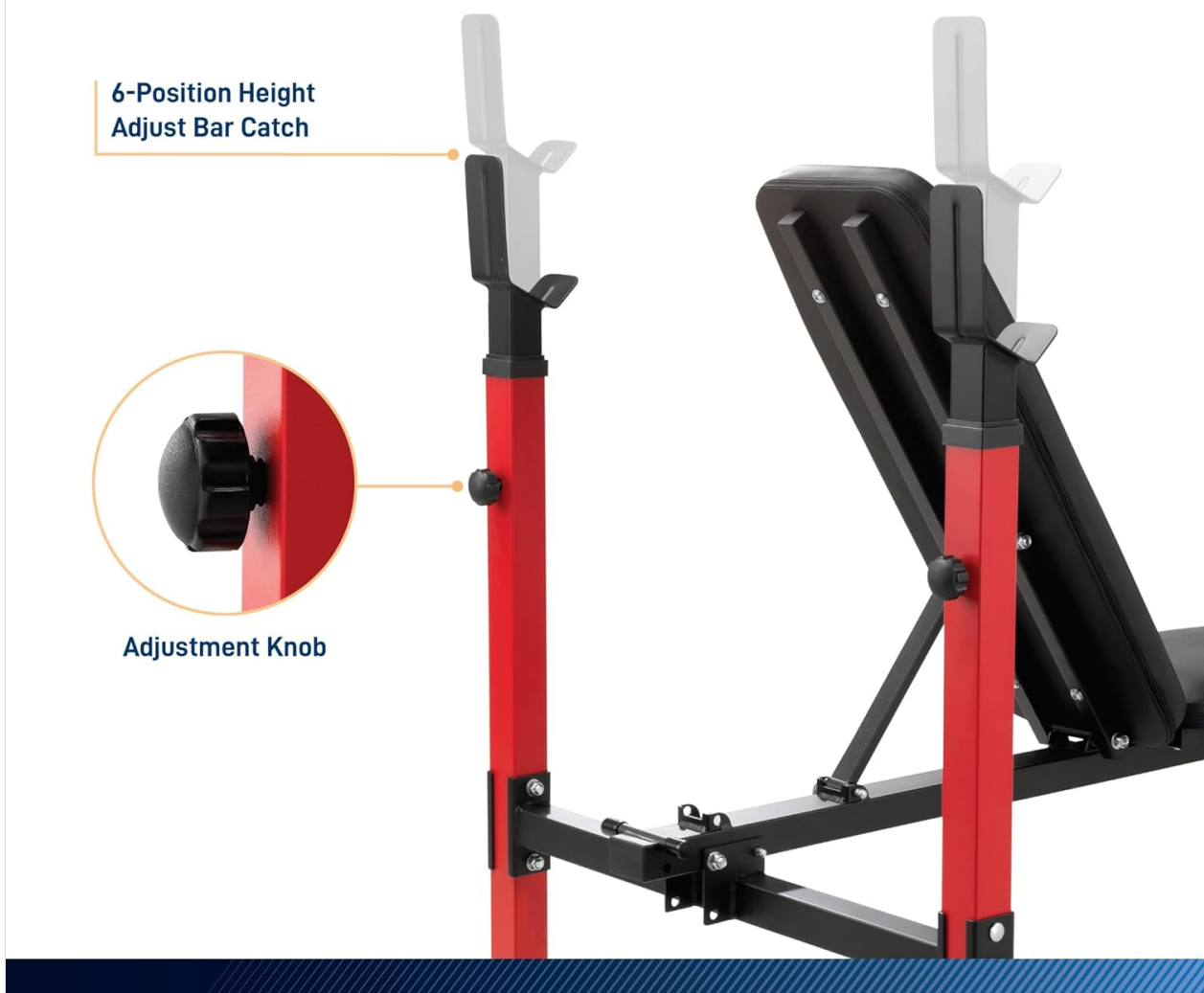
Image: Close-up view of the adjustable bar catch mechanism, highlighting the adjustment knob and the 6-position height settings.