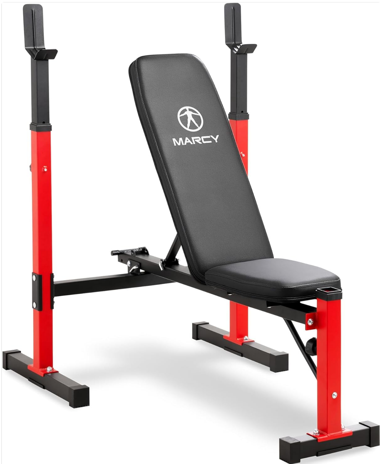
Image: The Marcy Foldable Deluxe Standard Weight Bench, showcasing its black and red frame with a padded bench and adjustable bar catches.