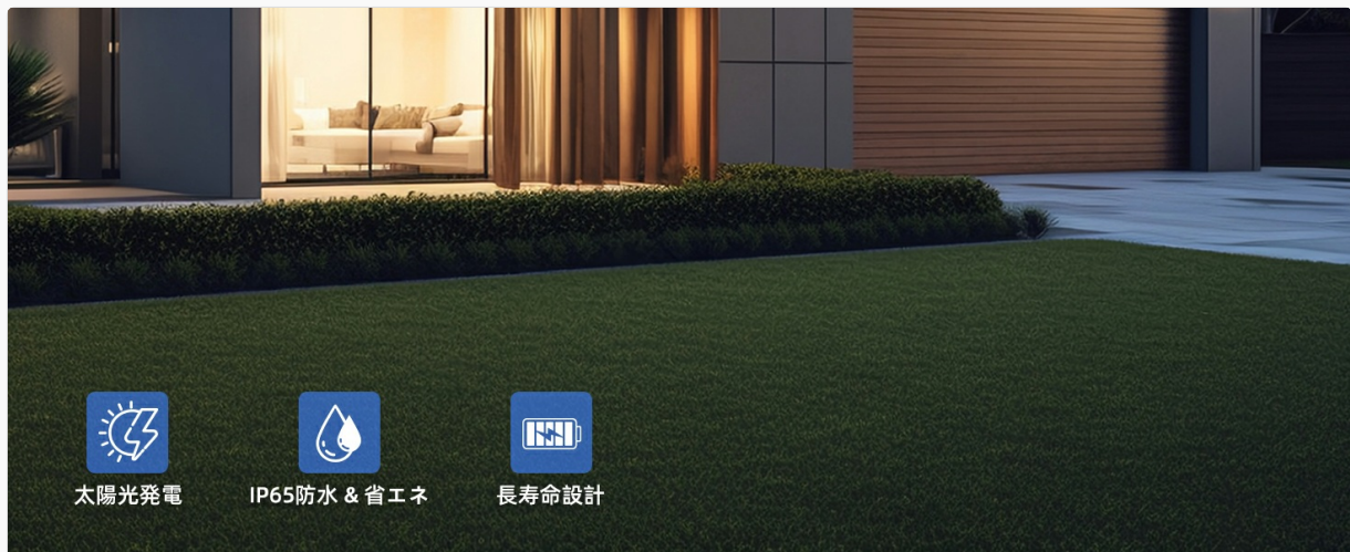
Figure 6: Automatic charging and lighting cycle.