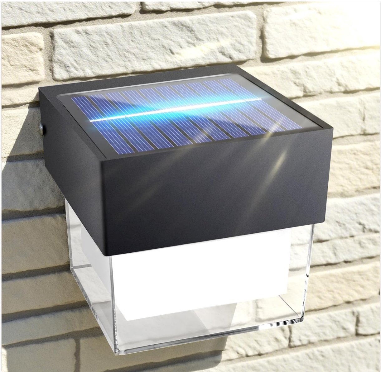
Figure 5: Solar panel for charging.