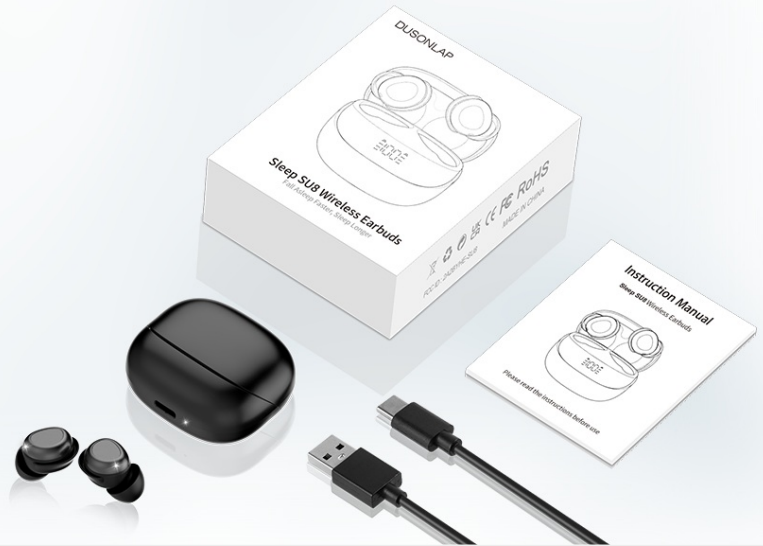
Image: A visual representation of all items included in the DUSONLAP SU8 Sleep Earbuds package, including the earbuds, charging case, USB-C cable, and user guide.

Upon opening your DUSONLAP SU8 Sleep Earbuds package, please verify that all the following components are included: