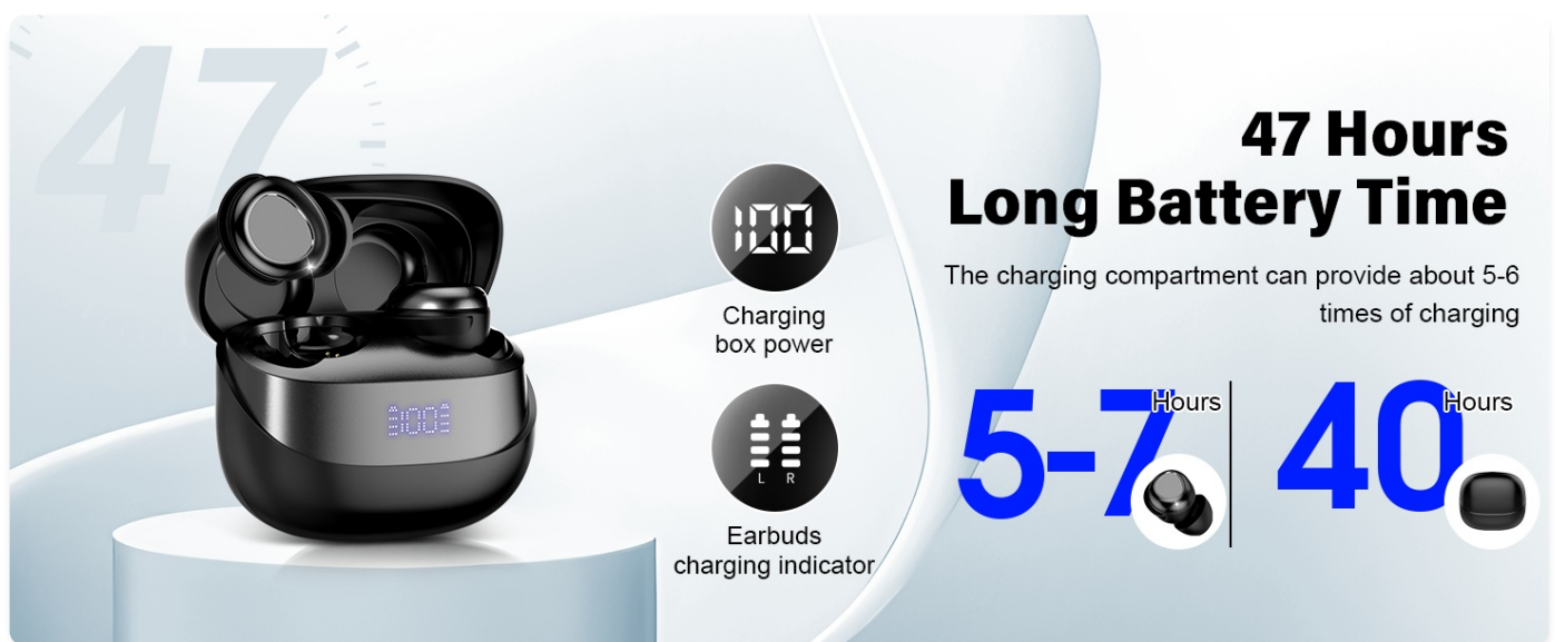
Image: Visual guide to the SU8 earbuds' battery life, showing the charging case's digital power display and individual earbud charging indicators.