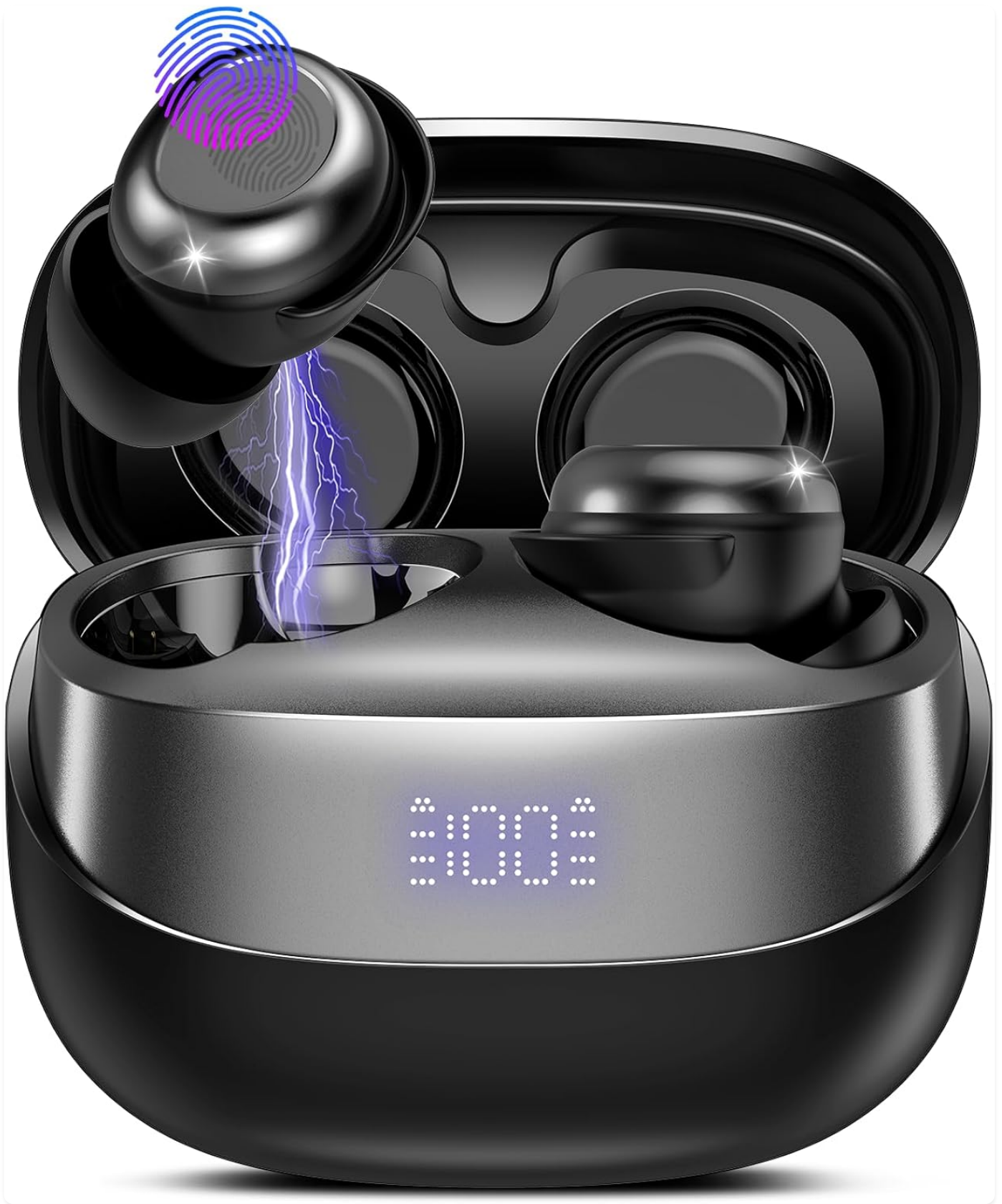
Image: DUSONLAP SU8 Sleep Earbuds in their charging case, showcasing their compact design and digital display.

Welcome to the DUSONLAP SU8 Sleep Earbuds user manual. These lightweight, in-ear headphones are designed to provide a comfortable and immersive audio experience, particularly for sleep and relaxation. Featuring advanced Bluetooth 5.4 technology, they offer stable connectivity and superior sound quality. This manual will guide you through the setup, operation, maintenance, and troubleshooting of your new earbuds to ensure optimal performance and a peaceful listening experience.