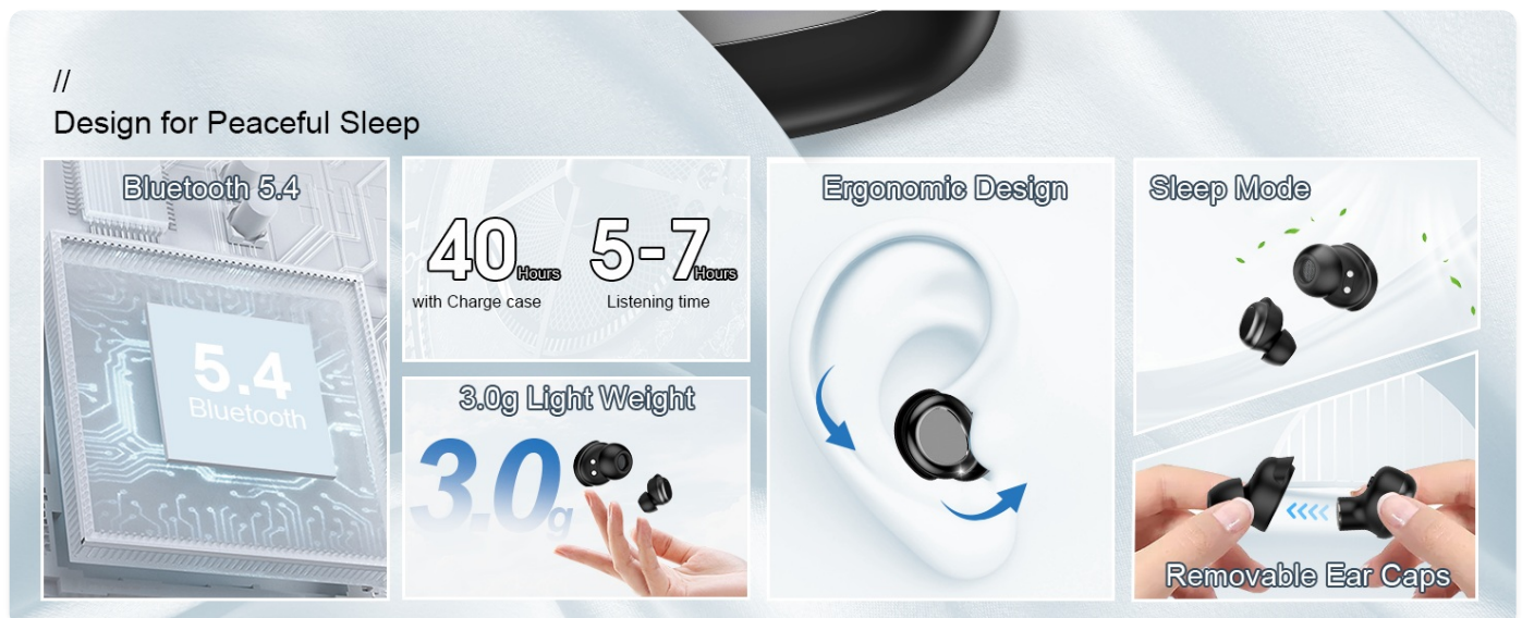
Image: An illustration highlighting key design features of the SU8 earbuds, including Bluetooth 5.4, battery life, lightweight design, ergonomic fit, sleep mode, and removable ear caps.

The DUSONLAP SU8 Sleep Earbuds are engineered for comfort and performance, especially during extended wear or sleep. Key features include: