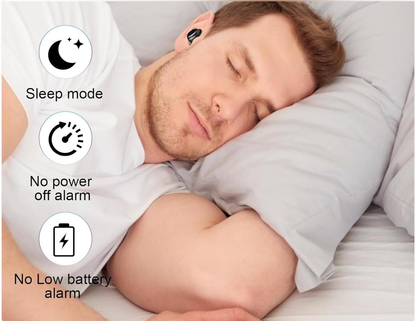
Image: A person sleeping peacefully with the SU8 earbuds, accompanied by icons indicating Sleep Mode, No Power Off Alarm, and No Low Battery Alarm.

It will automatically connect when the lid is opened.