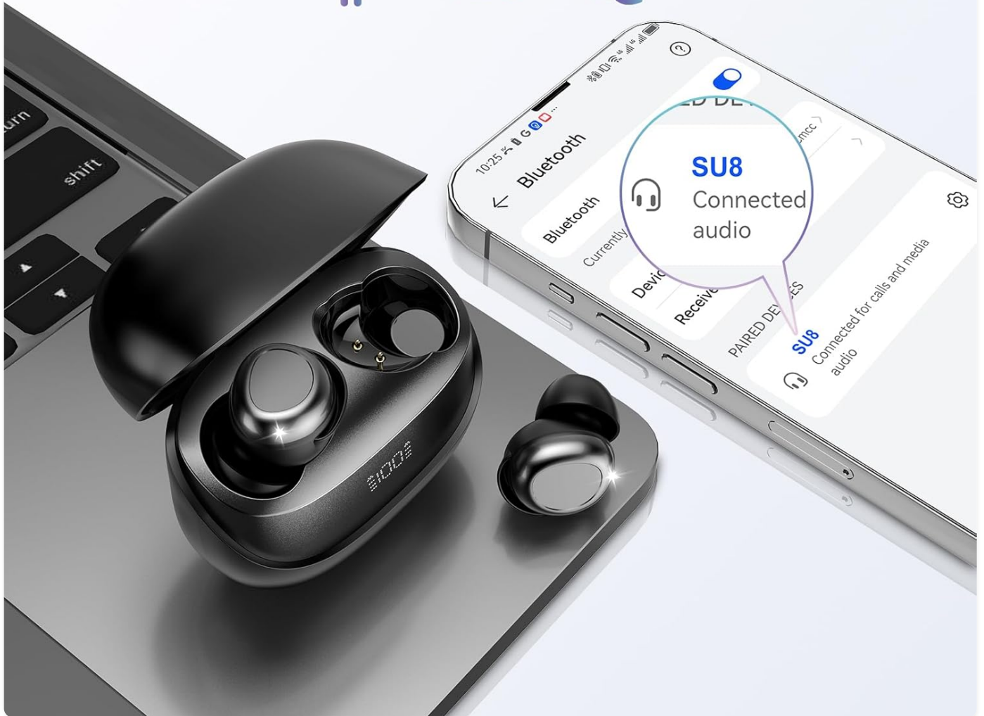
Image: The SU8 earbuds in their open charging case next to a smartphone displaying the Bluetooth pairing screen, showing "SU8 Connected audio".