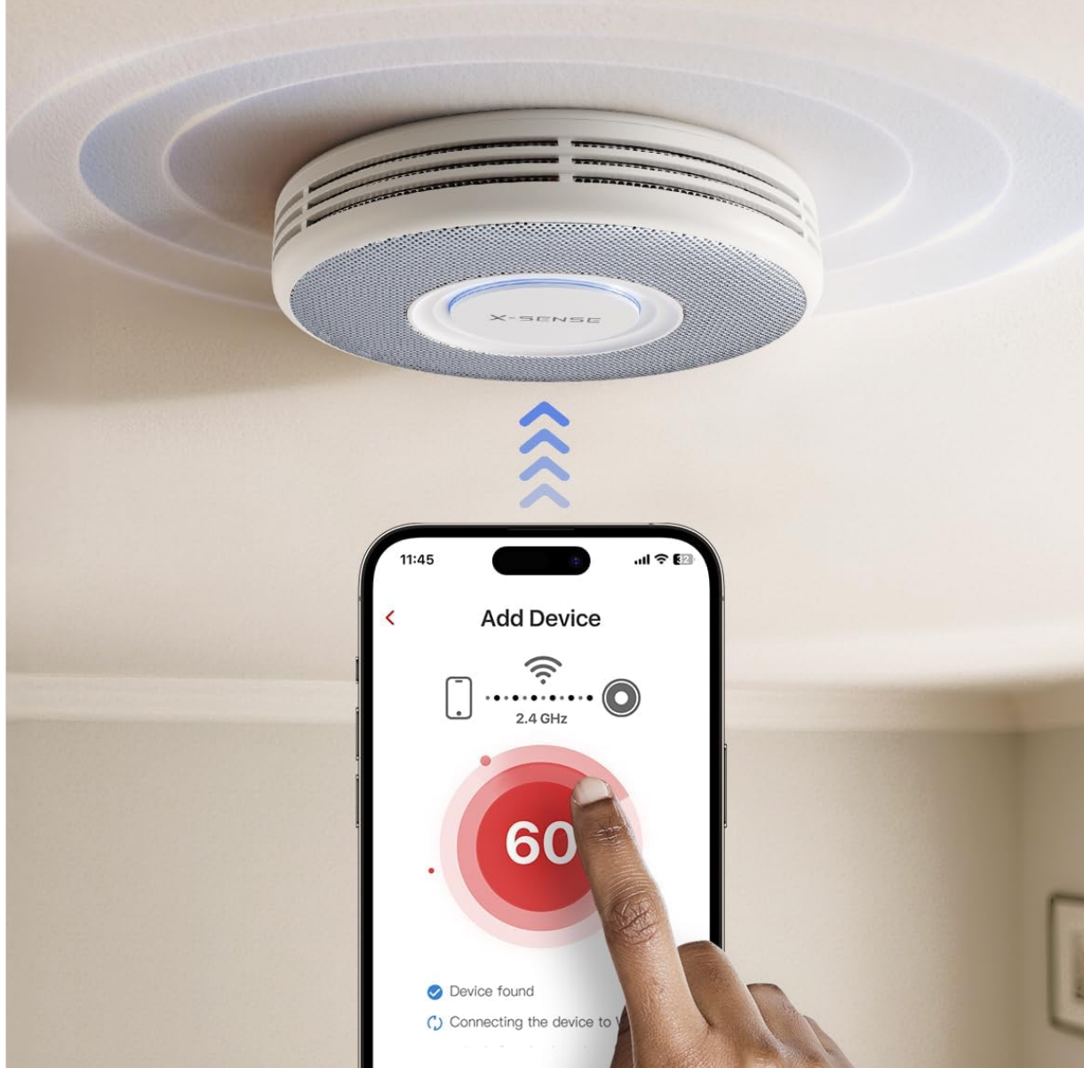
Image 4.2: The X-Sense smoke detector connecting directly to a 2.4 GHz Wi-Fi network via the X-Sense app.

Only 2.4GHz Wi-Fi is supported and the device should be kept within Wi-Fi coverage.