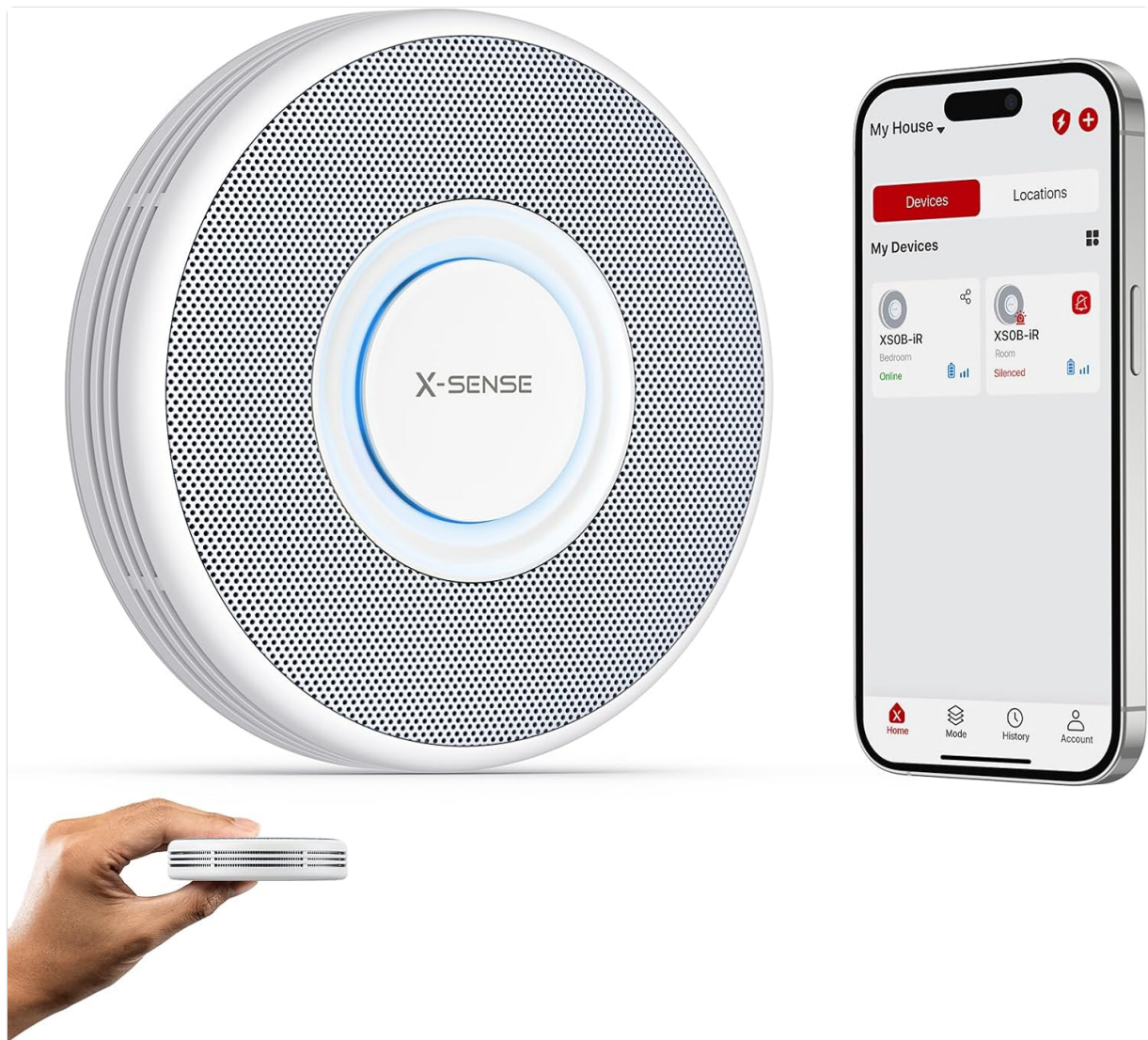
Image 1.1: The X-Sense Smart Wi-Fi Smoke Detector XS0B-iR shown alongside its mobile application interface.