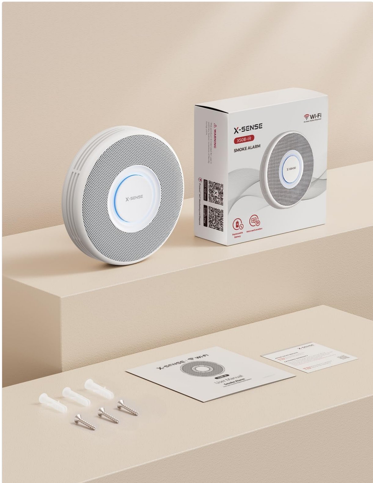
Image 3.1: The X-Sense XS0B-iR smoke detector, its packaging, user manual, and mounting accessories.