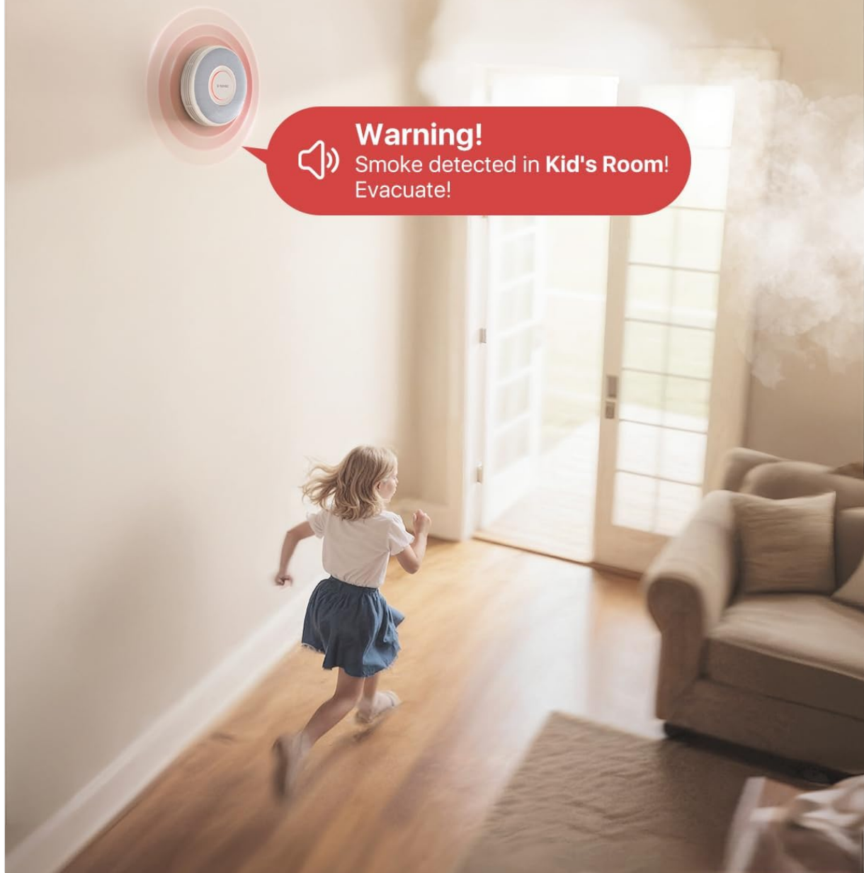
Image 5.1: The smoke detector activating a voice alert, indicating the specific location of smoke detection.