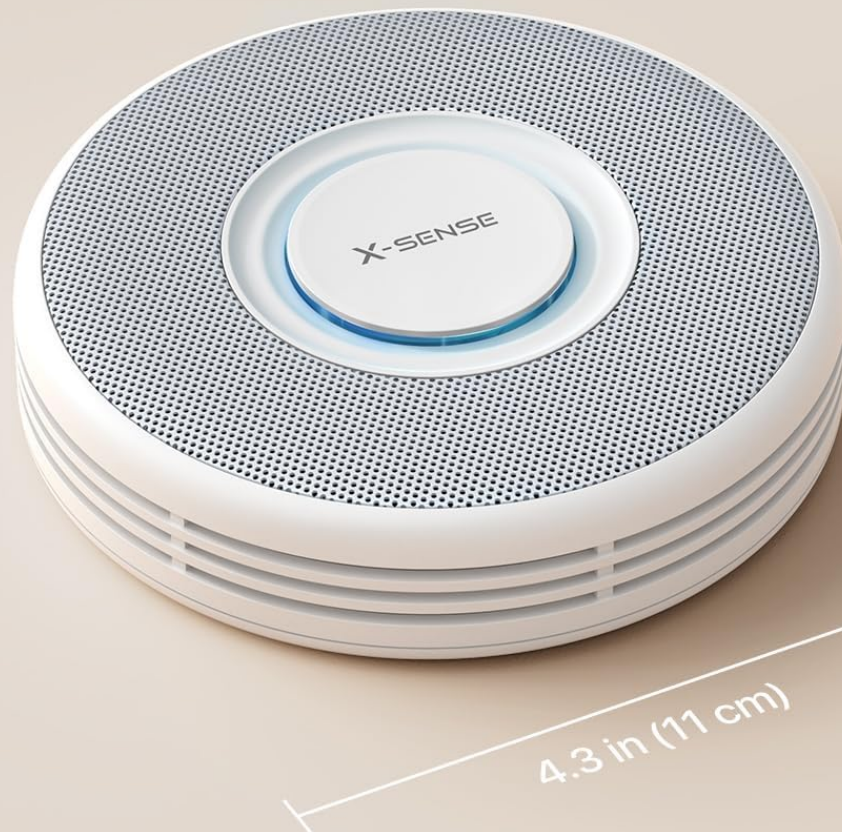
Image 6.1: The detector uses a replaceable CR123A battery and features a 10-year sensor life.