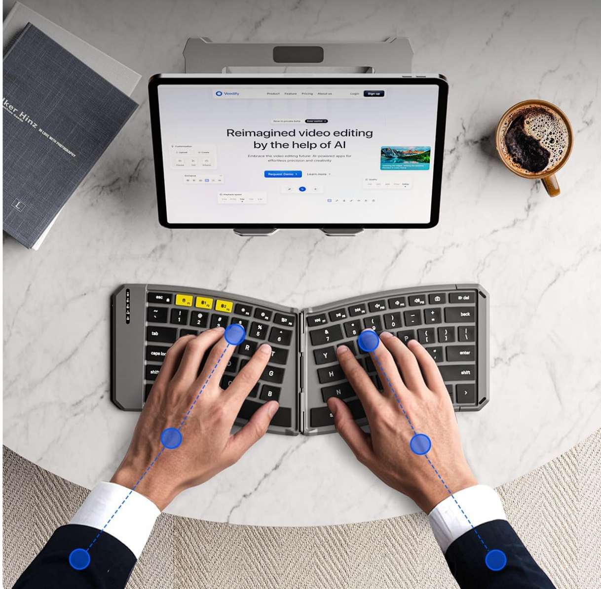
Image: Hands positioned on the ergonomic split keyboard, illustrating comfortable typing posture.

Its more natural posture dramatically reduces arm fatigue for immersive typing experience!