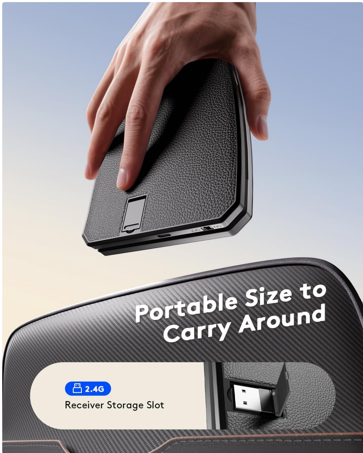
Image: The 2.4G USB receiver being removed from its storage slot on the keyboard.