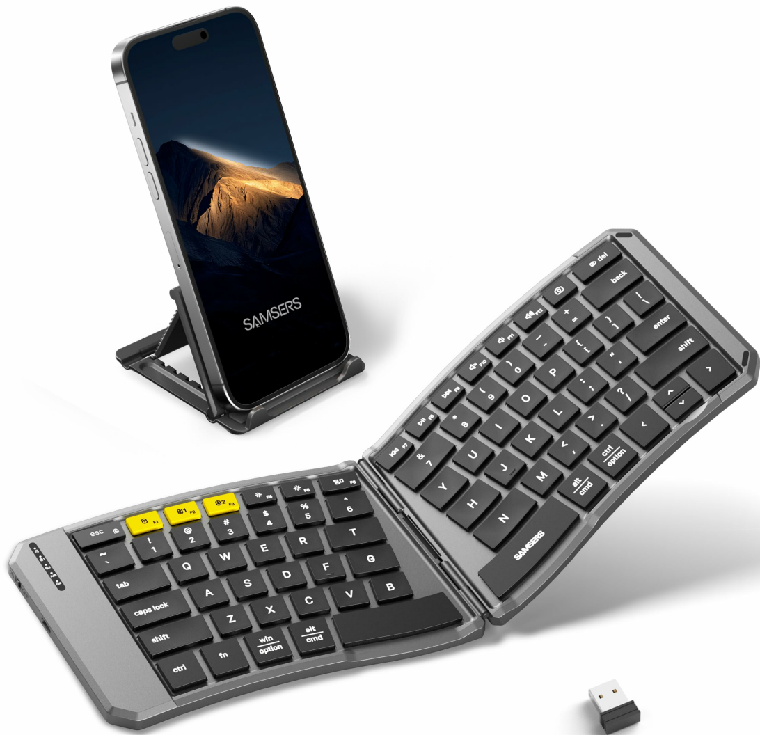
Image: The Samsers Ergonomic Foldable Keyboard KE09U in its unfolded state, showcasing its ergonomic design.