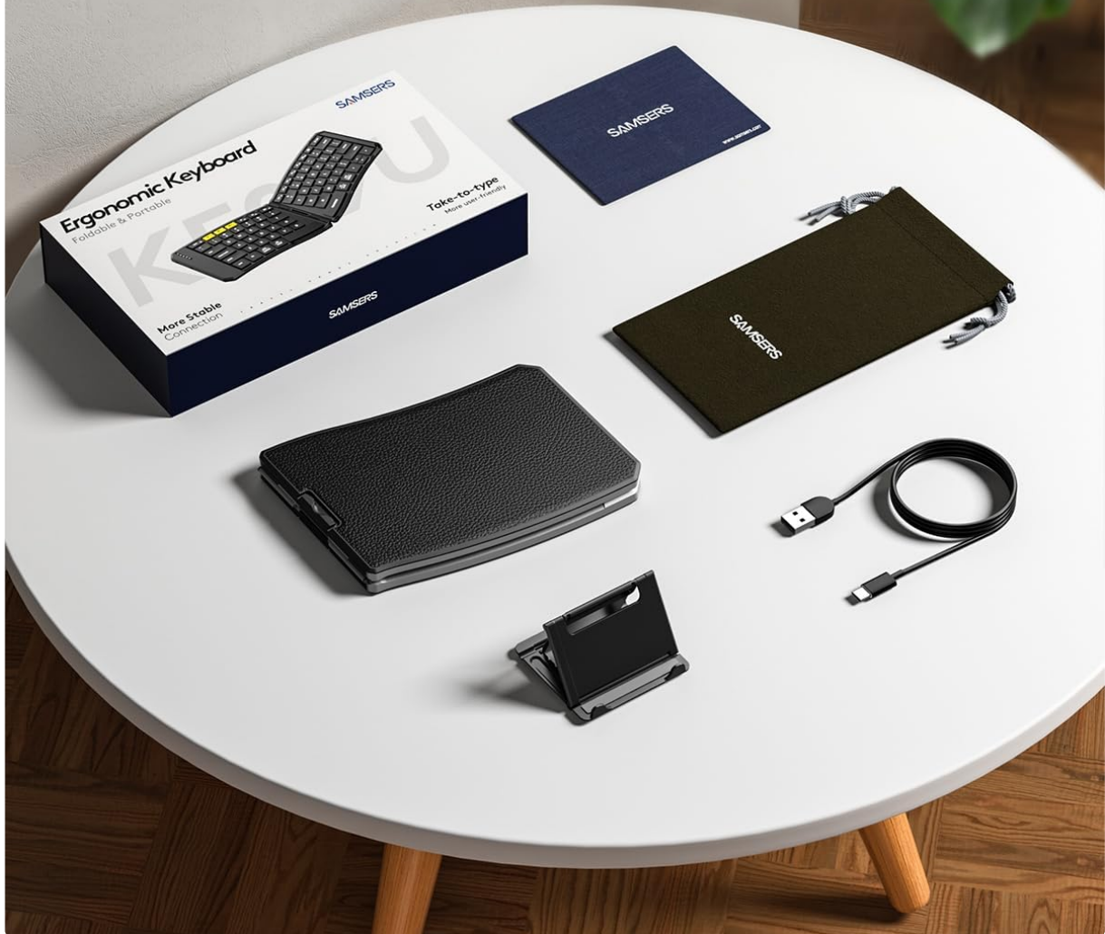
Image: All items included in the Samsers KE09U package: keyboard, manual, charging cable, stand holder, and velvet pouch.