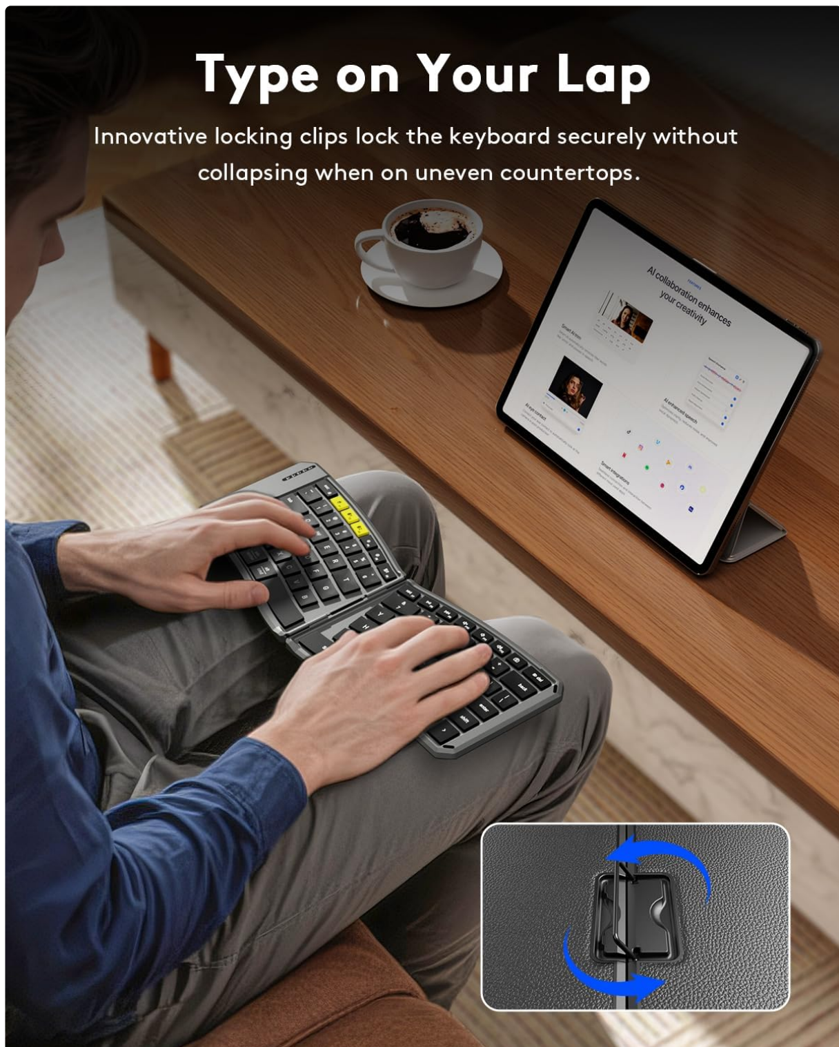
Image: A user typing on the Samsers KE09U keyboard while it rests on their lap, demonstrating its stability and portability.

The ergonomic split design of the KE09U keyboard allows for a more natural hand and wrist position, reducing fatigue during prolonged typing. The low-profile, scissor-switch keys provide a responsive and comfortable typing feel, similar to a laptop keyboard.