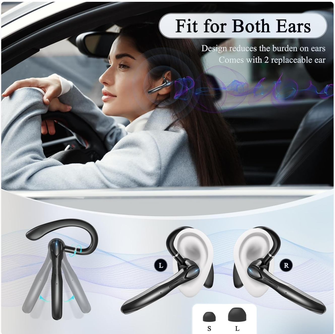
Image 4.2: The Sisism Bluetooth Headset I33 demonstrating its adaptability for both left and right ears, along with the included small (S) and large (L) replaceable eartips for a customized fit.