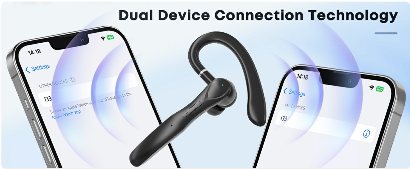
Image 3.3: The Sisim Bluetooth Headset I33 demonstrating its dual device connection capability, showing it wirelessly linked to two separate smartphones.