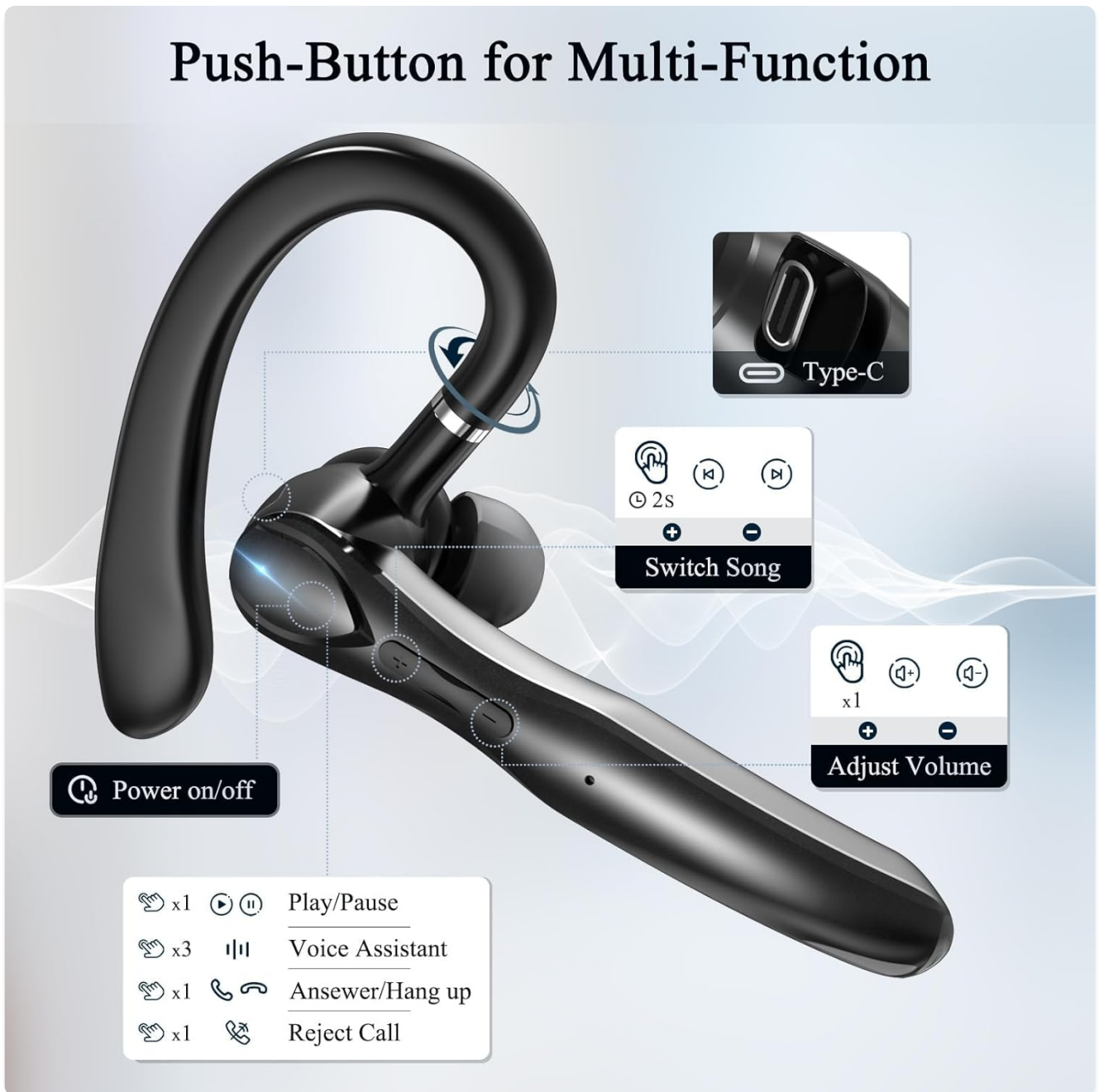
Image 4.1: An illustration detailing the multi-function button controls on the Sisism Bluetooth Headset I33, including power on/off, play/pause, voice assistant, answer/hang up, reject call, and volume adjustment.