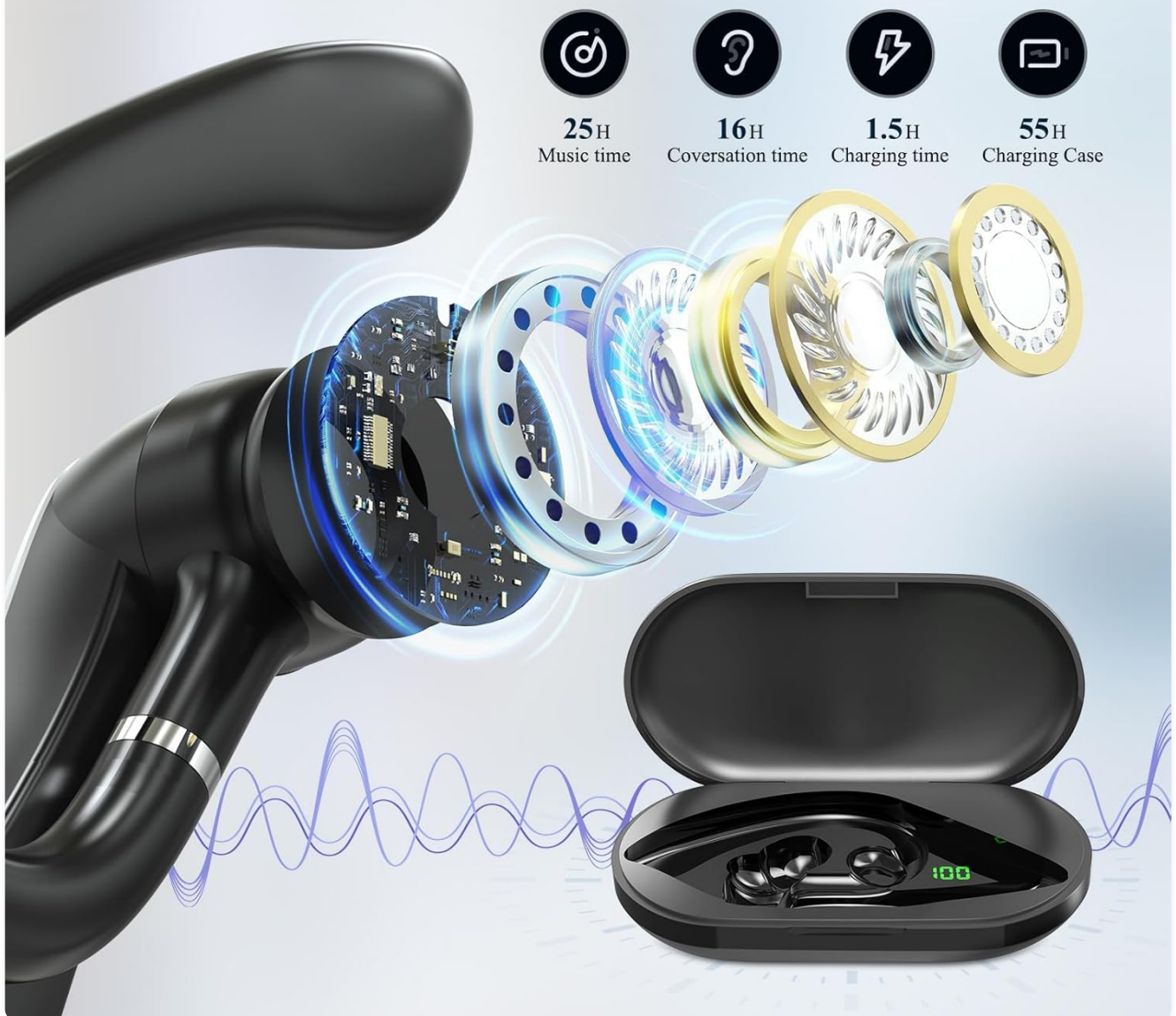
Image 3.1: The Sisim Bluetooth Headset I33 charging case with its LED digital display, indicating approximate music time (25H), conversation time (16H), charging time (1.5H), and total charging case capacity (55H).