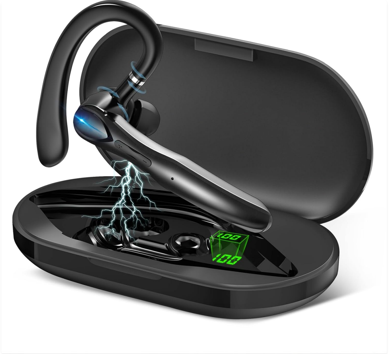
Image 2.1: The Sisim Bluetooth Headset I33 shown with its charging case, illustrating the main components included in the package.