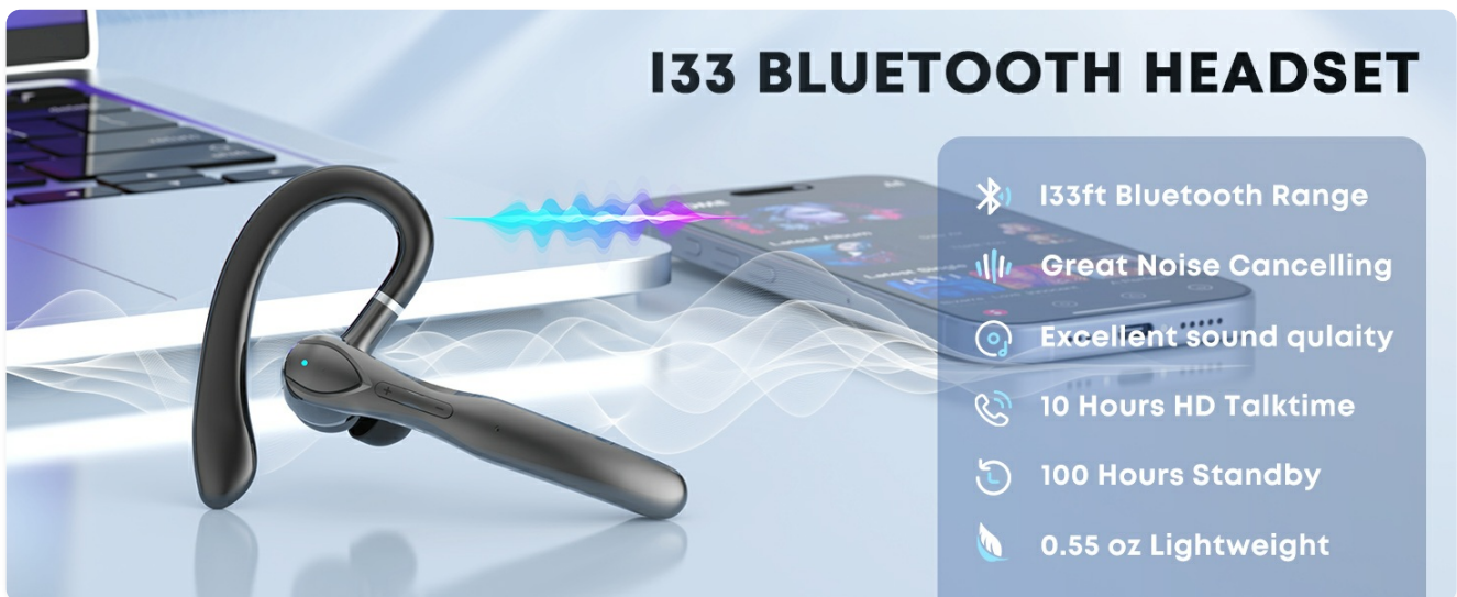
Image 1.1: Sisism I33 Bluetooth Headset highlighting its 33ft Bluetooth Range, Noise Cancelling, Excellent Sound Quality, 10 Hours HD Talktime, 100 Hours Standby, and 0.55 oz Lightweight design.

This manual provides detailed instructions for the proper use and maintenance of your Sisism Bluetooth Headset I33. Please read this manual thoroughly before using the product to ensure optimal performance and longevity.