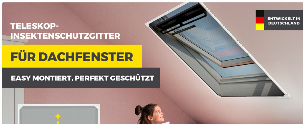
Image: A graphic illustrating the pre-assembled, extendable frame with integrated net, highlighting that no cutting or waste is required.

The frame comes pre-assembled with the net already integrated, eliminating the need for cutting or waste. The frame is extendable, allowing the net to adapt to your window dimensions.