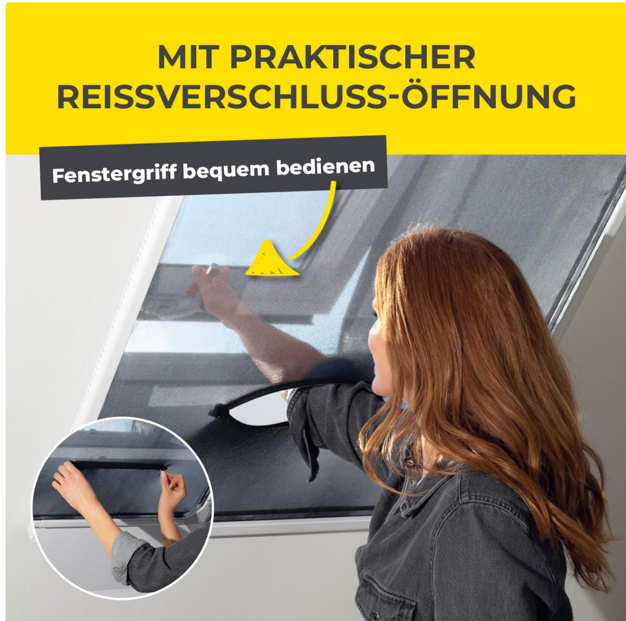
Image: A user reaching through the integrated zipper opening to comfortably operate the window handle, demonstrating the screen's practical design.

A practical zipper opening is integrated into the net, allowing you to access the window handle at any time without removing the entire screen. This ensures that opening, tilting, and shock ventilation of your window remain effortlessly possible.