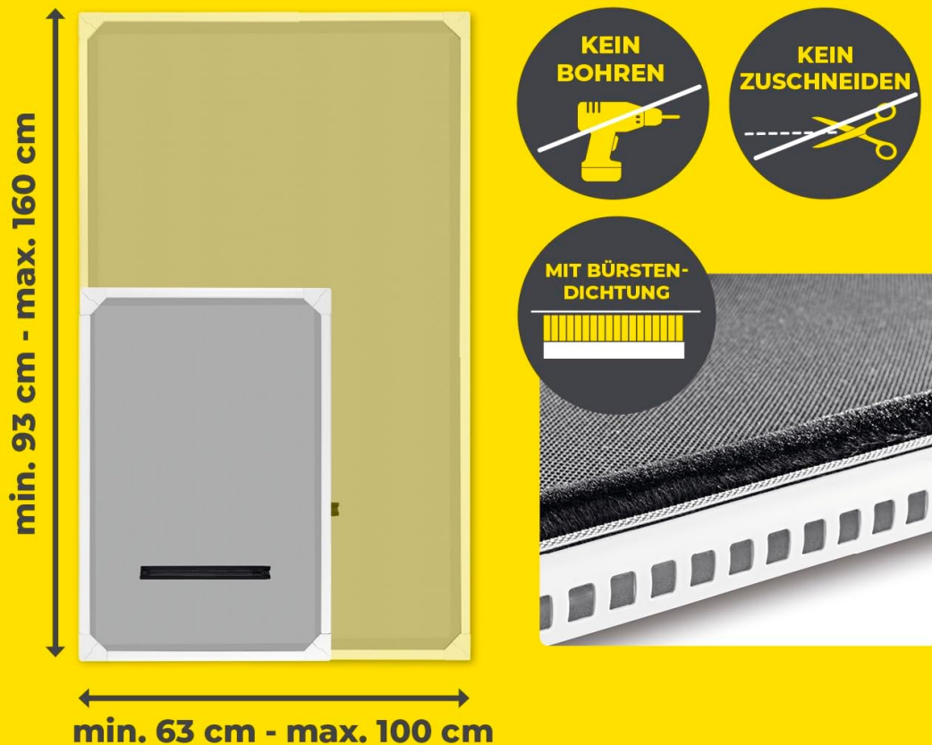
Image: A visual representation of the fly screen's adjustable dimensions (min. 63 cm - max. 100 cm width, min. 93 cm - max. 160 cm height), emphasizing no drilling or cutting, and the inclusion of a brush seal.