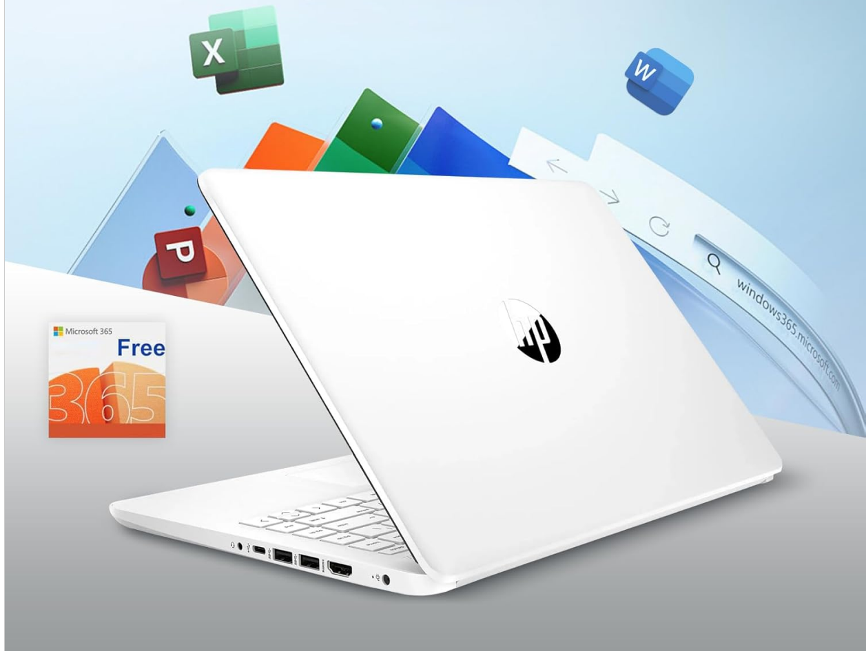
Image 3: The HP 14 inch Student Laptop highlighting the inclusion of a 1-year free Microsoft 365 subscription.

Boost your creativity with Microsoft 365 Office, now including smart features to help your work shine. Powerful tools help you work or study.