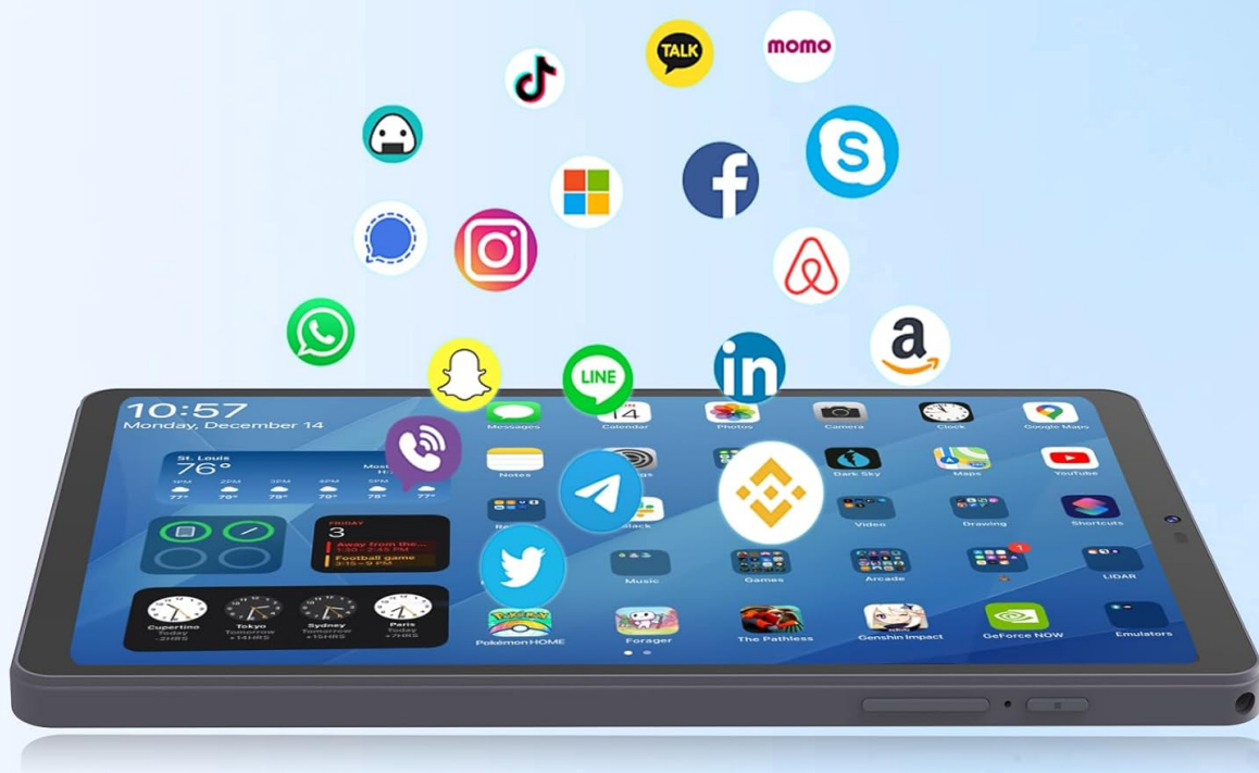
Image: The tablet screen showing numerous app icons, illustrating ample space for applications, photos, and videos with 11GB RAM, 64GB ROM, and 1TB expandable storage.