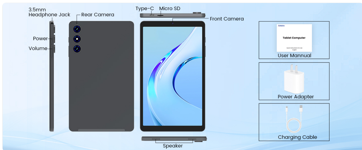
Image: Diagram illustrating the tablet, charger, USB Type-C cable, and user manual as included accessories.