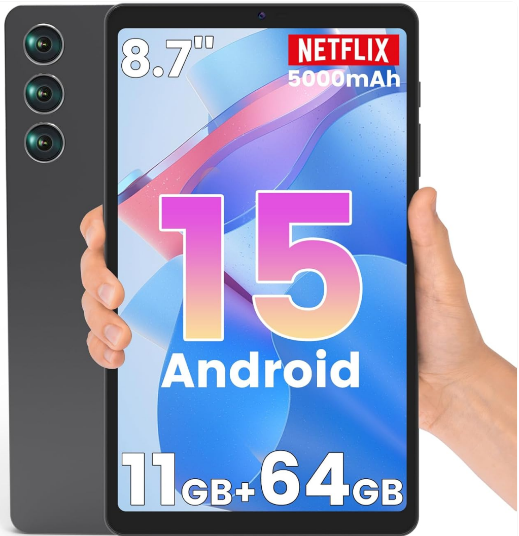
Image: Front and back view of the Azeyou F27 Mini Tablet, highlighting its compact design and camera placement.