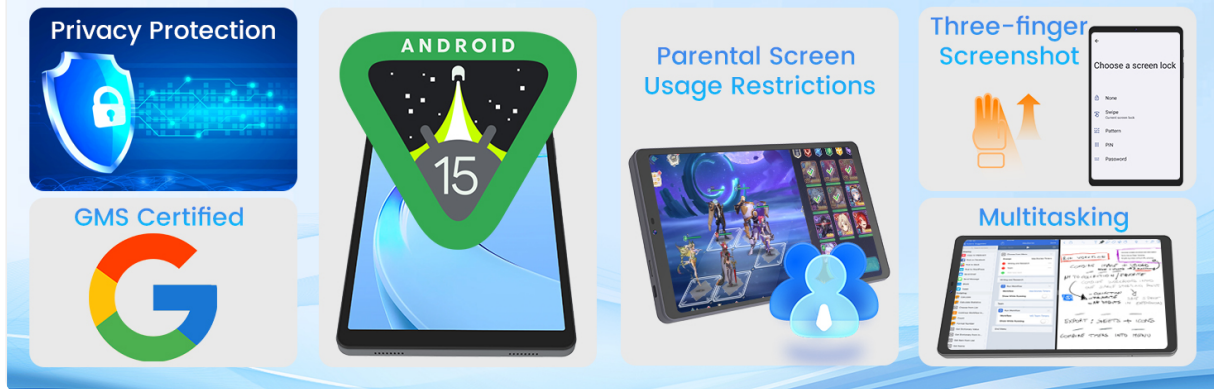
Image: A visual overview of Android 15 operating system features, including Privacy Protection, GMS Certification, Parental Screen Usage Restrictions, Three-finger Screenshot, and Multitasking (Split Screen).