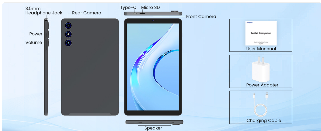
Image: Detailed diagram of the tablet's sides and top, indicating the location of the 3.5mm Headphone Jack, Power Button, Volume Buttons, Rear Camera, Type-C Port, Micro SD Card Slot, Front Camera, and Speakers.

Familiarize yourself with the physical components and ports of your Azeyou F27 Mini Tablet.