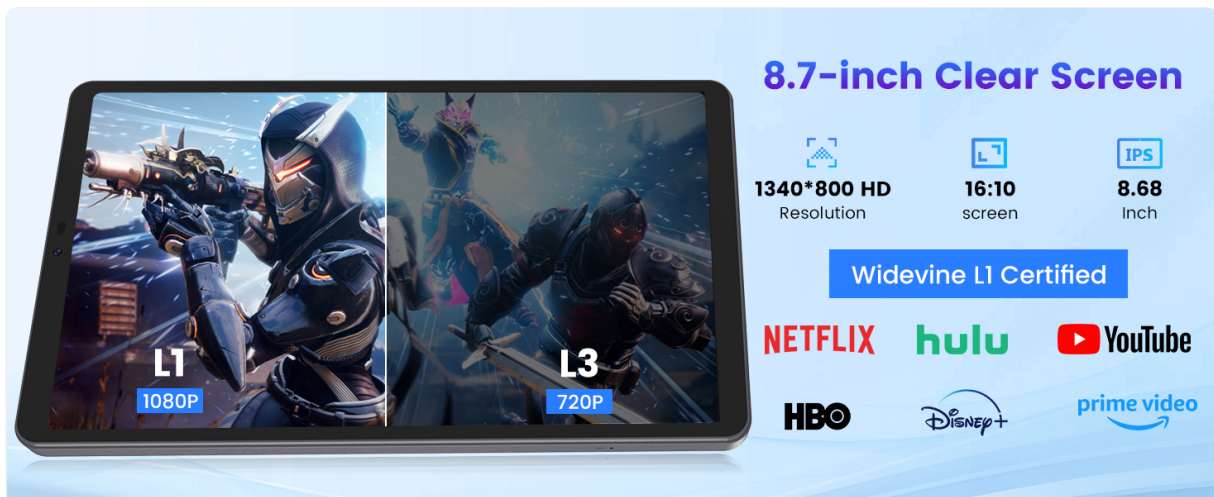
Image: The tablet screen showcasing its 8.7-inch HD display and Widevine L1 certification, indicating support for high-definition streaming on popular platforms.

The tablet supports Widevine L1, allowing you to stream high-definition content from platforms like Netflix, Prime Video, and Hulu.