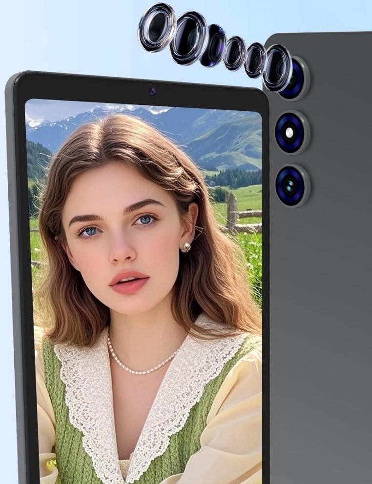
Image: Visual representation of the tablet's 8MP rear camera for sharper snapshots and 2MP front camera for reliable face-to-face connections, with example photos.

2MP Front Camera for reliable face-to-face connection