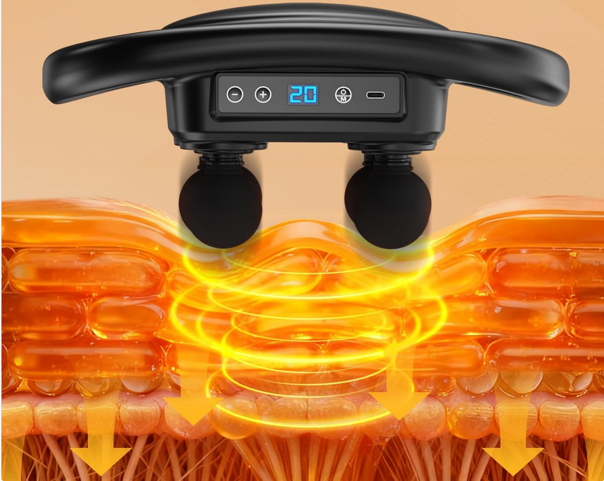
Figure 1: AERLANG EM21 Multi-Head Massage Gun.