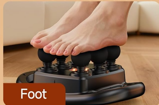
Figure 5: Examples of multi-area massage application.