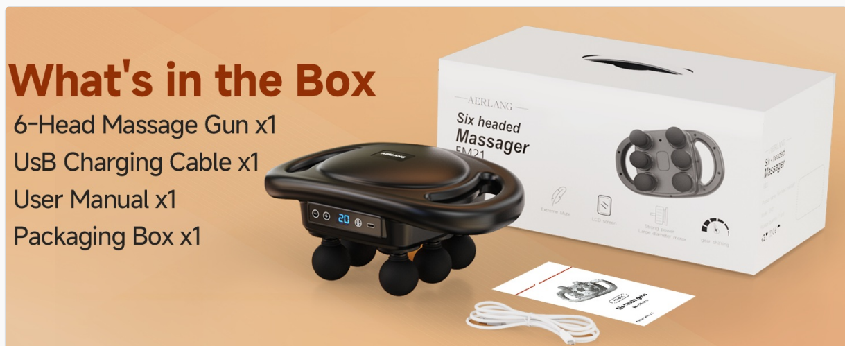
Figure 3: Contents of the AERLANG EM21 package.