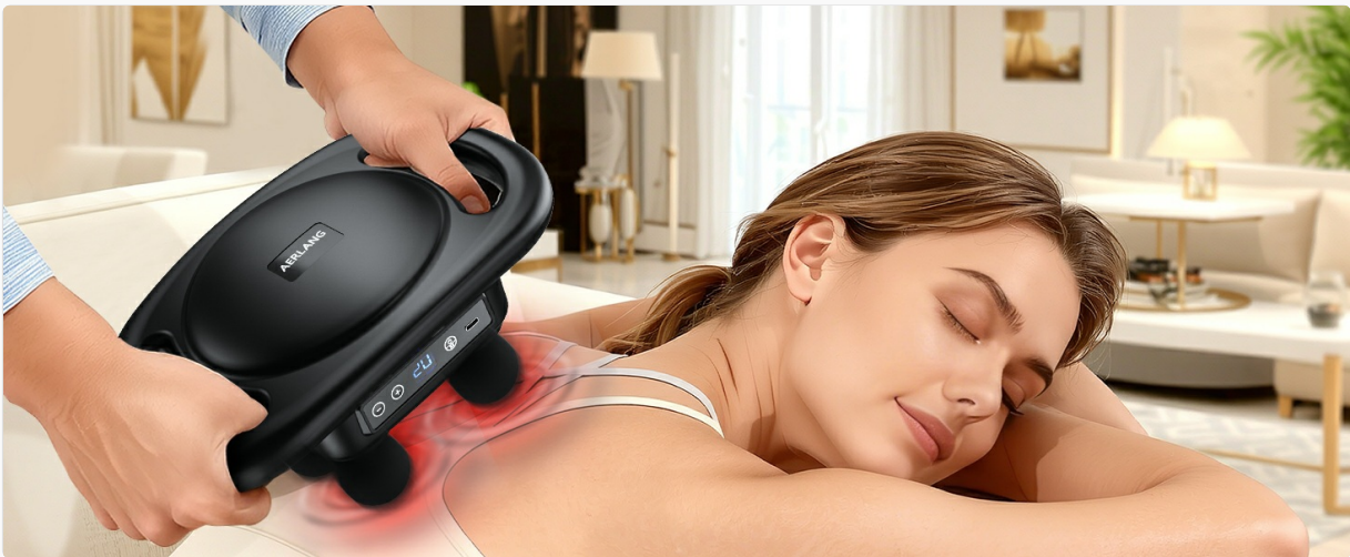
Figure 2: Illustration of the massage gun's deep impact mechanism.