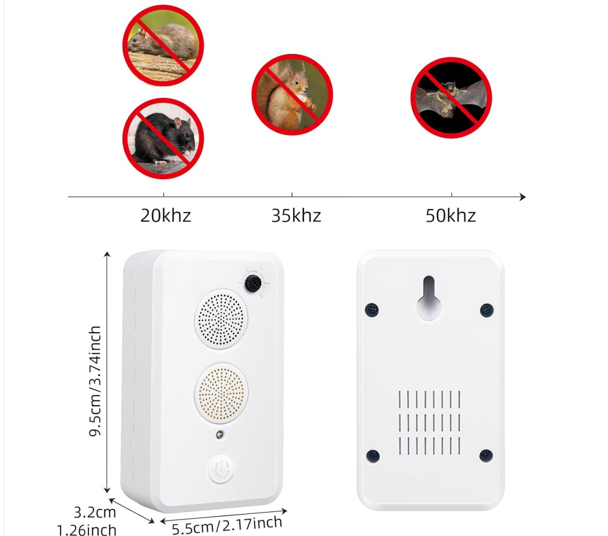
Image 5.1: Illustrates different effective frequencies for various pests and device dimensions.