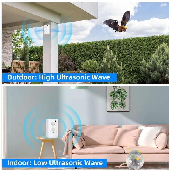
Image 4.1: Illustrates outdoor (high ultrasonic wave) and indoor (low ultrasonic wave) placement.