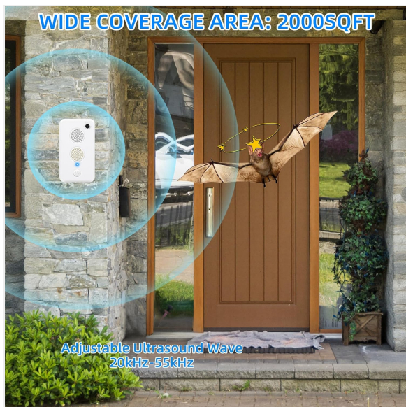
Image 4.2: Demonstrates wide coverage area and adjustable frequency for outdoor use.