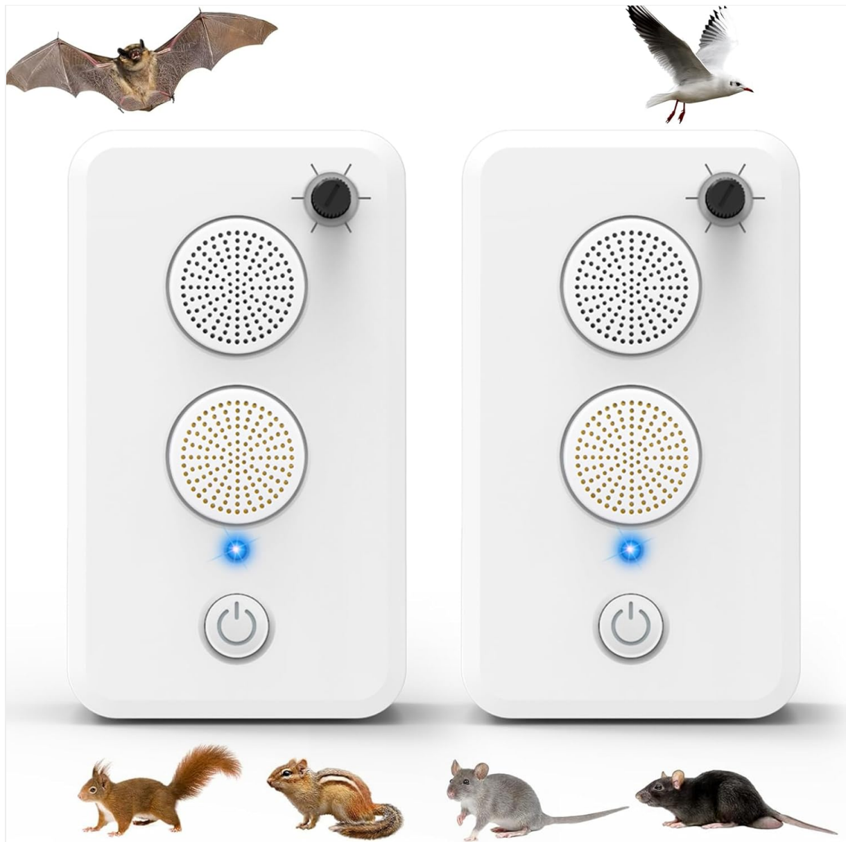
Image 1.1: JahyElec Ultrasonic Bat Repellent devices with various pests they deter.