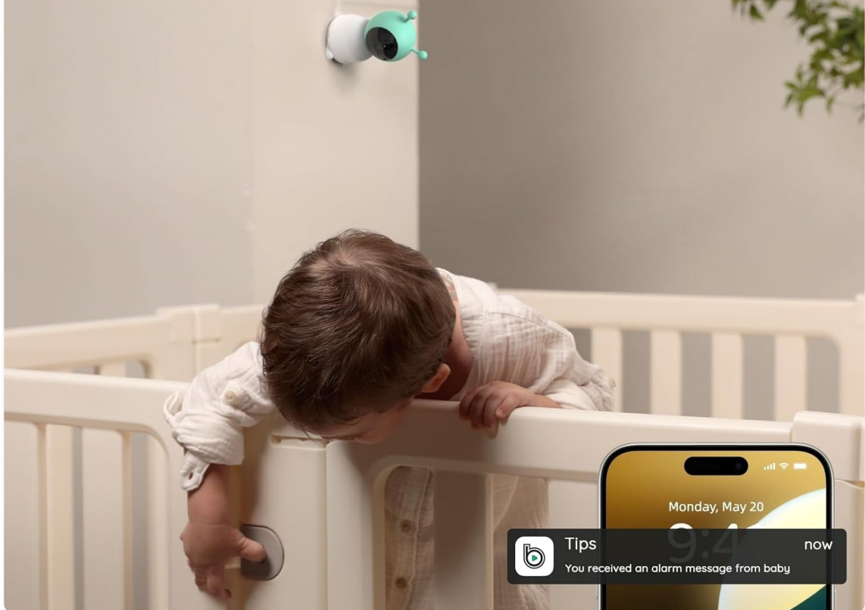
Image: A BOIFUN baby camera mounted on a crib, with a smartphone displaying a 'Tips' notification for movement detection, illustrating the 'Smart Care' features.