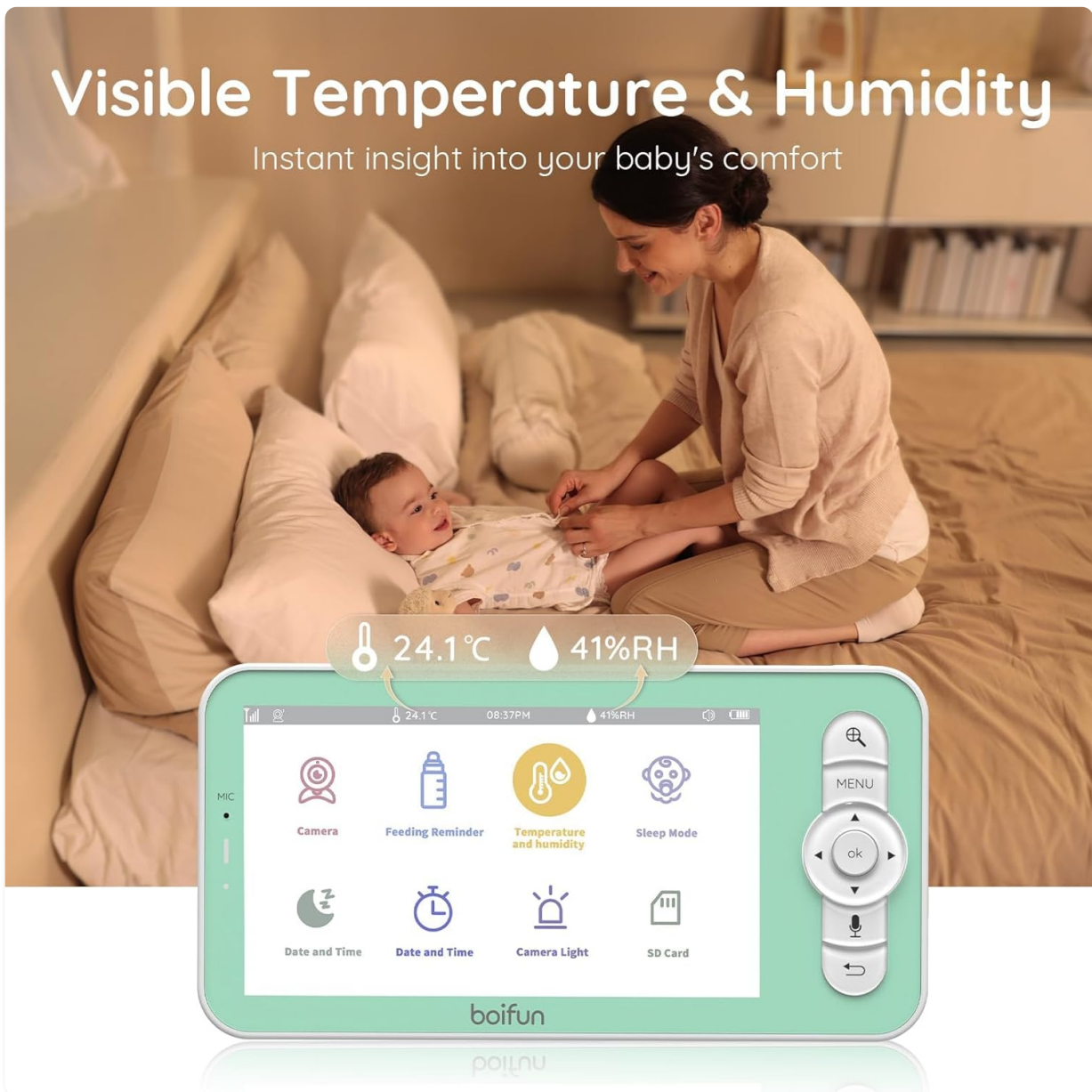
Image: The BOIFUN monitor display showing real-time temperature and humidity, along with various menu icons for camera, feeding reminder, smart care, sleep mode, date and time, camera light, safety protection, and SD card.

Instant insight into your baby's comfort