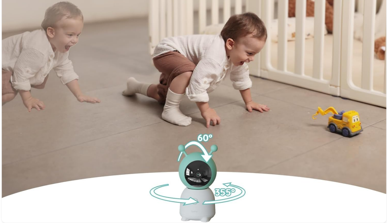
Image: A BOIFUN baby camera mounted on a crib, illustrating its 360-degree auto-tracking capability as a baby crawls on the floor.

360° auto-tracking every move of your baby