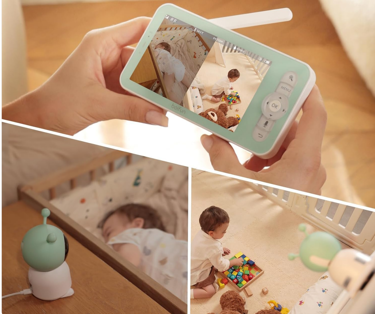
Image: The BOIFUN baby monitor display showing a split-screen view from two cameras, monitoring two different babies in separate rooms, labeled as 'Dual-Camera Care'.

Multi-camera monitoring, making childcare easier