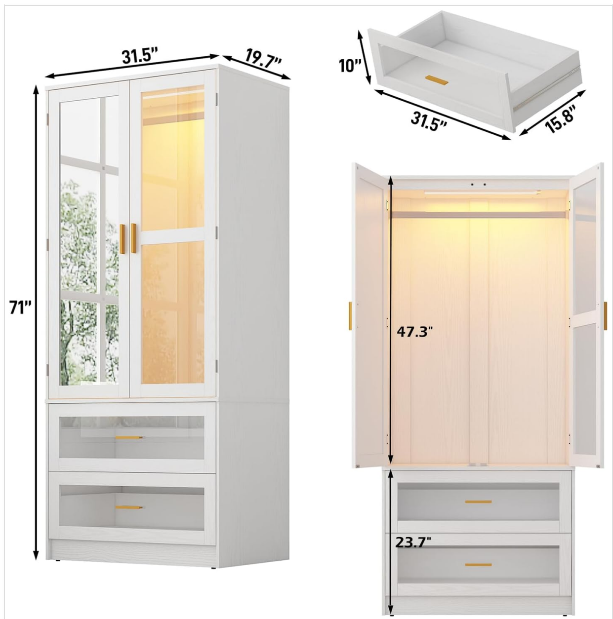
Figure 7.1: Product dimensions overview.