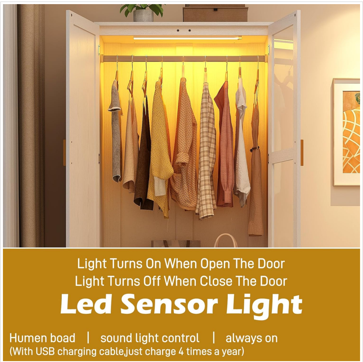
Figure 4.1: The LED sensor light illuminates the wardrobe interior when opened.