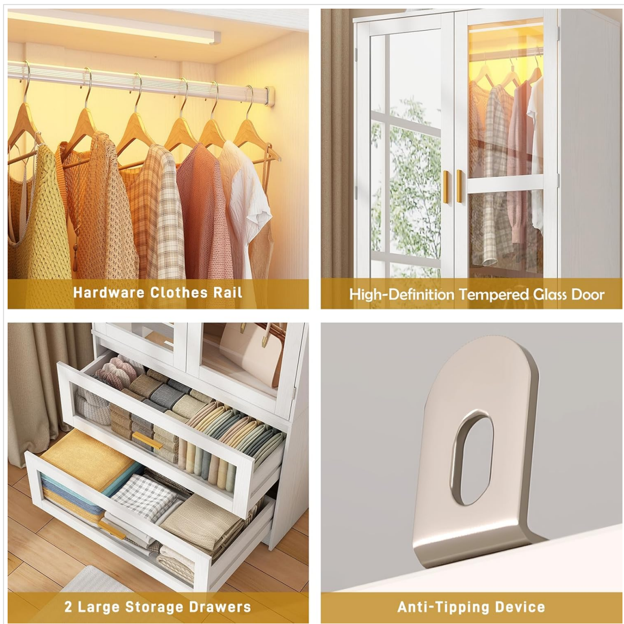
Figure 2.1: Various components including hardware, glass door, drawers, and anti-tipping device.