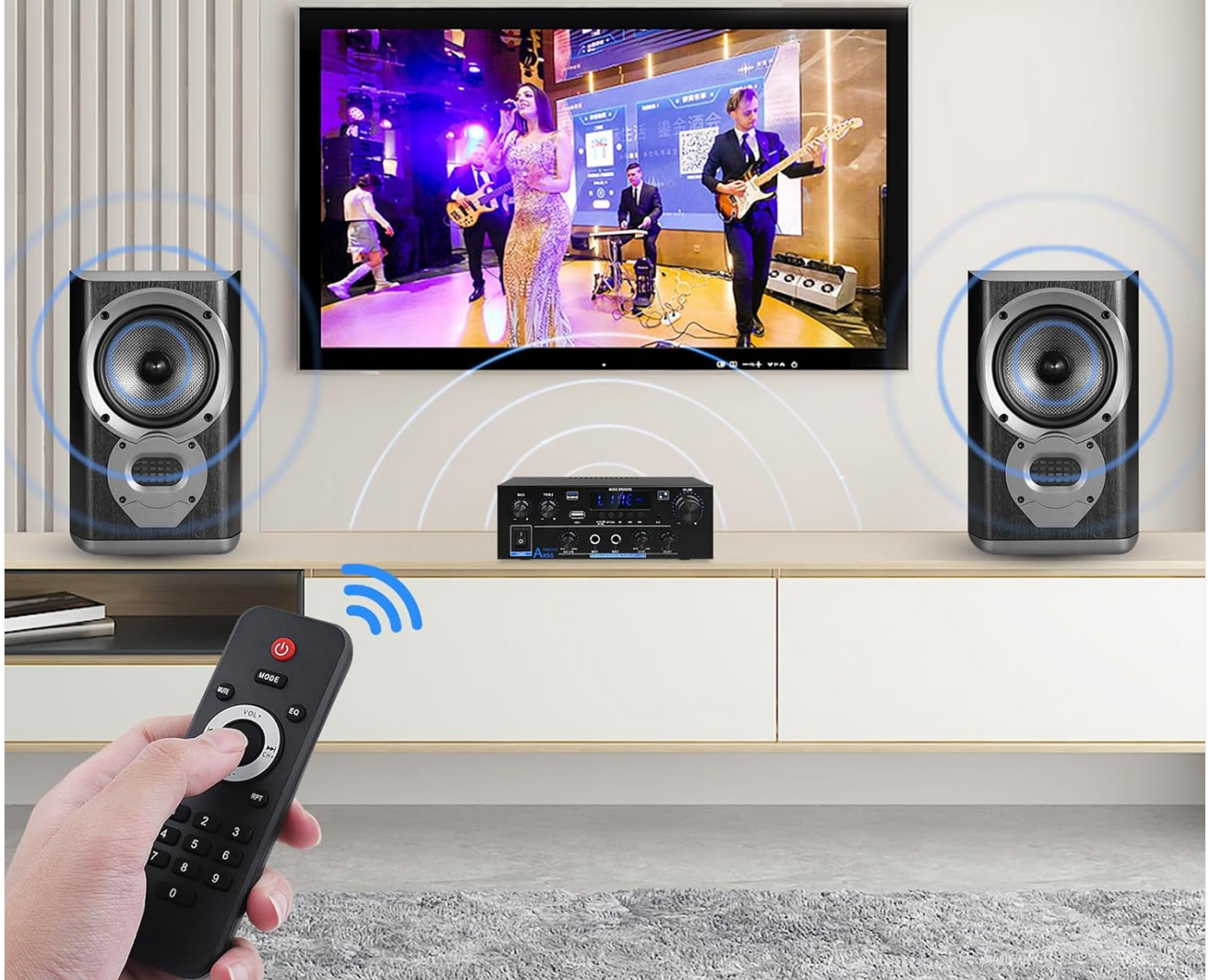
Figure 7: Home Theater Integration with Remote Control. The amplifier is shown as part of a home theater setup, with a hand holding the remote control, demonstrating ease of use.