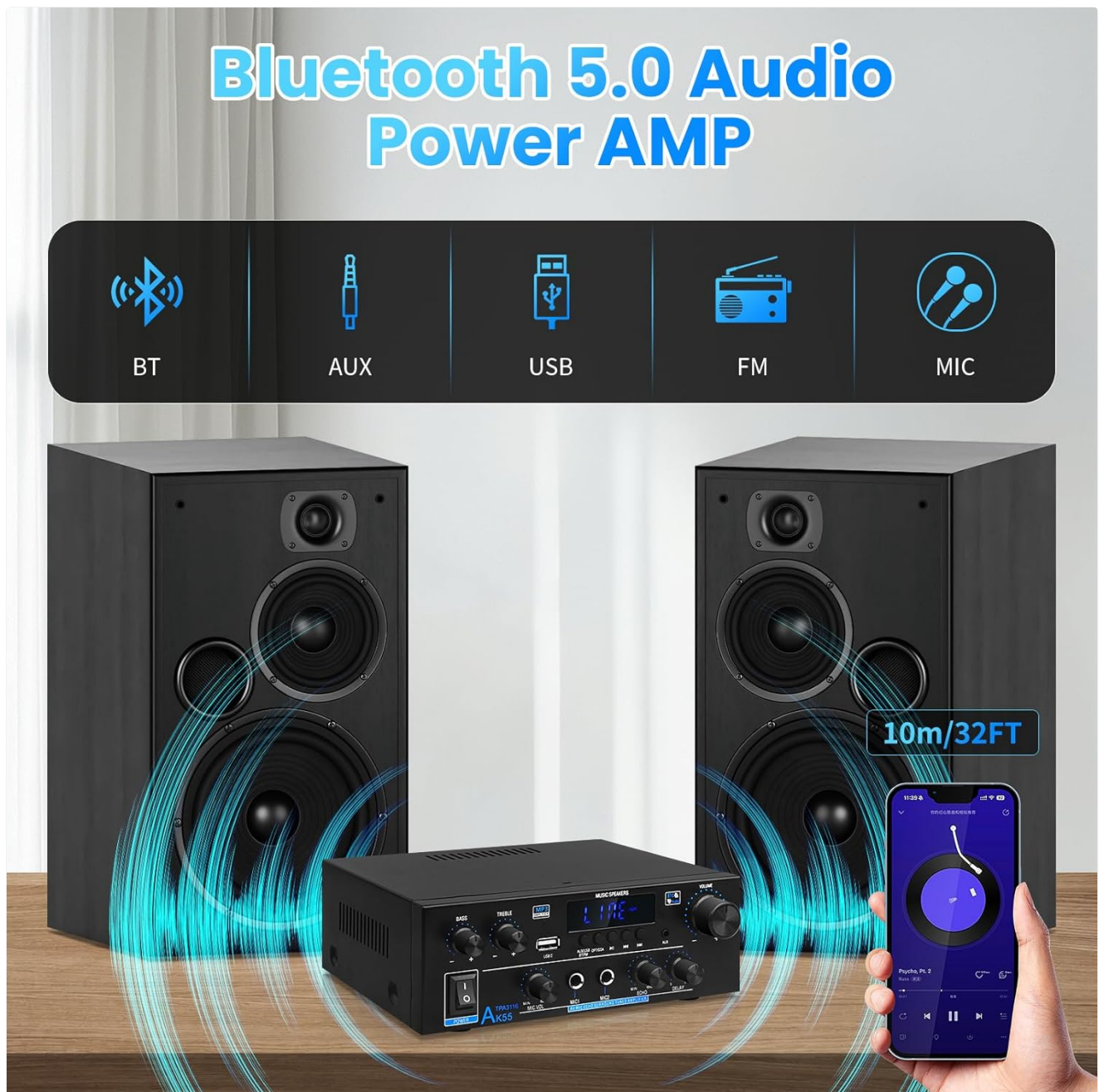
Figure 4: Bluetooth 5.0 Audio Streaming. The amplifier is shown connected to speakers, with a smartphone displaying a music app, indicating active Bluetooth audio playback.

Note: When using AUX/USB/RCA/Optical/Coaxial input, ensure the Bluetooth connection is disconnected from any paired device.