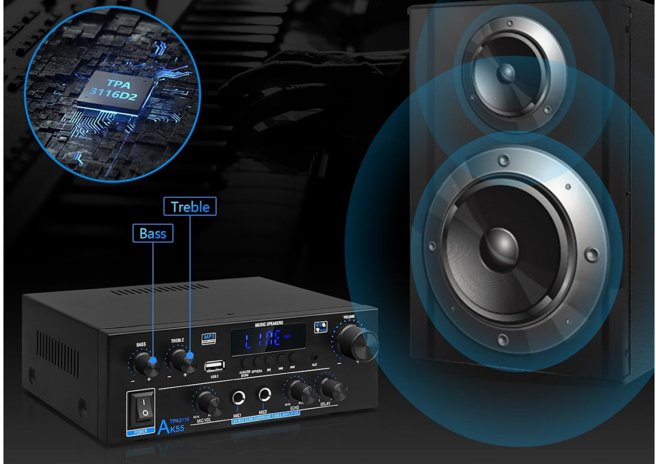
Figure 6: Treble and Bass Adjustment. This image highlights the amplifier's internal TPA3116D2 chip and the external knobs for adjusting bass and treble to refine sound quality.

AK-55 driver by dual TPA3116D2 chips, a high-performance class D power amplifier chip