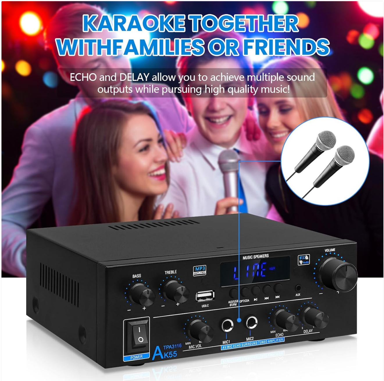
Figure 5: Karaoke Setup. The amplifier's front panel is shown with two microphones plugged in, demonstrating the use of microphone volume, echo, and delay controls for karaoke.

Connect up to two microphones to the 'MIC1' and 'MIC2' jacks on the front panel. Adjust the 'MIC.VOL' knob to control microphone volume. Use the 'ECHO' and 'DELAY' knobs to add effects to your vocals.