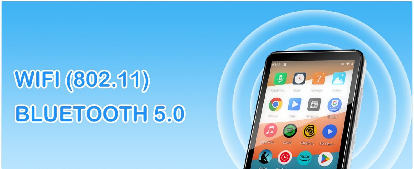
Image: Google Play Store on the DGTenk MP3 Player.