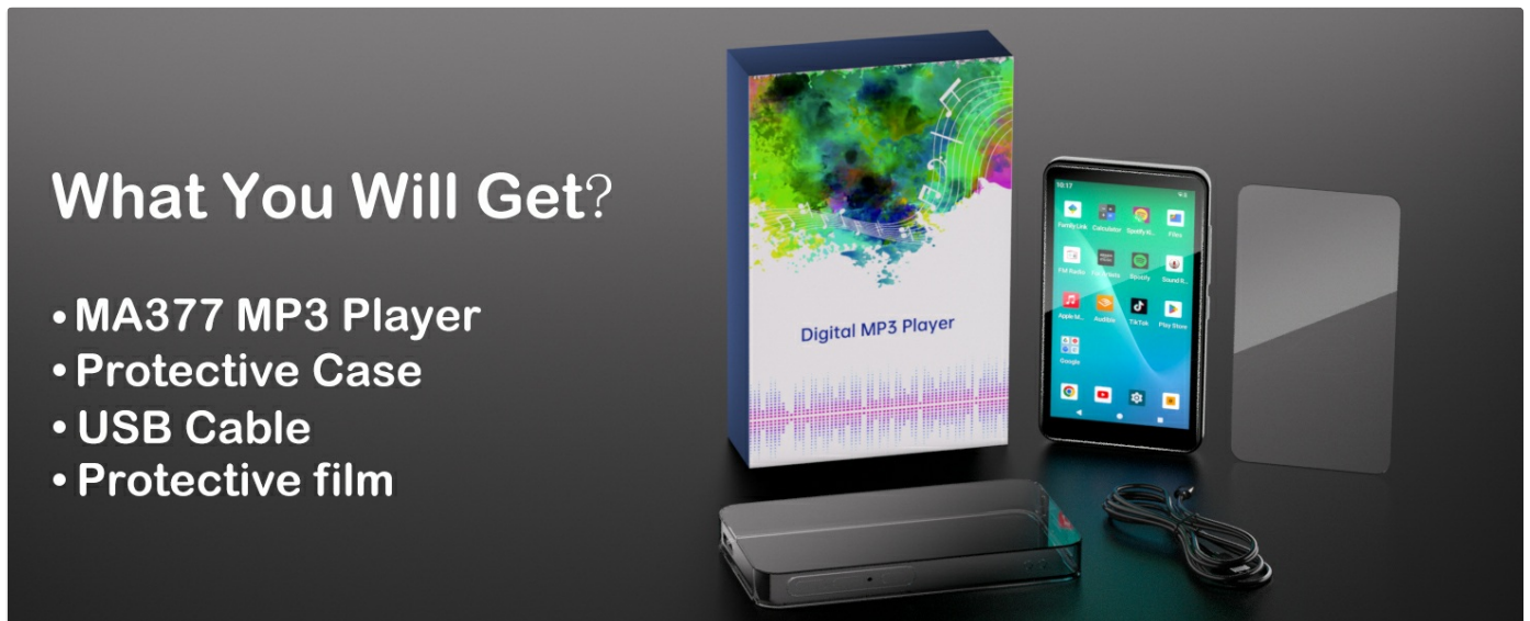
Image: Key specifications and features of the DGTenk MP3 Player.