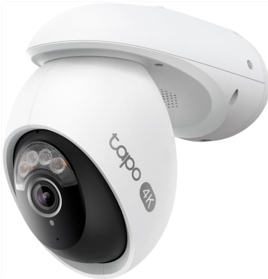
Image: Front view of the Tapo C560WS Pan/Tilt Outdoor Wi-Fi Camera.