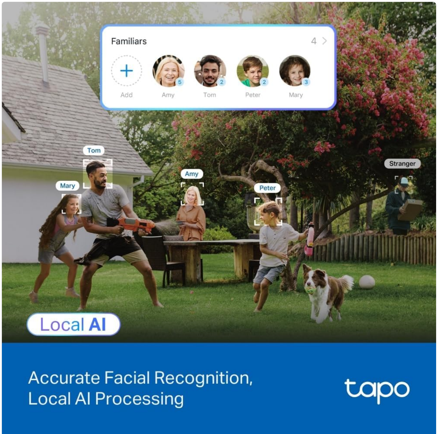
Image: Scene depicting facial recognition in action, with labels identifying familiar individuals and a "Stranger" in an outdoor family setting, demonstrating local AI processing.