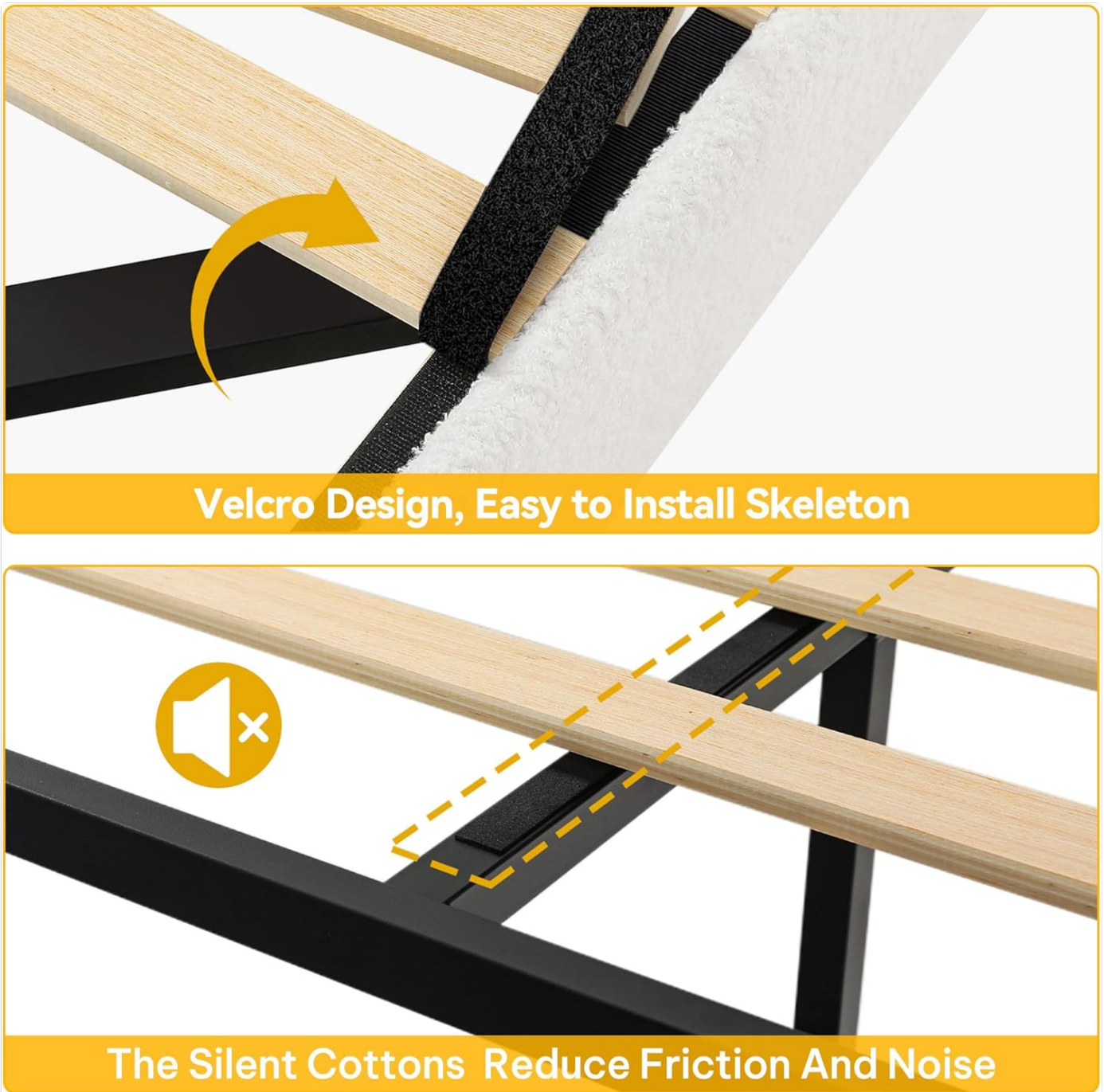
Figure 3: Detail of Slat Installation and Noise Reduction Features