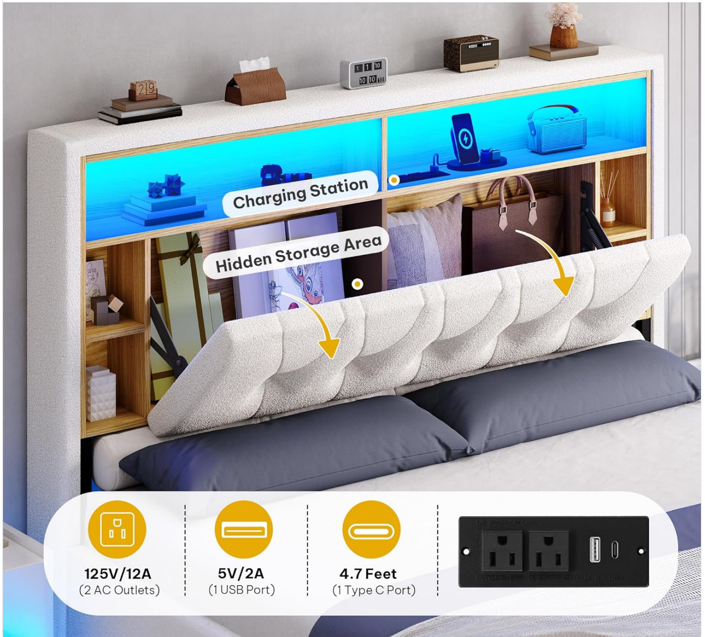
Figure 4: Multifunction Storage Space and Charging Station in Headboard