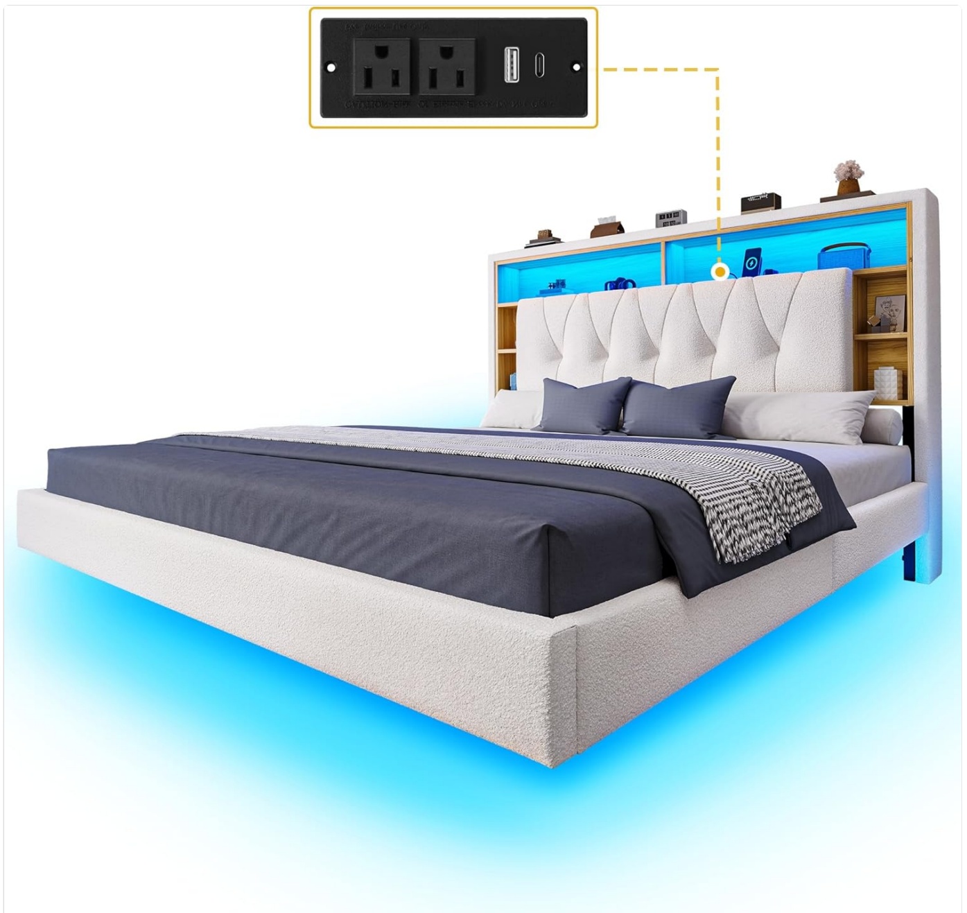
Figure 5: Detail of Charging Station Ports