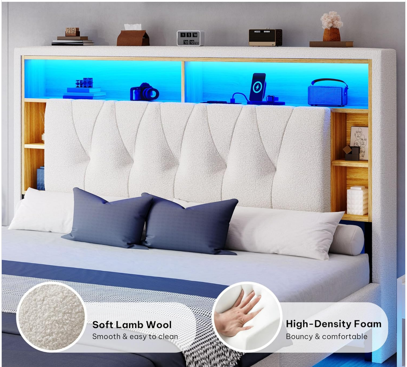
Figure 7: Lambswool Upholstery for Easy Cleaning