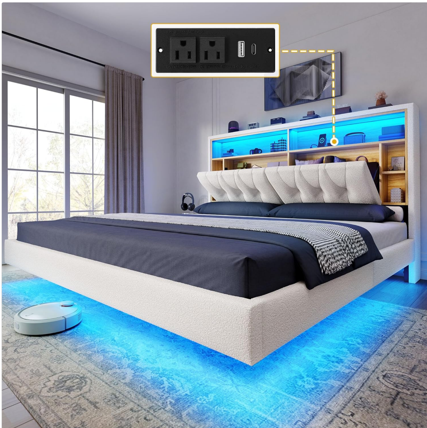
Figure 1: YITAHOME Queen Size Floating Bed Frame