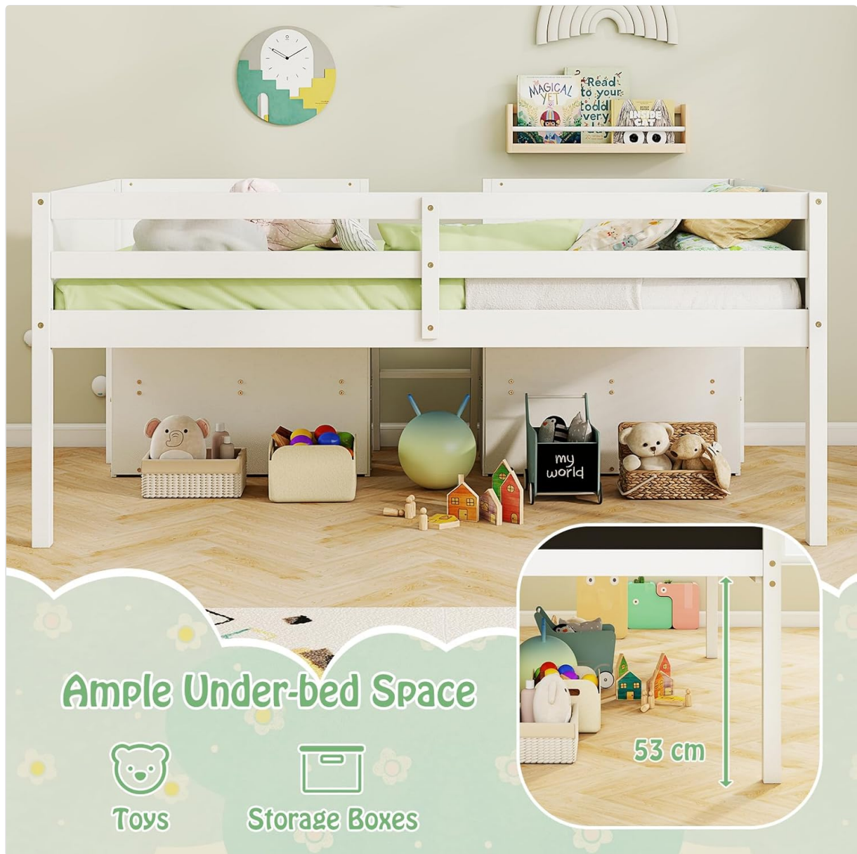
Figure 5: The spacious under-bed area, suitable for play, storage, or a small desk.