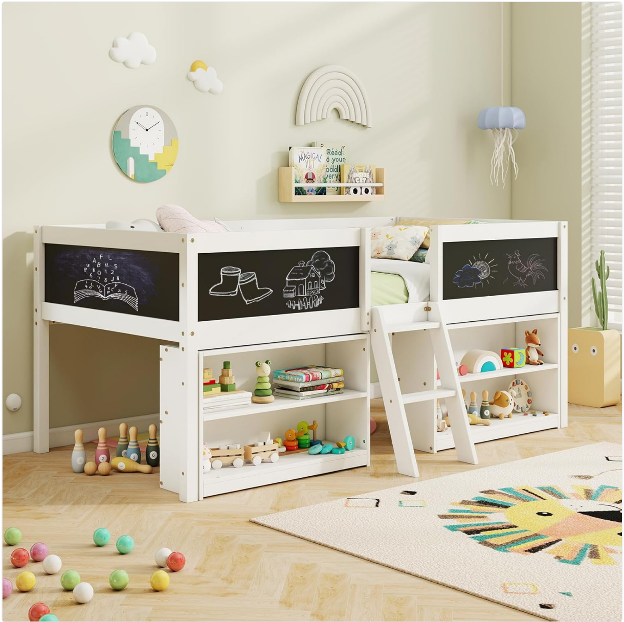
Figure 2: Fully assembled IFANNY Low Loft Bed, showcasing its design with chalkboards and integrated shelving.