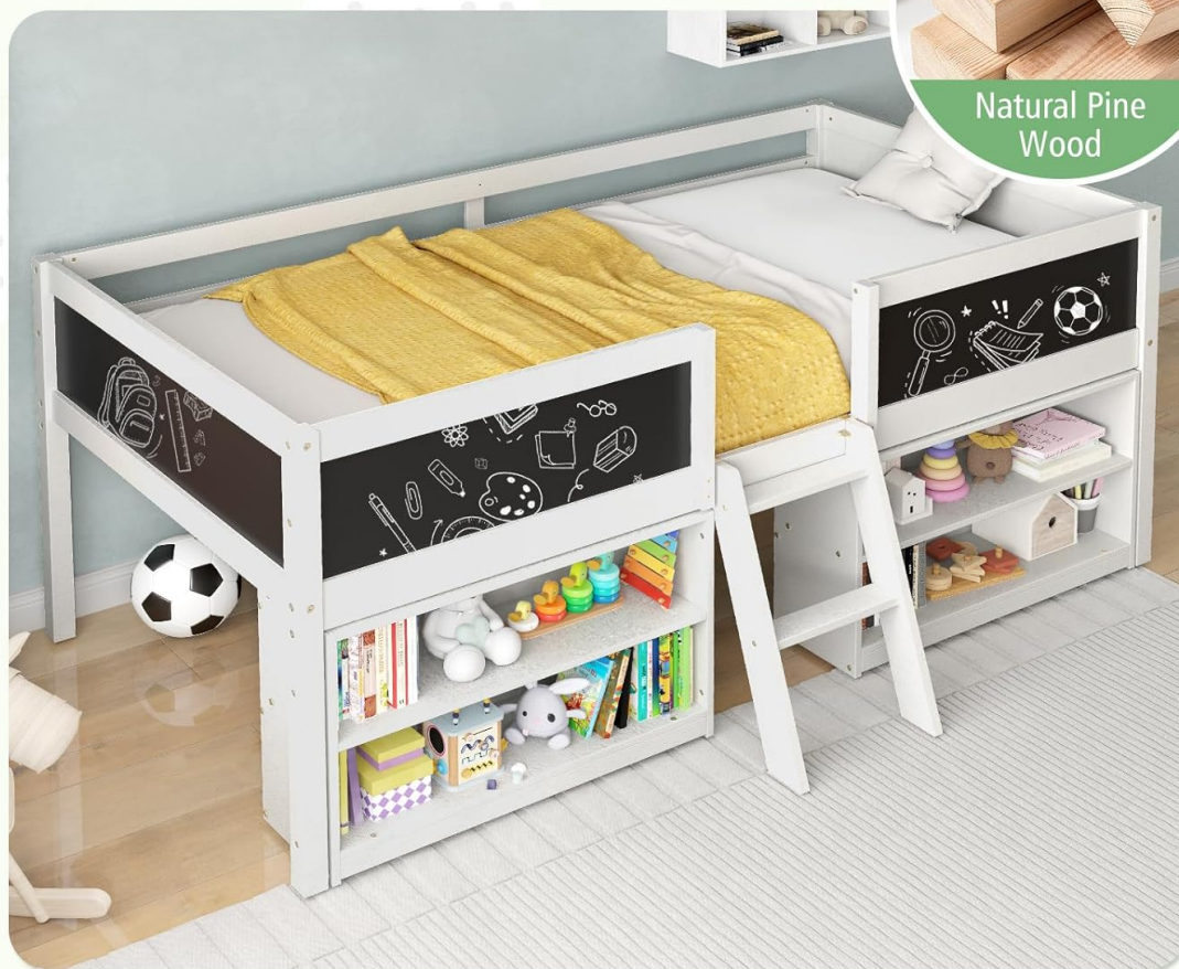
Figure 6: Detail of the solid pine wood frame, emphasizing durability and natural material.