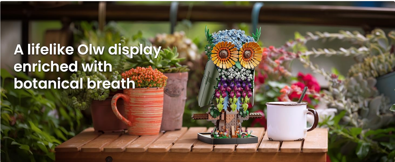
Image: The floral owl model positioned on a shelf, enhancing the room's decor with its botanical design.