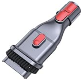
Image: The 2-in-1 dusting brush attachment, featuring bristles for delicate cleaning.