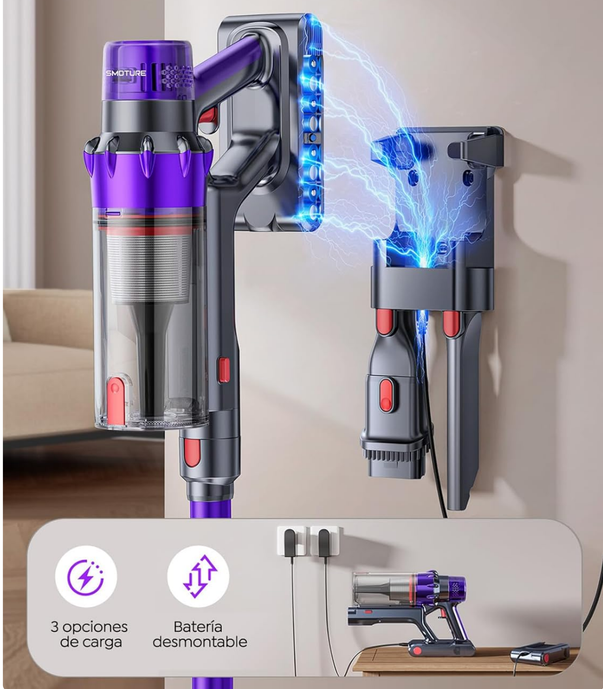
Image: The SMOTURE VAC02 Cordless Vacuum Cleaner docked in its wall-mounted charging station, illustrating the 2-in-1 charging and storage solution.