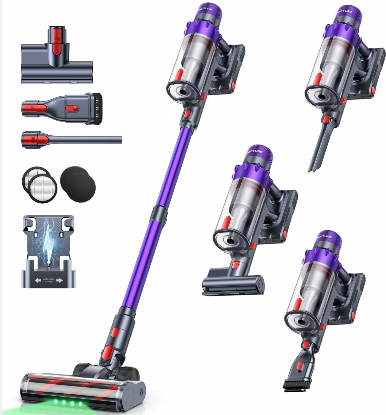
Image: SMOTURE VAC02 Cordless Vacuum Cleaner, fully assembled and ready for use.