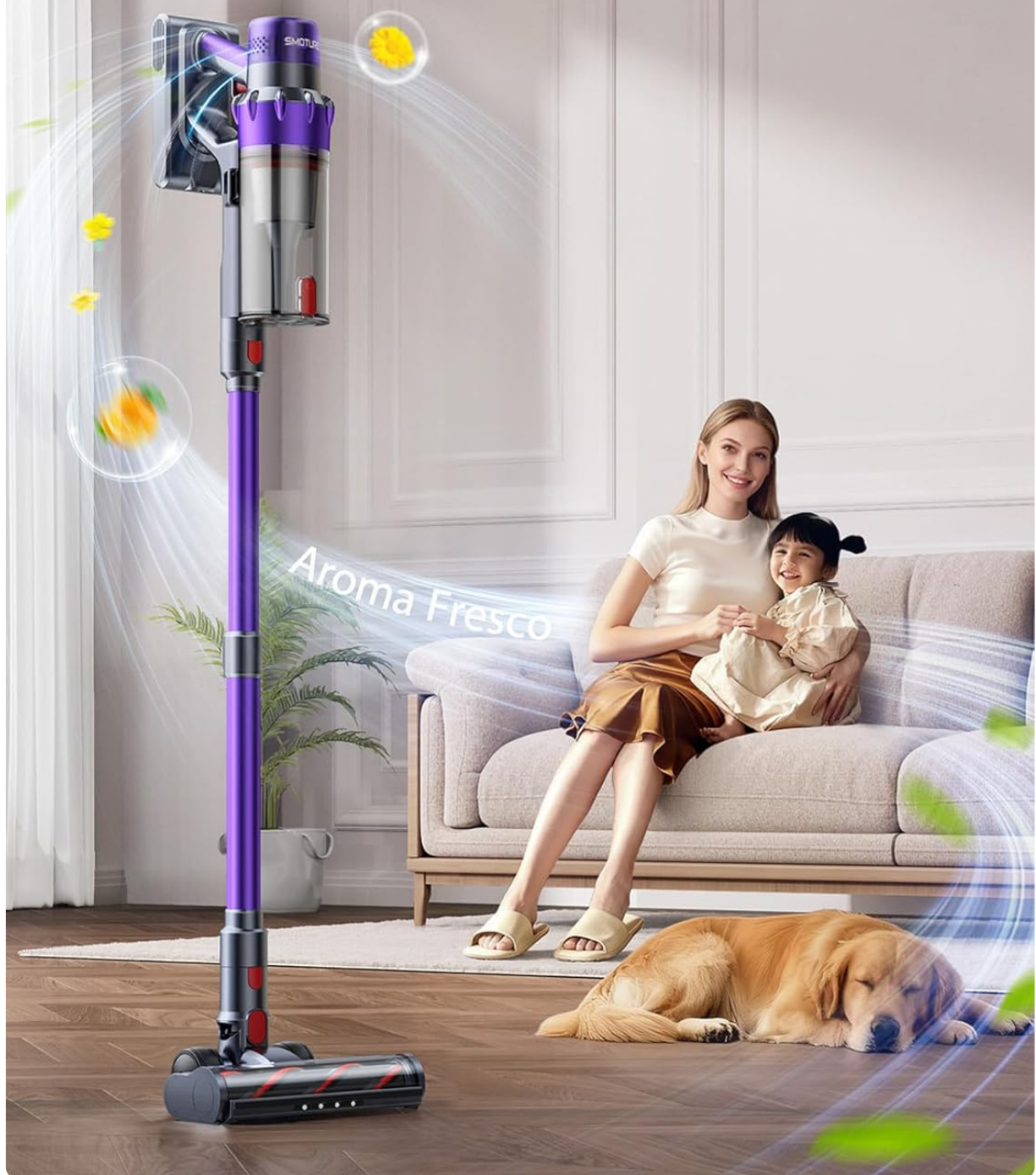
Image: The SMOTURE VAC02 Cordless Vacuum Cleaner standing upright on its own in a living room setting, showcasing its self-standing capability.