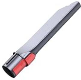
Image: The crevice tool attachment, designed for reaching narrow and tight spaces.