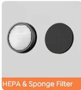
Image: The removable HEPA filter, an essential component for trapping fine dust and allergens.