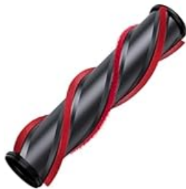
Image: The roller brush from the electric floor head, designed with anti-tangle features.

The electric floor brush features an anti-tangle roller. If hair or debris becomes tangled, use the provided mini cleaning tool to safely cut and remove it.