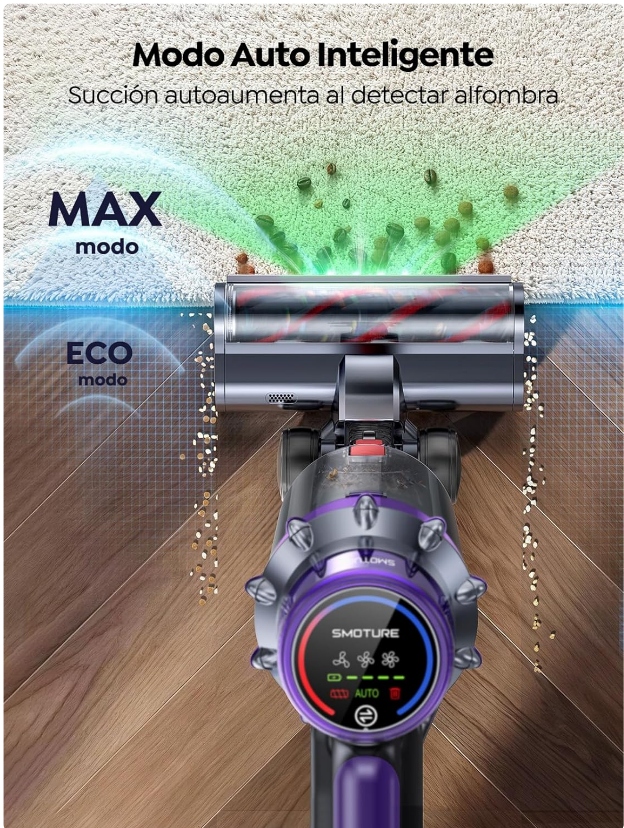
Image: Close-up of the vacuum's LED screen displaying battery level and selectable suction modes (Eco, Mid, Max, Auto).