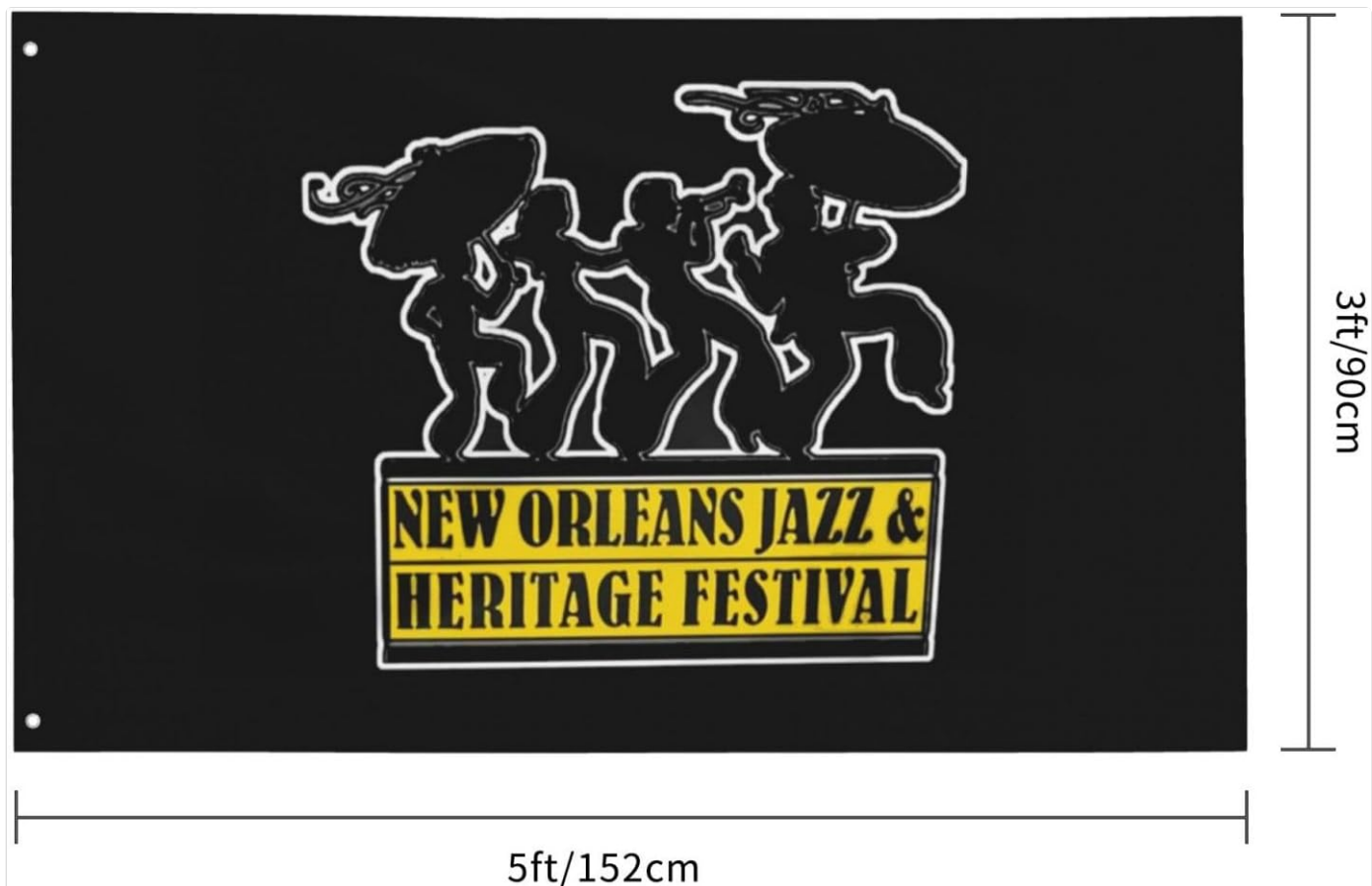
Image: The New Orleans Jazz & Heritage Festival Flag displaying its approximate dimensions of 3 feet by 5 feet (90cm x 152cm).