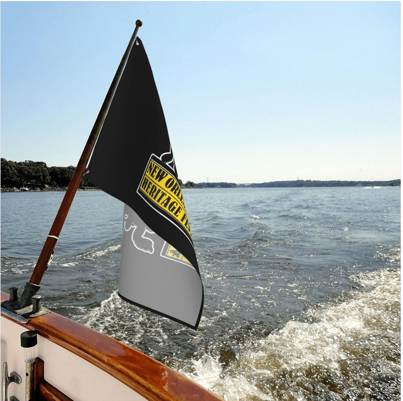
Image: The flag flying from a flagpole on the stern of a boat, illustrating its versatility for various display environments.