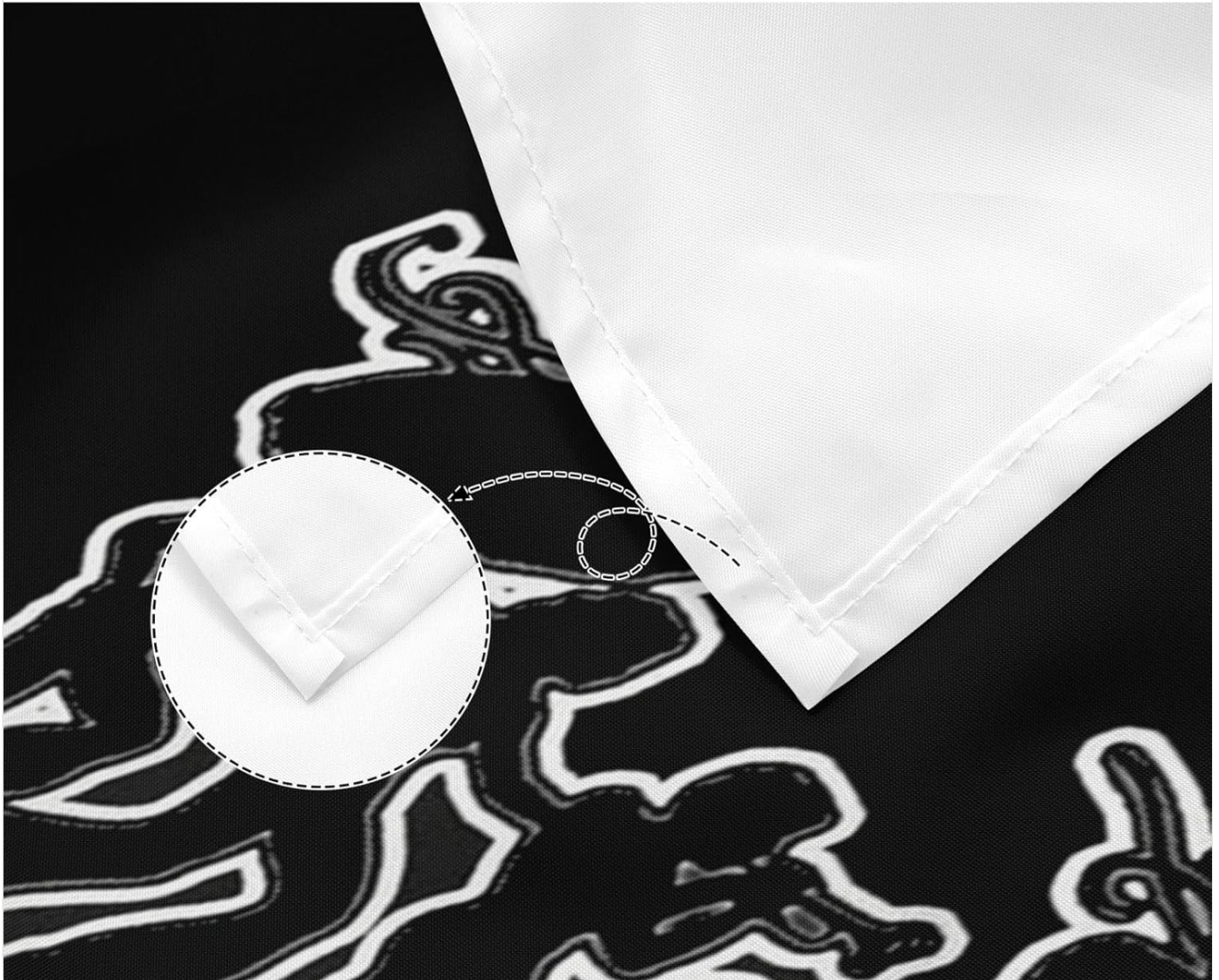
Image: A detailed view of the flag's polyester fabric, highlighting its texture and quality.

Made From Heavy Duty Fade & Wind Resistant Polyester Perfect for Outdoor Use in Any Weather.