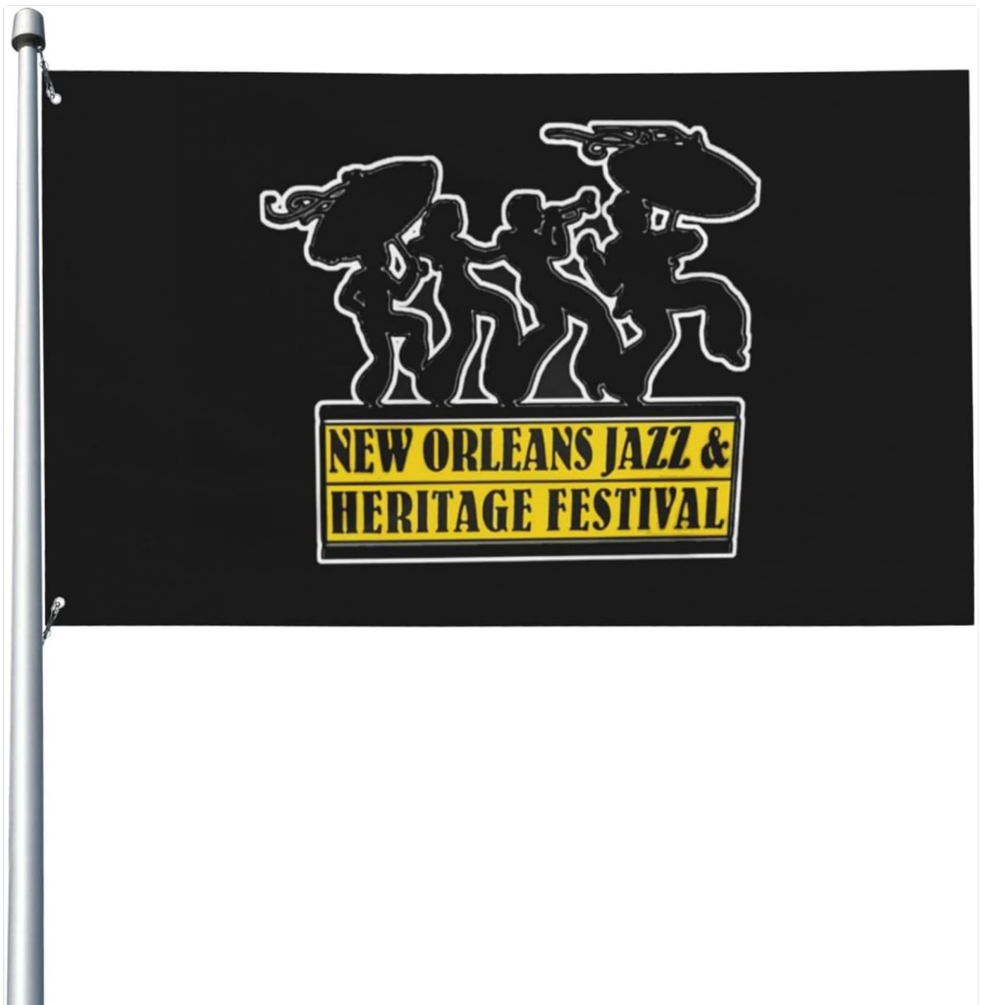
Image: The New Orleans Jazz & Heritage Festival Flag properly installed on a flagpole, ready for display.