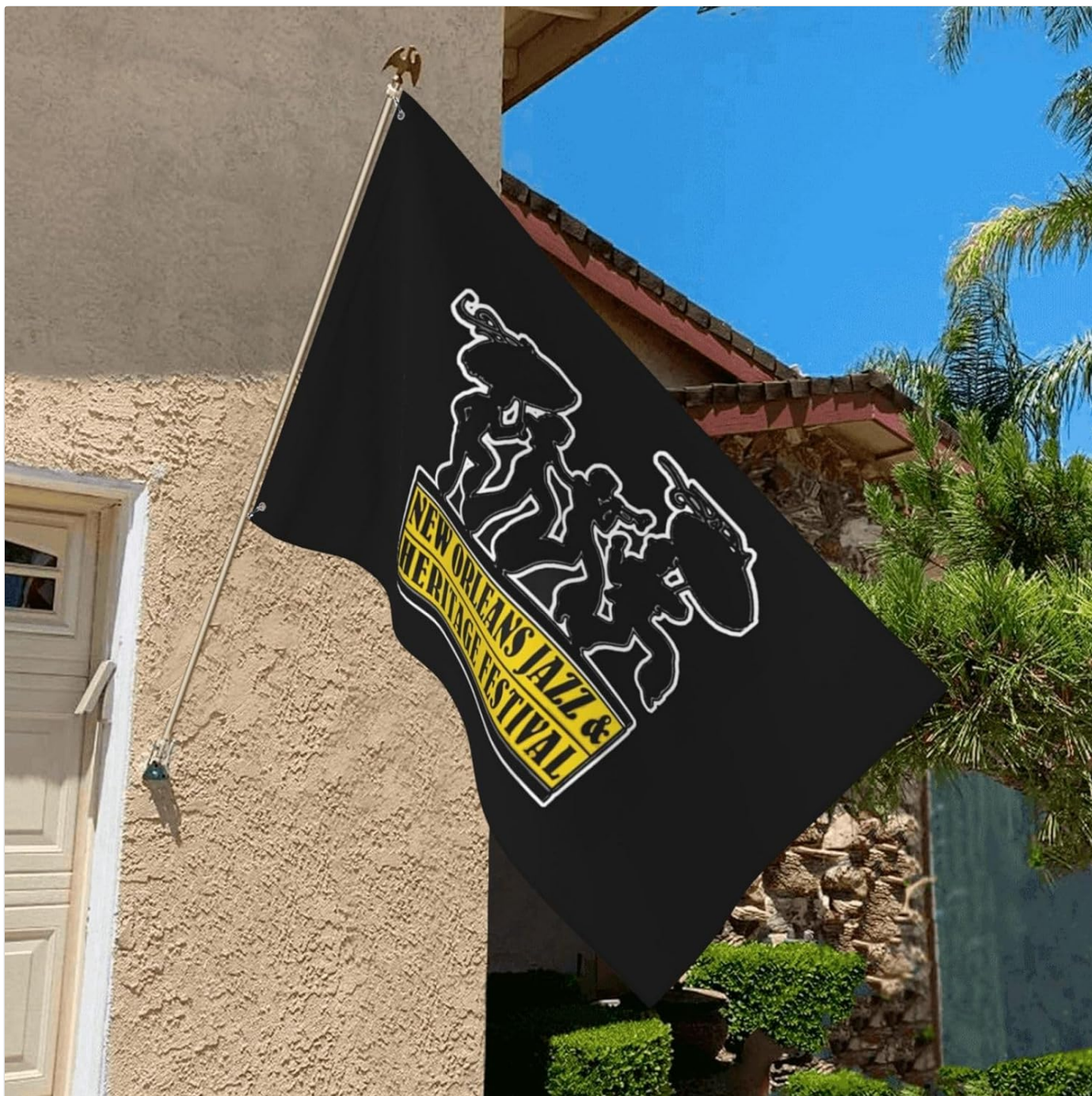
Image: The flag displayed on the exterior of a house, demonstrating a common outdoor installation.