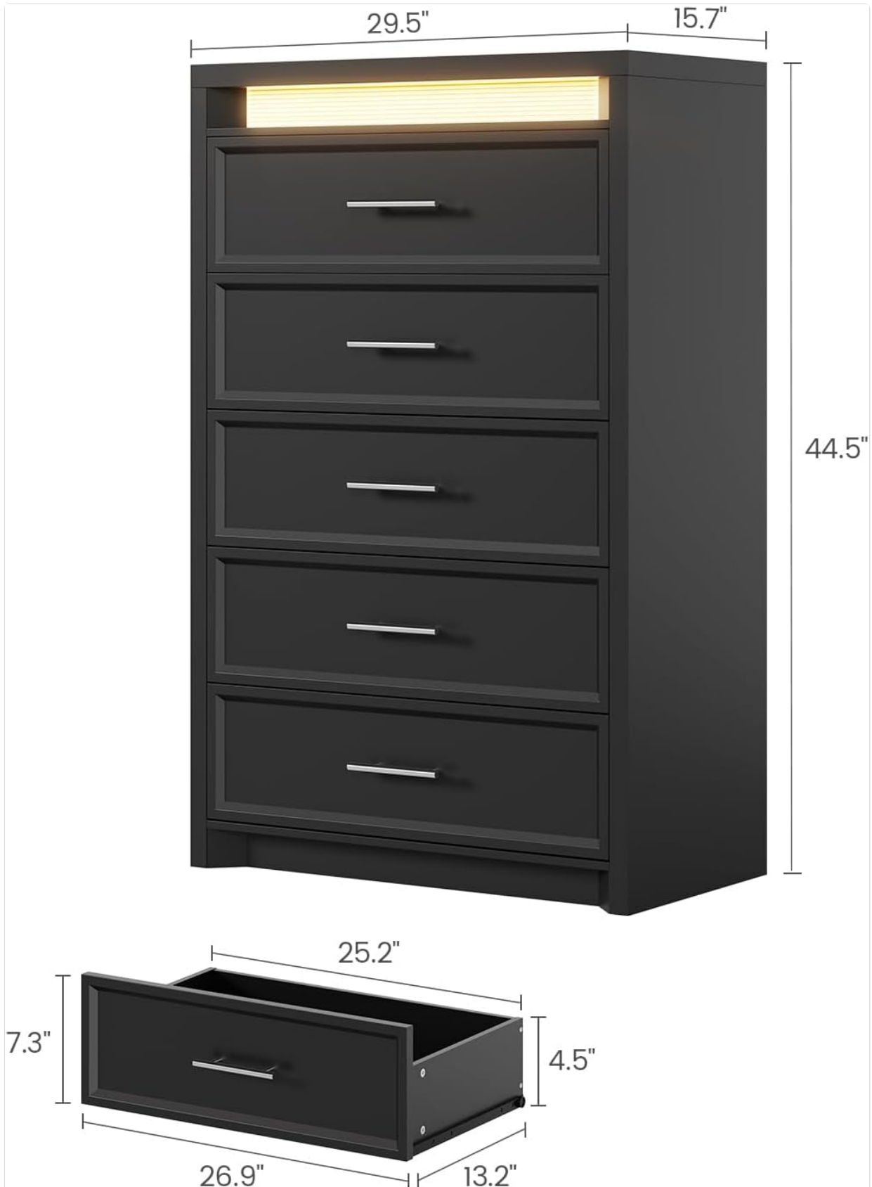
Image: Diagram showing the overall dimensions of the dresser and individual drawer components, indicating various parts.