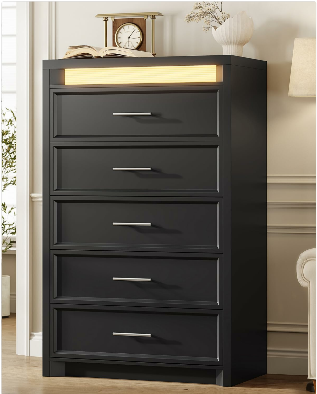
Image: Front view of the AOGLLATI Black 5-Drawer Dresser with the LED lightbox illuminated.