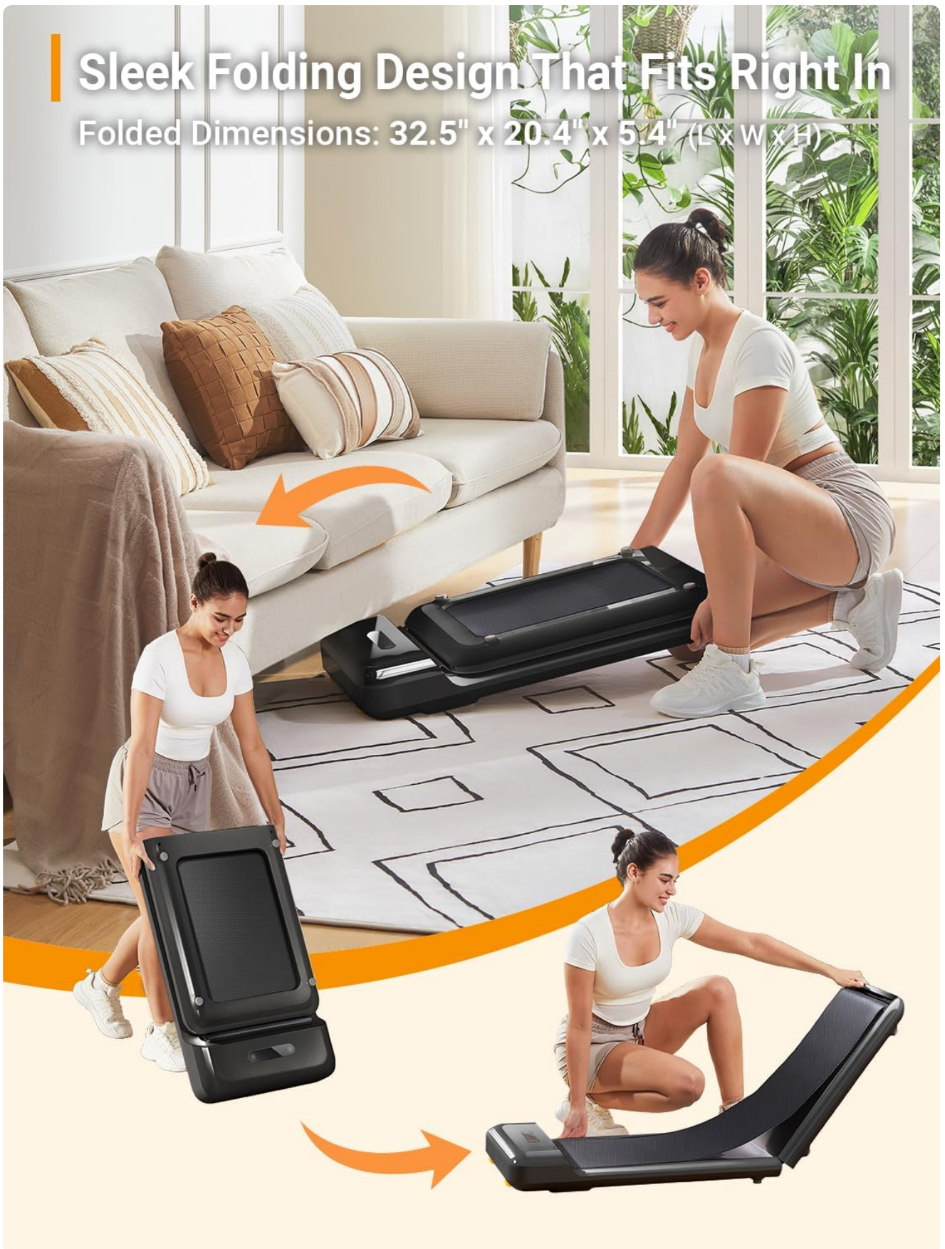
Figure 4.1: The WalkingPad C2 features a dual-folding design for compact storage, easily fitting under furniture when not in use.

Folded Dimensions: 32.5" x 20.4" x 5.4" (L x W x H)