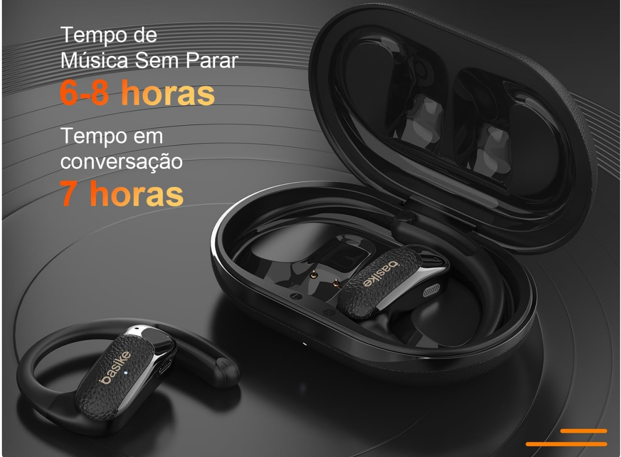
Image 6.1: Information on USB-C fast charging for the Basike FON249 OWS Earphones, detailing battery capacities and usage times.