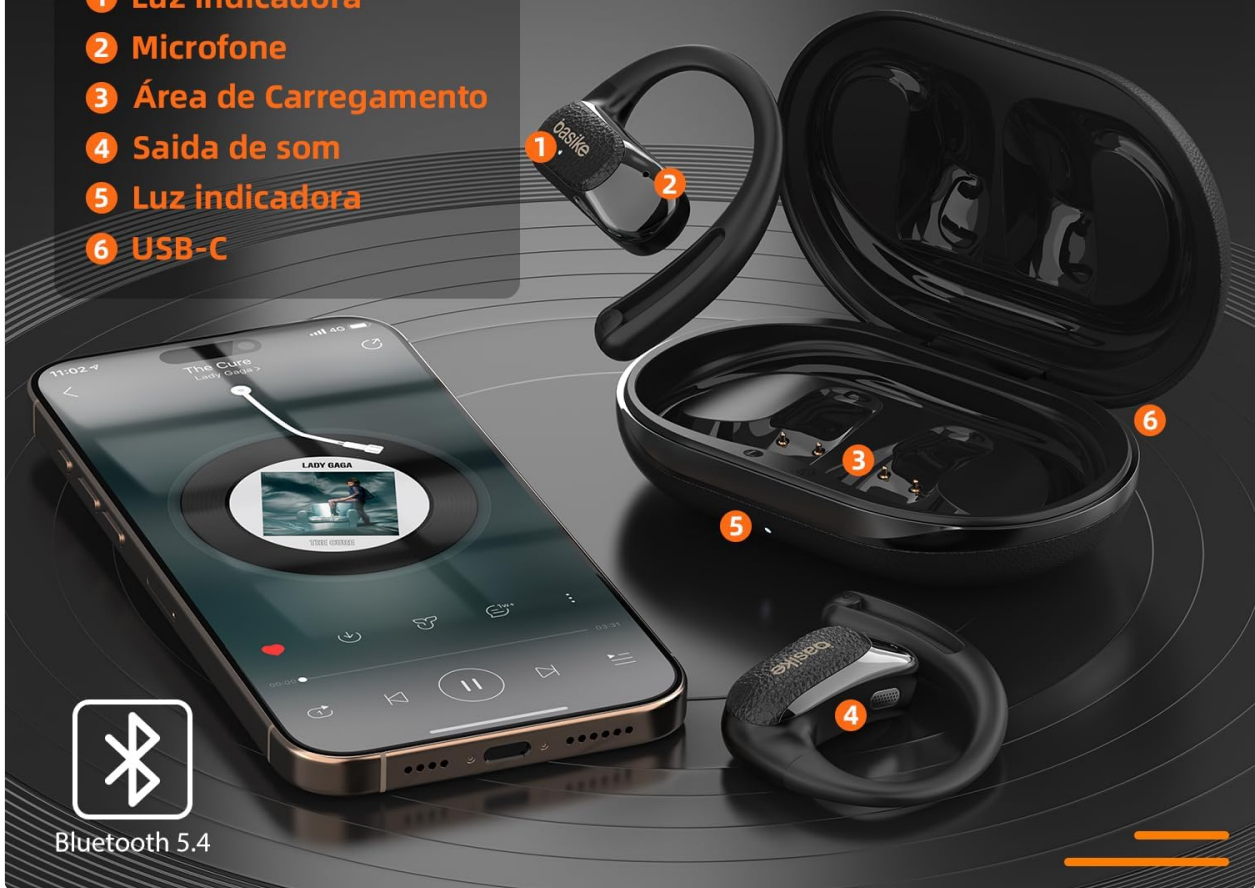
Image 3.1: Diagram highlighting key components of the Basike FON249 OWS Earphones and charging case, including indicator lights, microphone, charging area, sound outlet, and USB-C port.