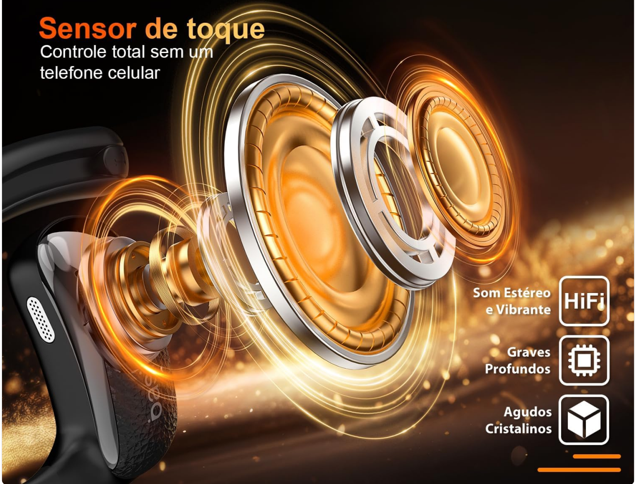
Image 9.2: Detailed view of the Basike FON249 OWS Earphones' powerful 12mm driver and integrated touch sensor for control.