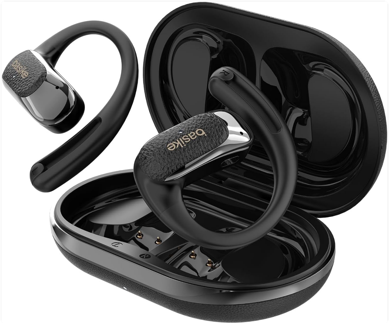
Image 1.1: Basike FON249 OWS Bluetooth Earphones and Charging Case. The image displays the black earphones with ear hooks and their matching charging case, open to show the charging contacts.