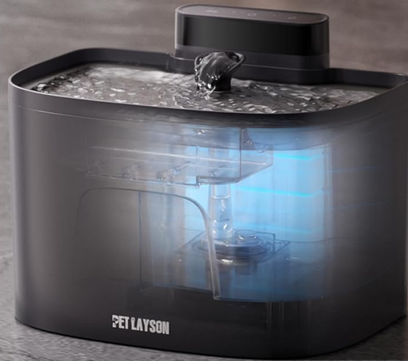
Image: A close-up view of the Maglev Valve Technology, showing the UVC light component that helps keep the water clear.