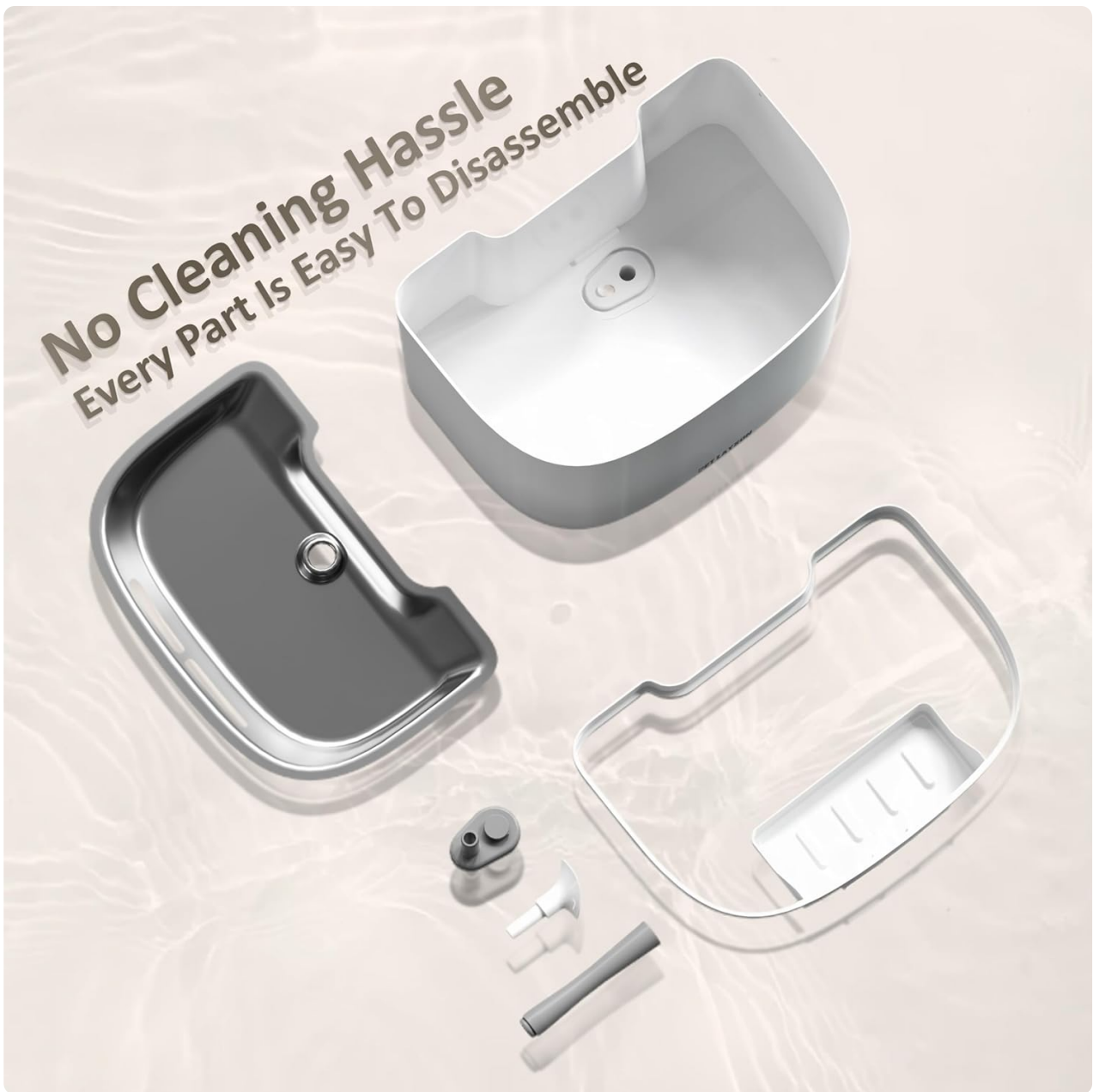
Image: Disassembled components of the PET LAYSON water fountain, including the main body, stainless steel tray, and internal parts, highlighting its easy-to-clean design.