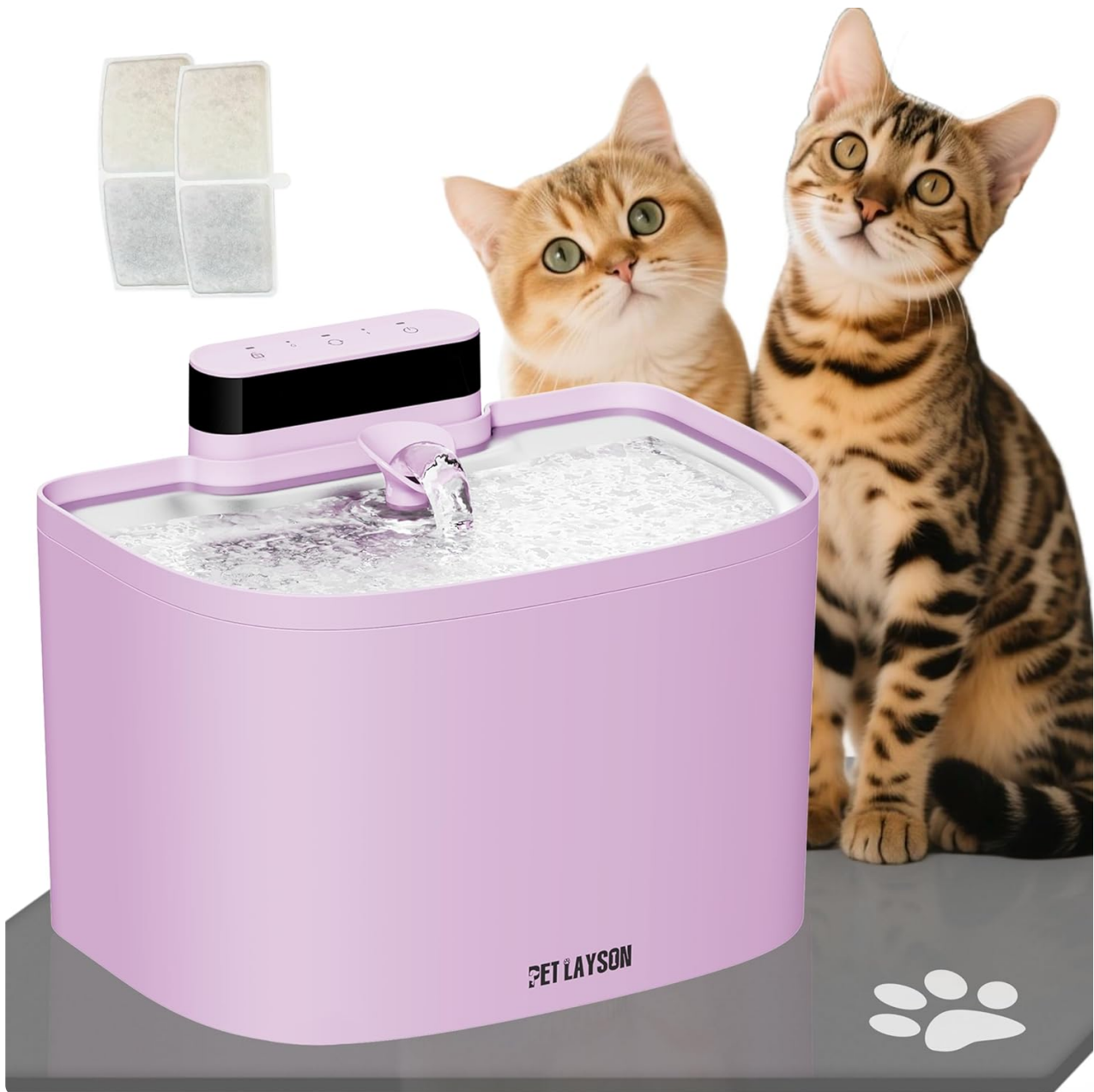
Image: The PET LAYSON Pumpless Cat Water Fountain in pink, with two cats observing it. The fountain features a sleek design and a visible water flow.