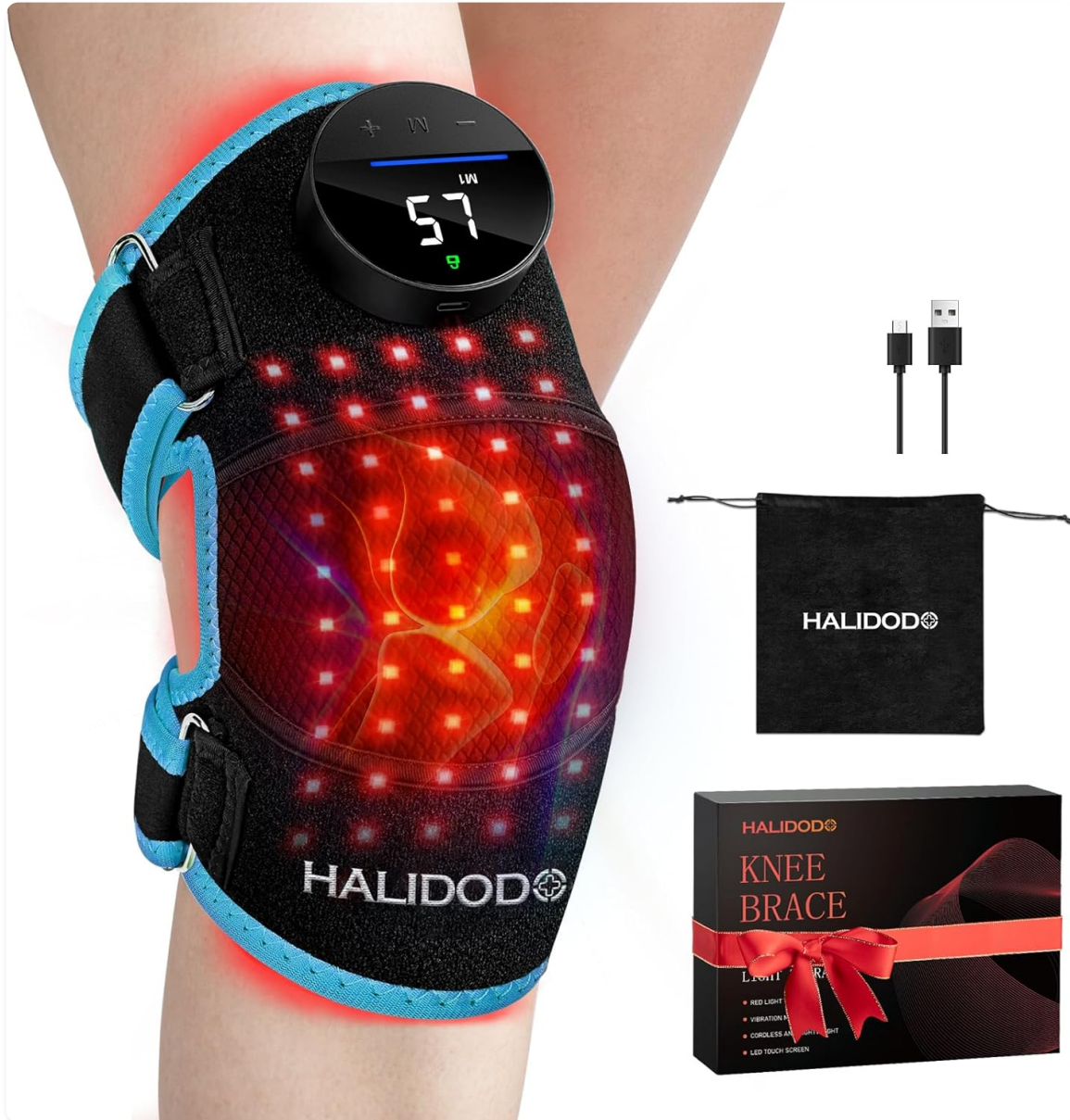
Image: The HALIDODO Knee Brace in use on a knee.