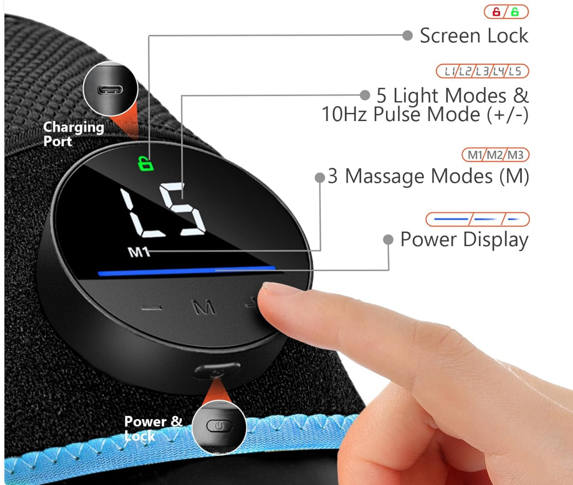
Image: Intelligent Touchscreen Control overview.