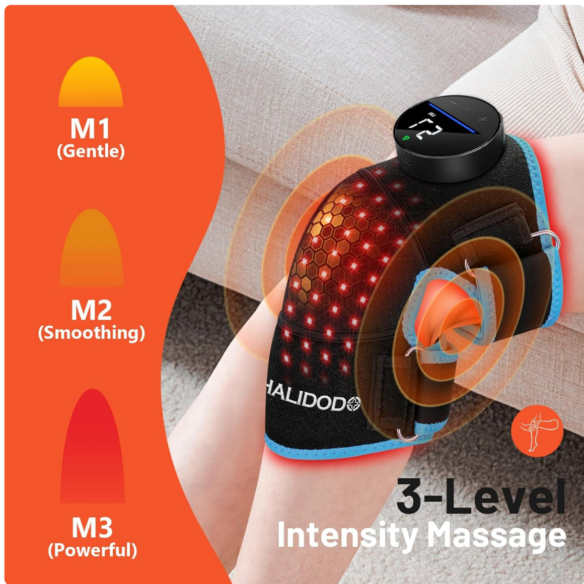
Image: 3-Level Intensity Massage.