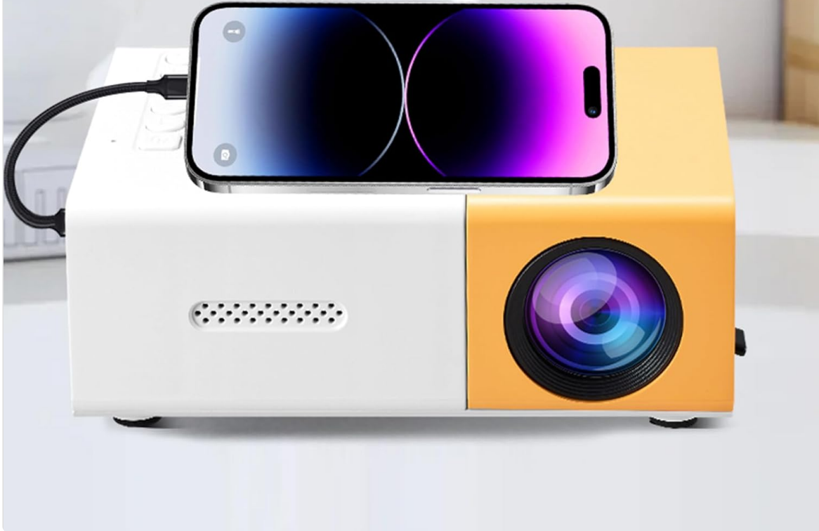
Image 8.1: Projection size capabilities of the PUSOKEI Mini Projector.

MOBILE WIRELESS SCREEN SHARING SUPPORTS 1080P