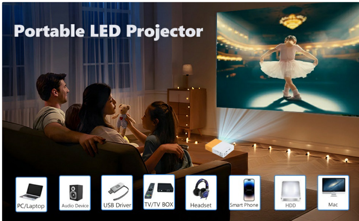
Image 1.1: The PUSOKEI Mini Projector in use, demonstrating its compact size and versatility for home entertainment.

Thank you for purchasing the PUSOKEI Mini Projector. This manual provides essential information for setting up, operating, and maintaining your projector. Please read it thoroughly before use to ensure proper functionality and to extend the lifespan of your device.