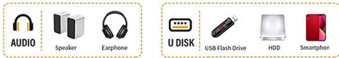
Image 4.2: Rich interfaces and complete functions of the projector.