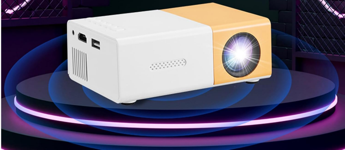
Image 4.1: Detailed view of the projector's controls and interfaces.