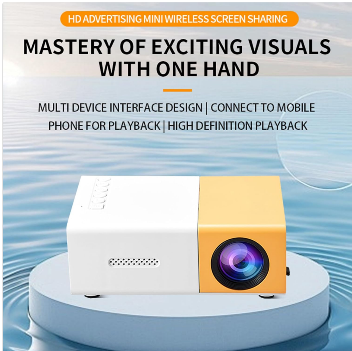
Image 7.2: Multiple ports and device compatibility for the projector.