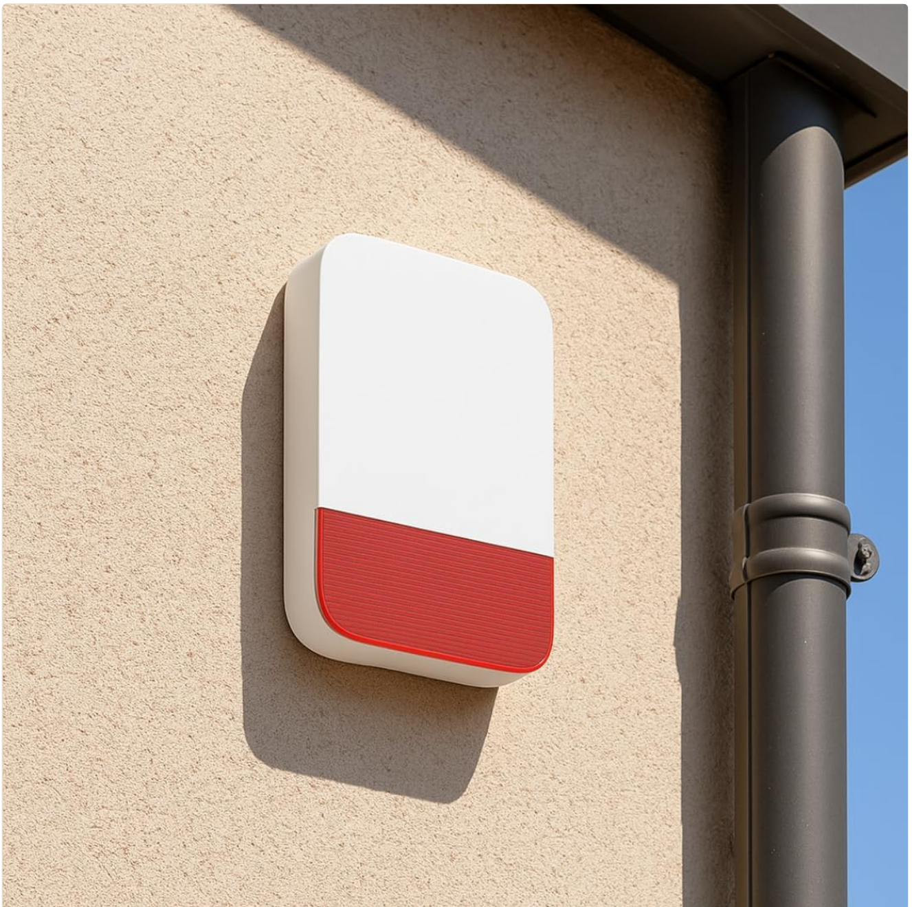
Image 5: The WOS305 outdoor wireless solar siren, part of the Daewoo Vigilia system.