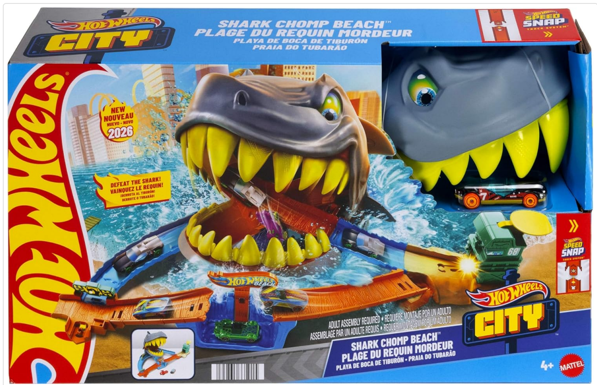
Image: The Hot Wheels City Shark Chomp Beach Playset in its retail packaging, showing the assembled playset and included car.

Your browser does not support the video tag.