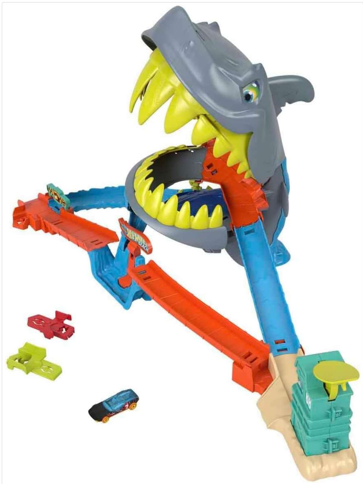
Image: All components of the Hot Wheels City Shark Chomp Beach Playset, including the shark structure, track pieces, launcher, and one die-cast car.