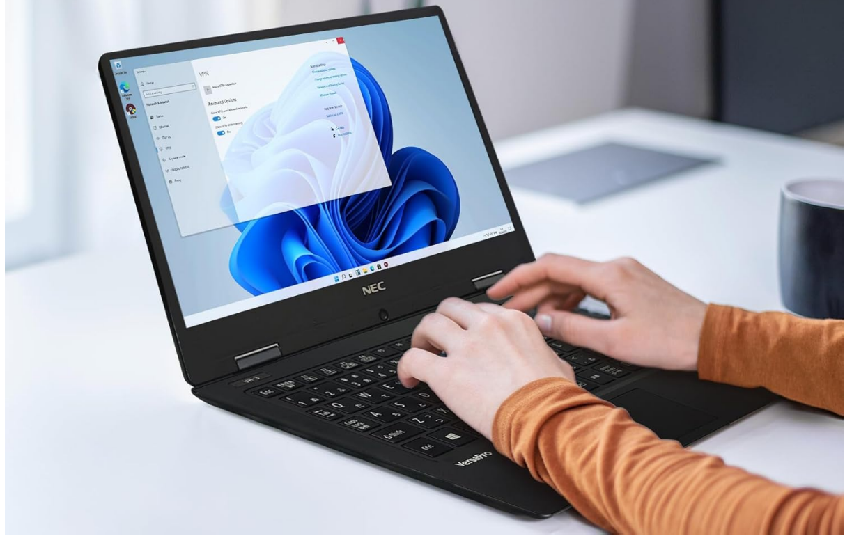
Image: Close-up of hands typing on the laptop's keyboard, illustrating the comfortable and precise typing experience provided by the Japanese layout keyboard.