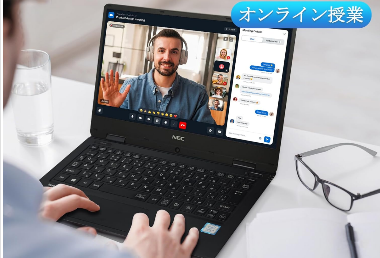
Image: A user engaged in a video conference call on the NEC VersaPro VH-1 laptop, demonstrating its web camera and dual microphone capabilities for remote work and online learning.