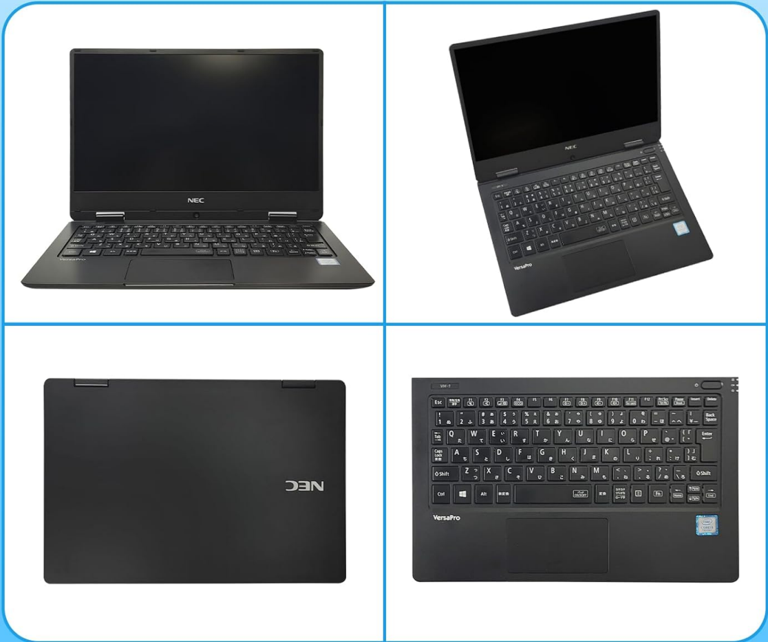
Image: Various views of the NEC VersaPro VH-1 laptop, showing the front, back, top, and keyboard layout.