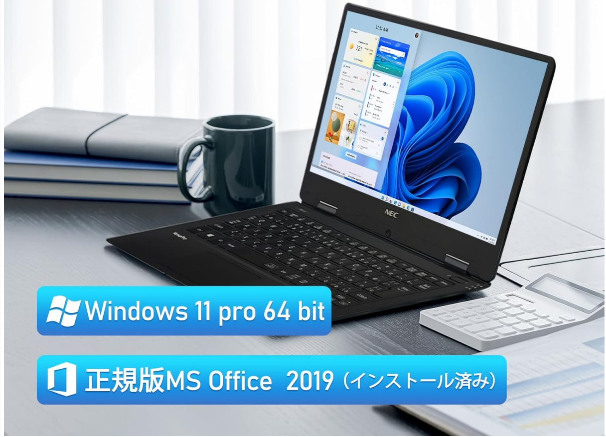
Image: The laptop displaying the Windows 11 interface, with logos indicating Windows 11 Pro and MS Office 2019 are installed and ready for use.