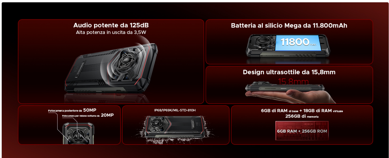
Figure 1: DOOGEE Blade 20 Pro Overview

The DOOGEE Blade 20 Pro is a robust and high-performance rugged smartphone designed to withstand challenging environments while offering advanced features. It operates on Android 15, boasts a large 11800mAh battery, a versatile 50MP camera system, and a powerful 125dB speaker. This manual provides essential information for optimal use and care of your device.