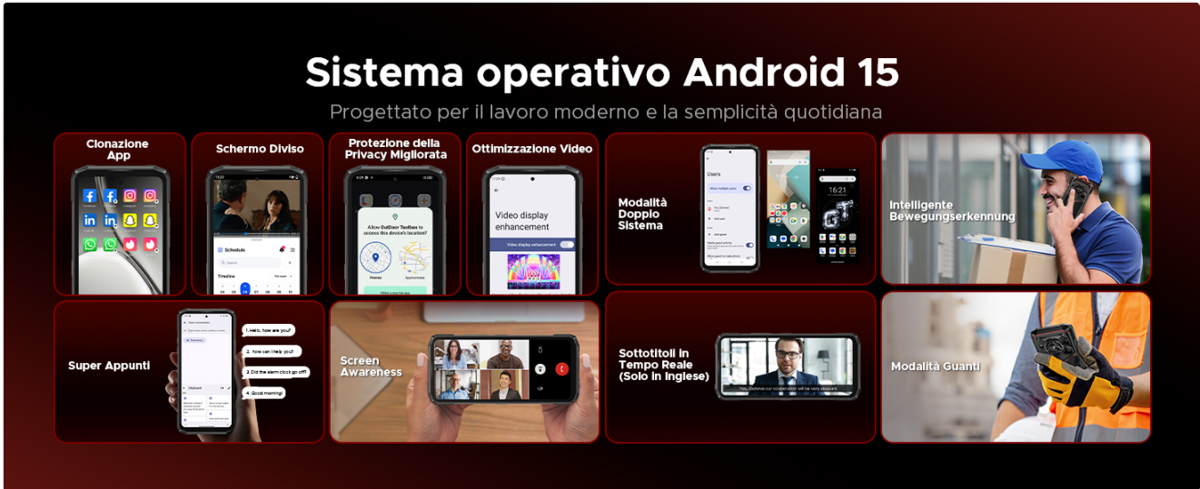
Figure 4: Android 15 Interface

Your DOOGEE Blade 20 Pro runs on Android 15, offering an optimized user interface and enhanced performance. Navigate through the system using gestures, access applications from the home screen or app drawer, and customize settings to your preference. Android 15 includes features for improved privacy, multitasking, and smart device connectivity.