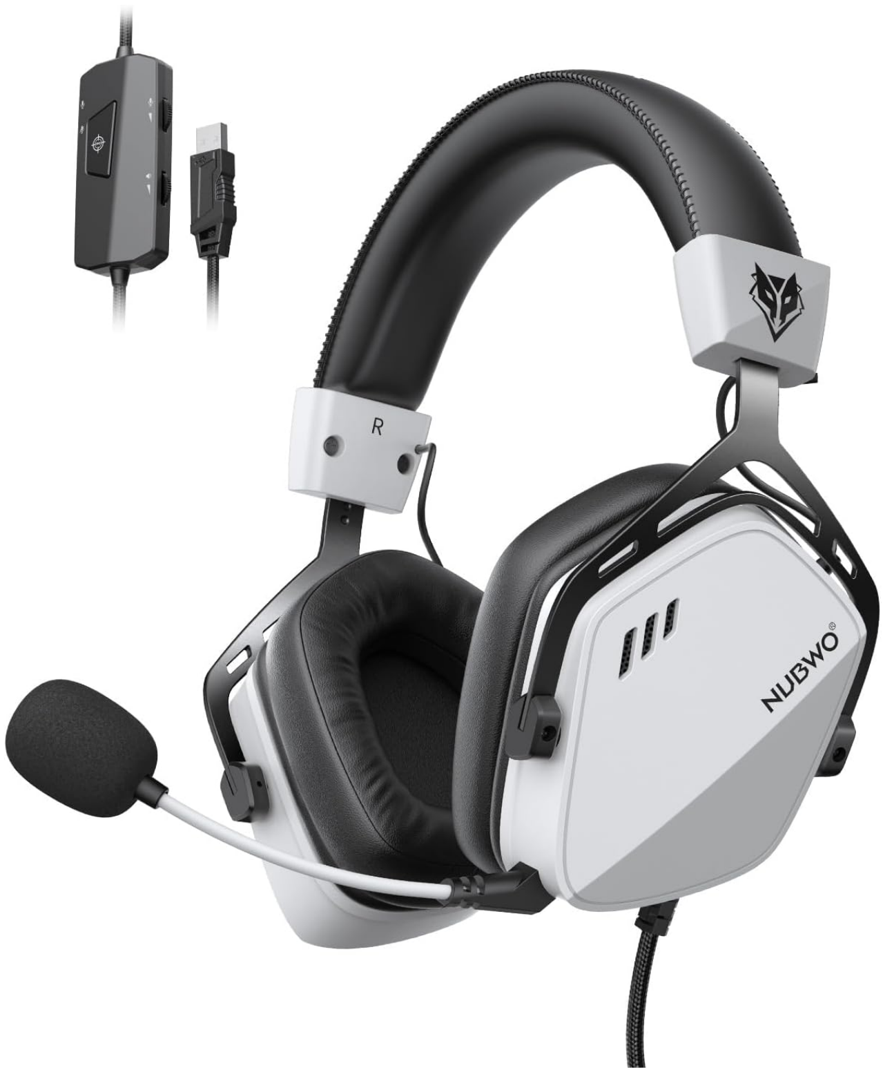
Image: The NUBWO HG03 USB Gaming Headset, showcasing its white and black design with the attached microphone and in-line controller.