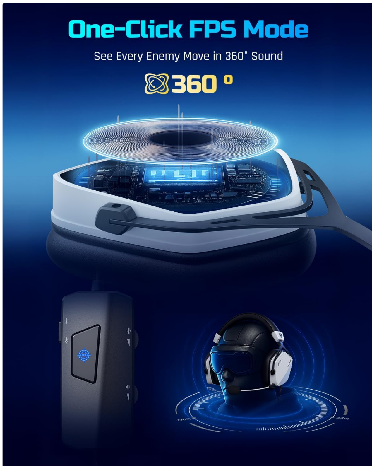
Image: A visual representation of the FPS 3D Spatial Sound feature, showing how sound cues are enhanced for positional awareness in gaming.

The headset's 3D spatial audio technology provides enhanced directional sound. When active, this feature helps you perceive the location of in-game sounds with greater accuracy, which is particularly beneficial in first-person shooter (FPS) games.