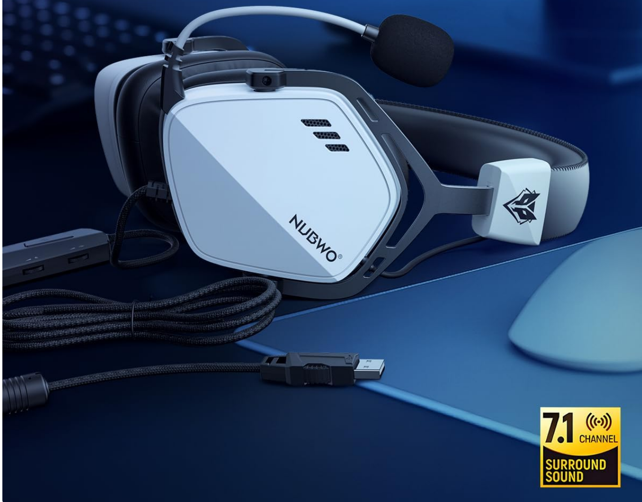
Image: The USB connector of the NUBWO HG03 headset, illustrating its plug-and-play compatibility with various devices.

Works with Any USB Audio Port, Not Controller-Compatible