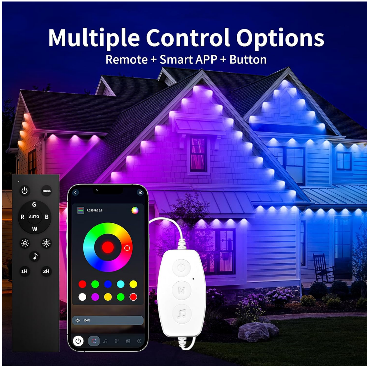
Image 3: Multiple control options for the lights, including remote, app, and button controller.