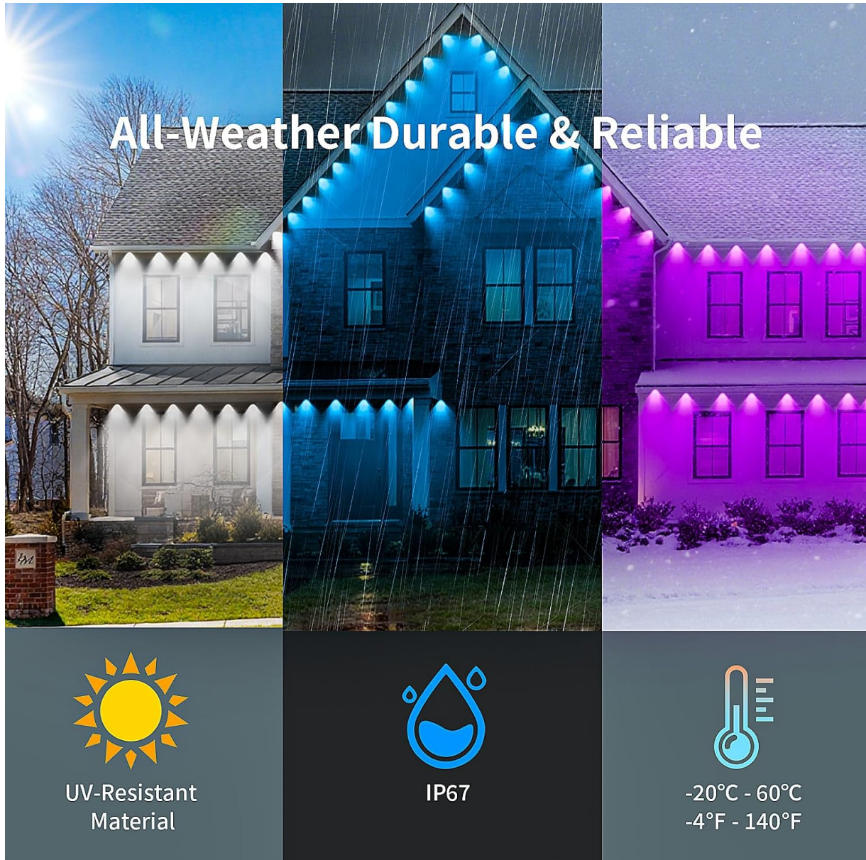
Image 2: Durability features of KSIPZE Permanent Outdoor Lights, showcasing resistance to sun, rain, and snow.

Safety Note: Ensure all connections are secure and protected from moisture. The lights are IP67 waterproof, and the control box is IP65, but proper installation is crucial for durability.