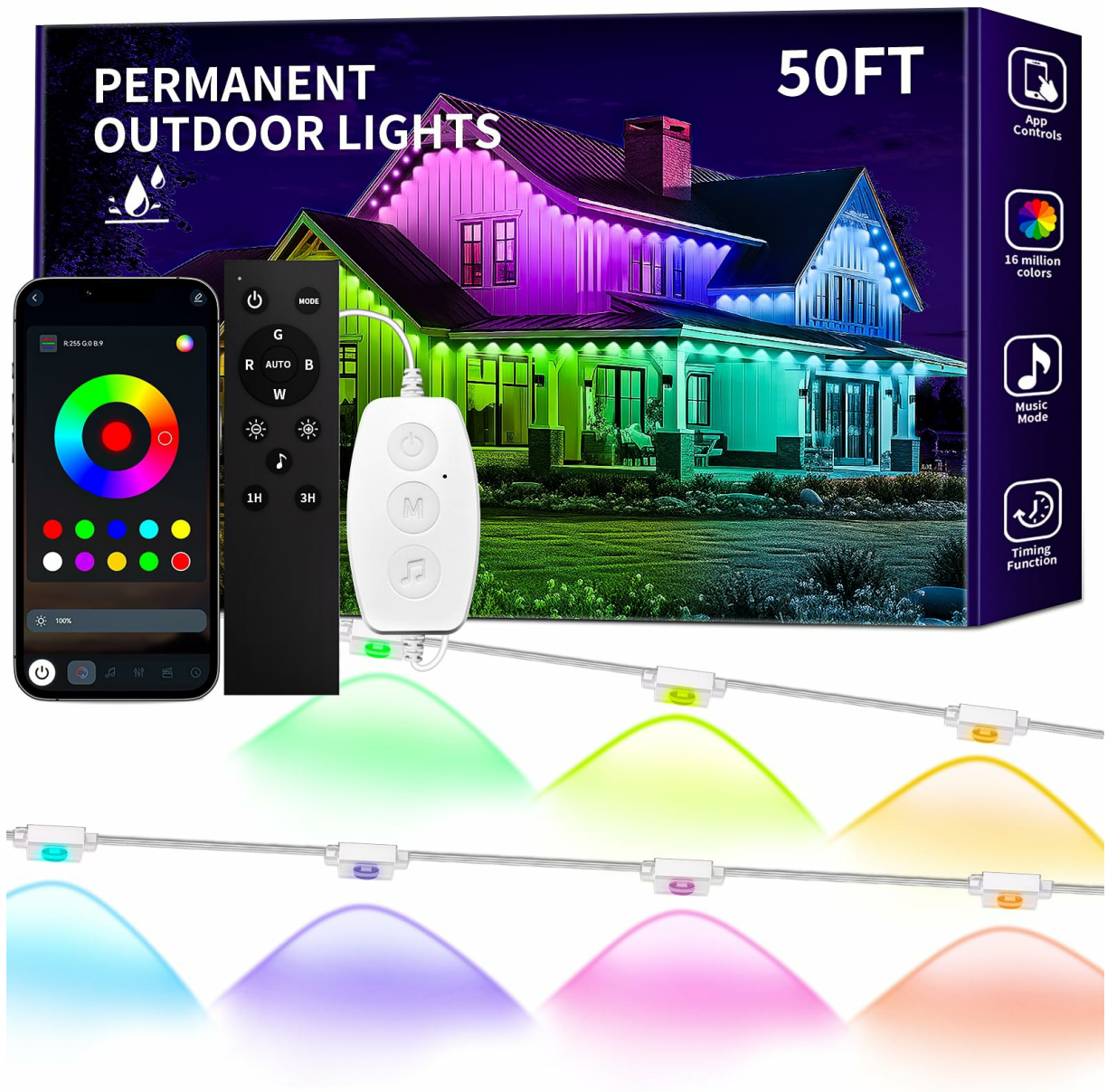
Image 1: KSIPZE Permanent Outdoor Lights installed on a house, displaying multiple colors.