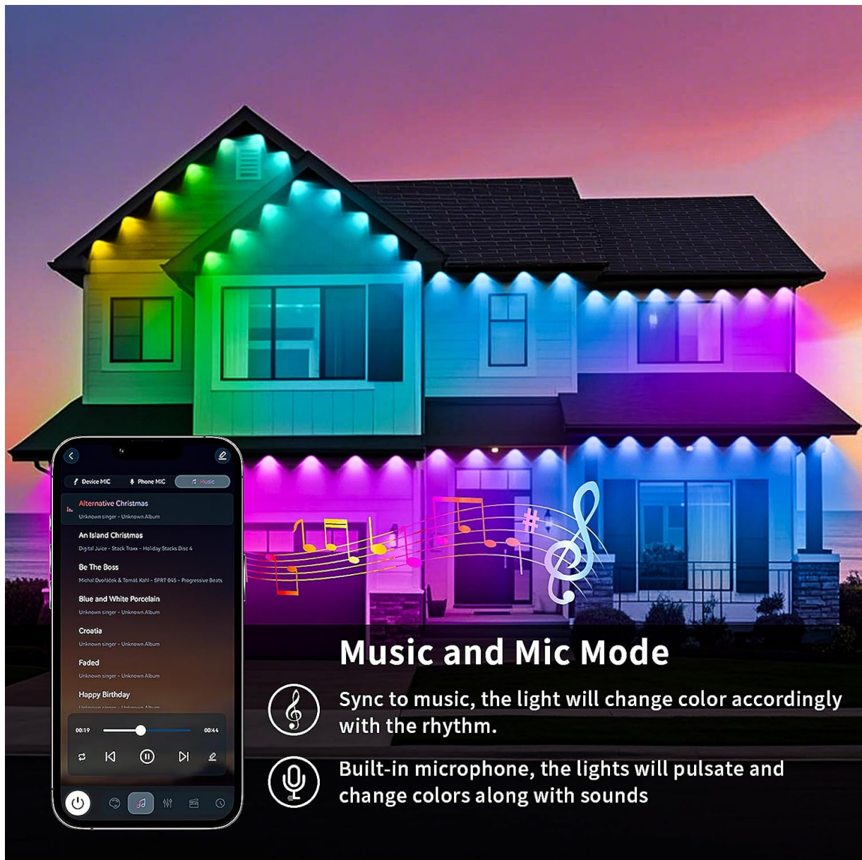
Image 4: The smart app's music and microphone mode, allowing lights to sync with audio.