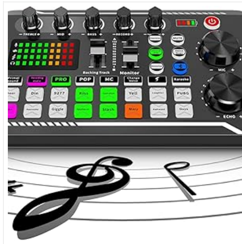
Figure 4: Close-up of the F998 mixer highlighting the Bluetooth connectivity feature.