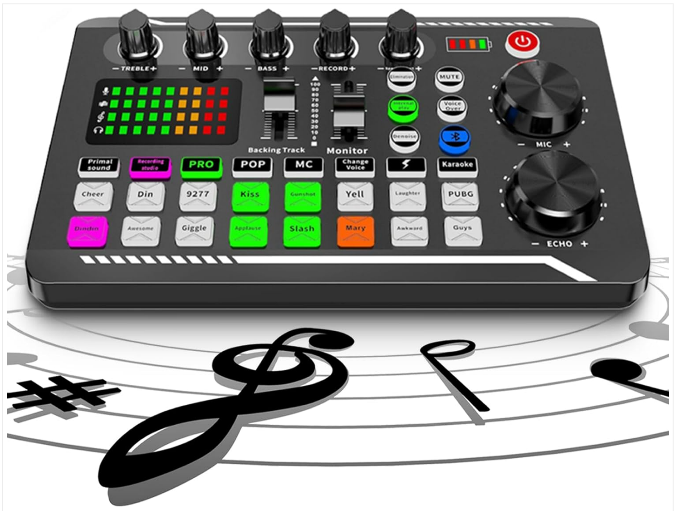
Figure 1: Front view of the F998 Live Sound Card Audio Mixer, showing various knobs, faders, and buttons for sound control and effects.