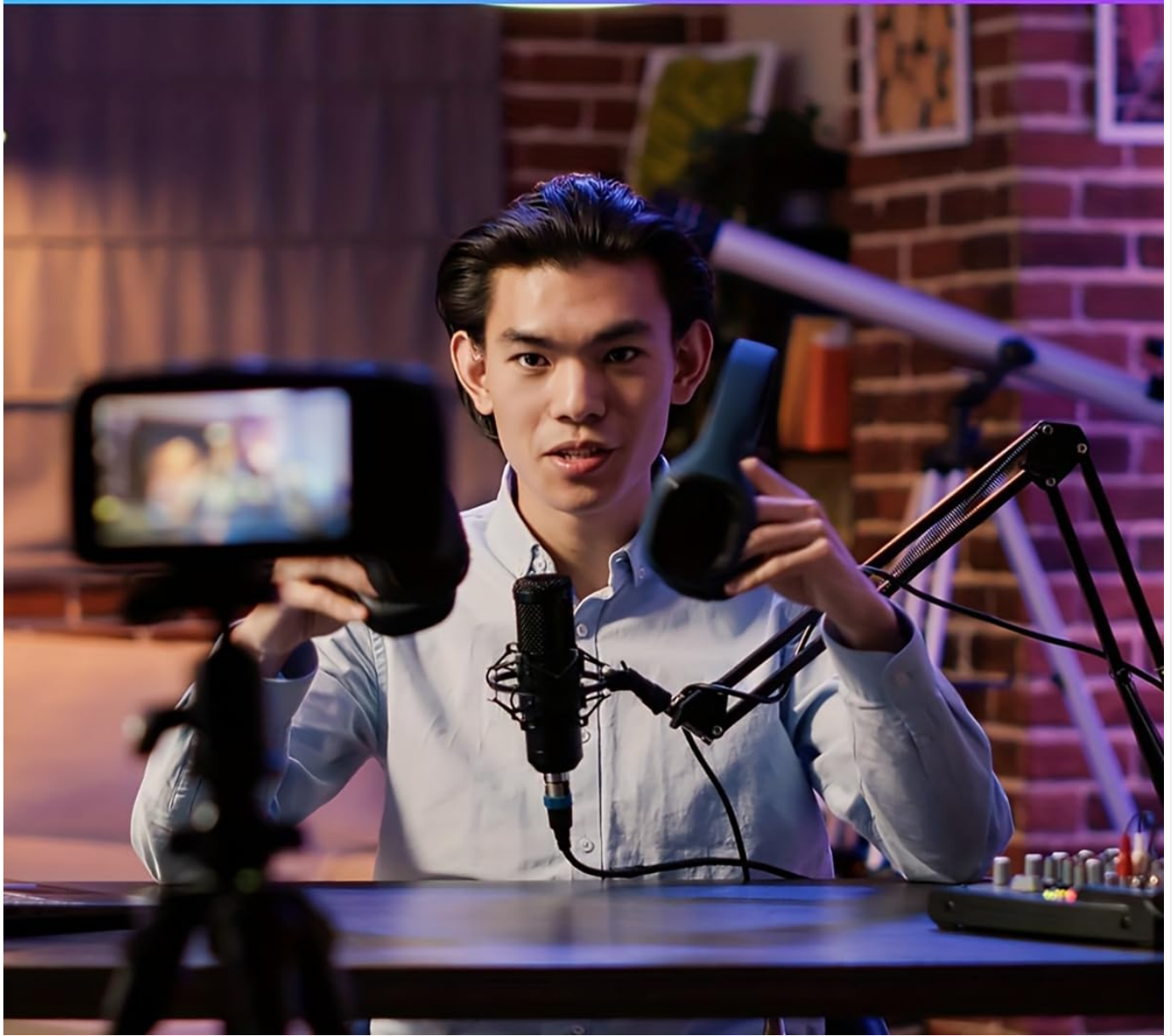
Figure 6: A content creator using the F998 mixer to broadcast live across multiple platforms.