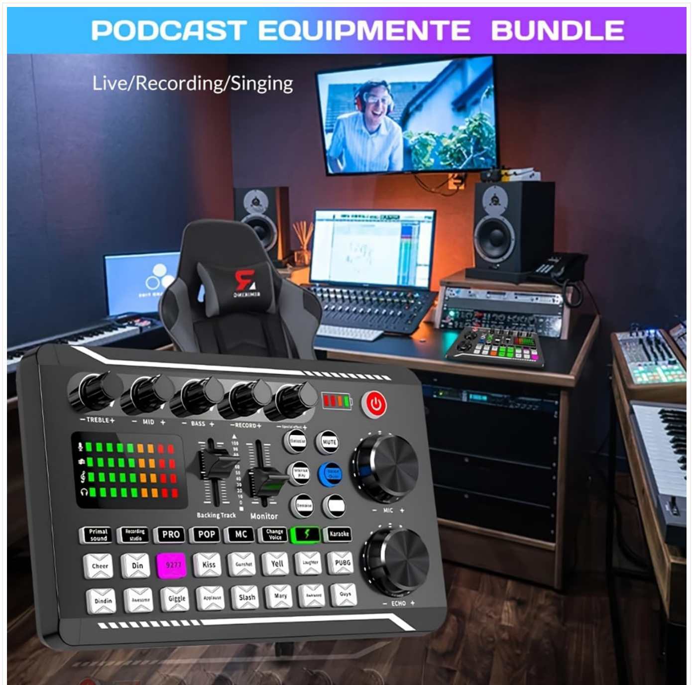
Figure 3: The F998 mixer integrated into a podcasting/streaming setup with a computer and microphone.