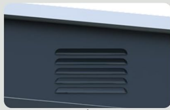
1 Side Air Vent