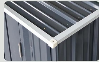
2 Edge Protection