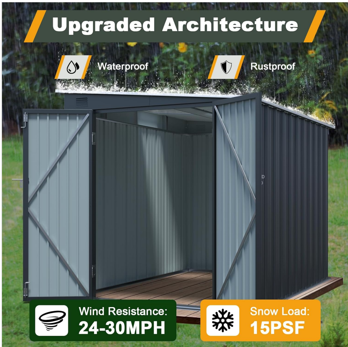
Figure 5: The shed features upgraded architecture for enhanced durability, including waterproof and rustproof materials, wind resistance up to 24-30 MPH, and a snow load capacity of 15 PSF.