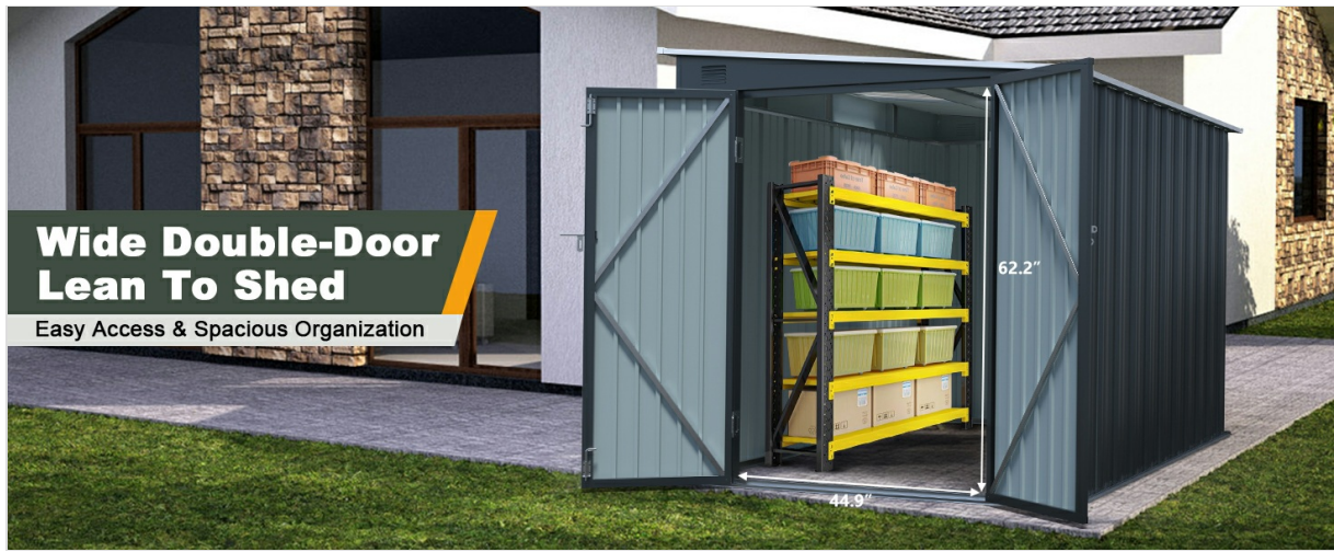
Figure 3: The wide double doors provide ample space for moving items in and out of the shed. The interior is shown with shelving for organized storage.