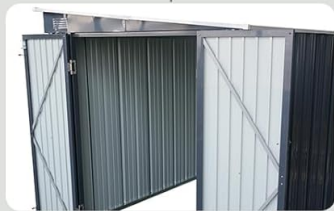
3 Double Doors