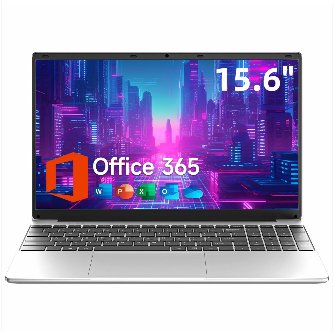
Image: The Jumper EZbook S7Hi laptop shown with its power adapter and user manual.