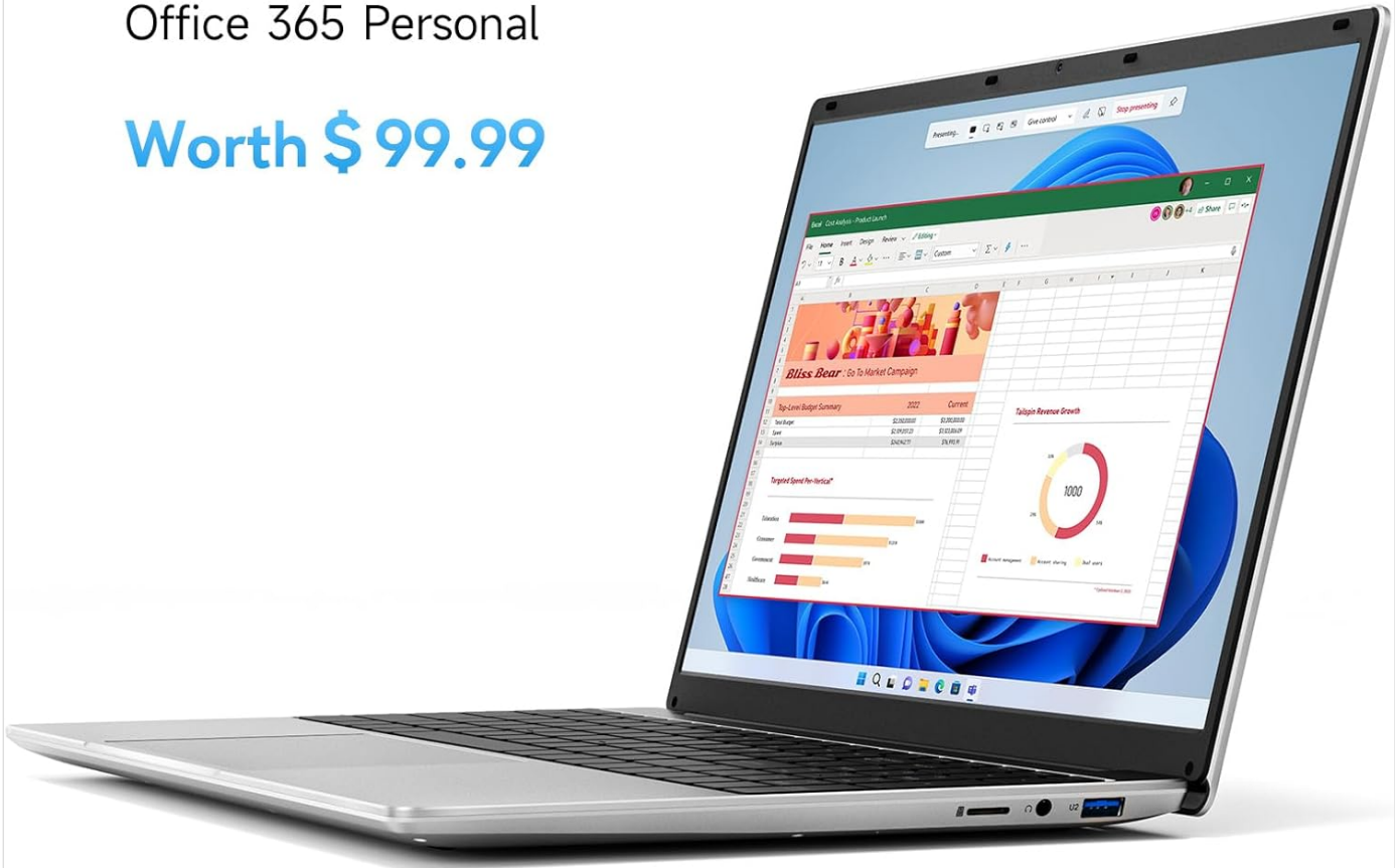
Image: The laptop's 15.6-inch HD display, highlighting its 16:9 aspect ratio and 5mm ultra-narrow bezels.