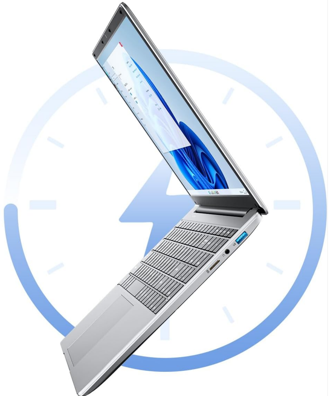
Image: Close-up of the laptop's keyboard, featuring a separate numeric keypad, large touchpad, and a front 2MP webcam.