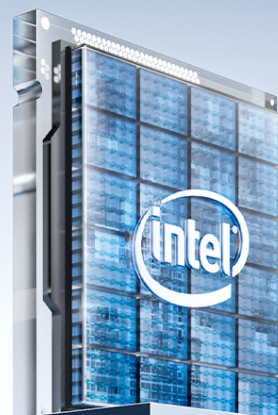
Image: Diagram illustrating the Intel 5205U processor with 1.9GHz burst frequency, 2 cores, 2 threads, and 2MB cache.

1.9GHz | 14nm Burst Frequency | Lithography 2 | 2 | 2MB Cores | Threads | Cache