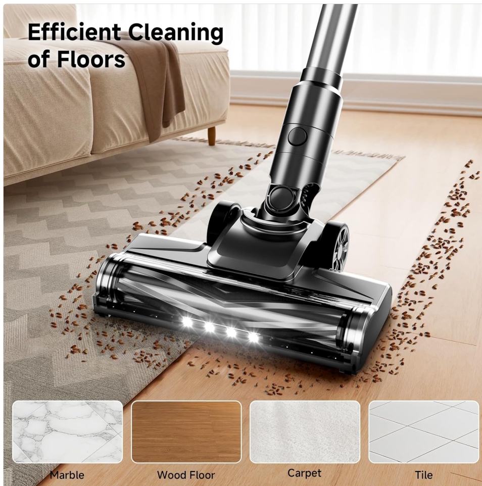
Figure 5.2: The fenhua X8 cordless vacuum cleaning various floor types including marble, wood floor, carpet, and tile, demonstrating its versatility and efficiency.