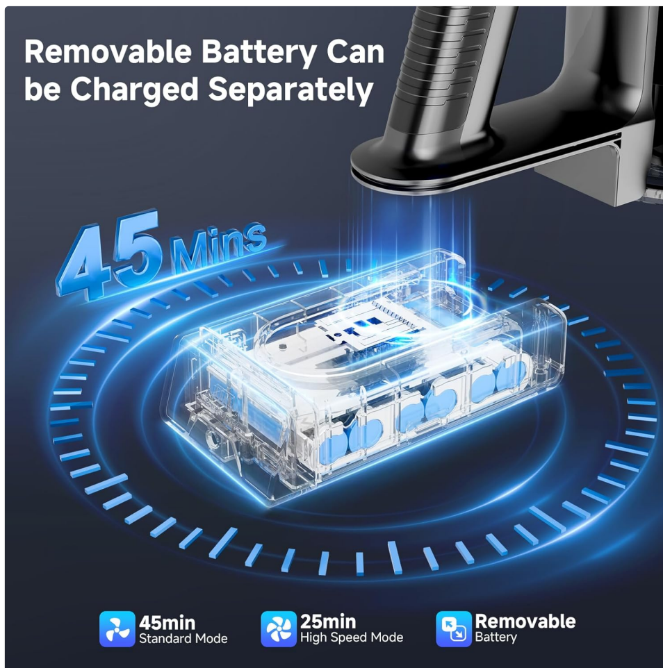
Figure 4.1: Exploded view of the fenhua X8 cordless vacuum's removable battery, highlighting its capacity for up to 45 minutes in standard mode and 25 minutes in high-speed mode.

The battery provides up to 45 minutes of runtime in Eco Mode and up to 25 minutes in Maximum Mode, depending on usage.