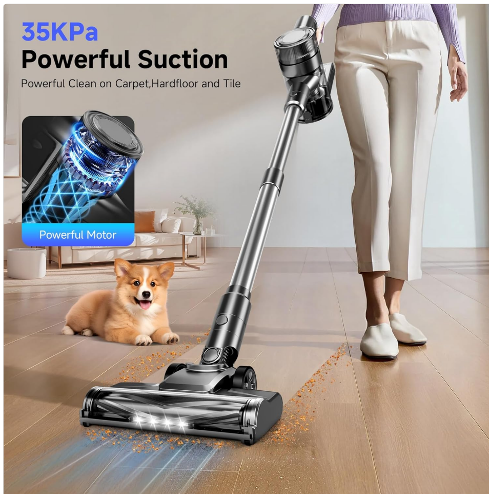
Figure 5.1: A woman vacuuming a hard floor with the fenhua X8 cordless vacuum, demonstrating its powerful 35KPa suction, with a small dog nearby. An inset shows the powerful motor.