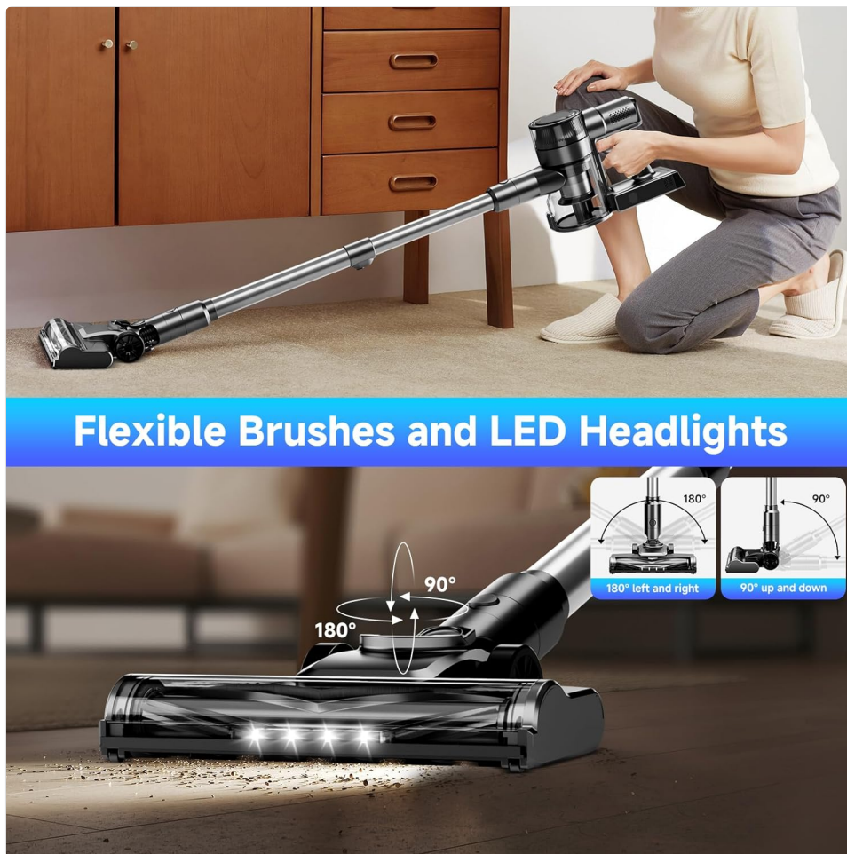
Figure 5.4: Close-up of the fenhua X8 cordless vacuum's flexible brush head with LED headlights, showing its 180-degree sideways rotation and 90-degree up and down movement for cleaning under furniture.