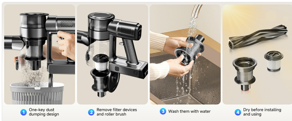
Figure 6.2: Four-step visual guide for cleaning the feihua X8 vacuum: one-key dustbin emptying, removing filter devices and roller brush, washing components with water, and drying before reinstallation.