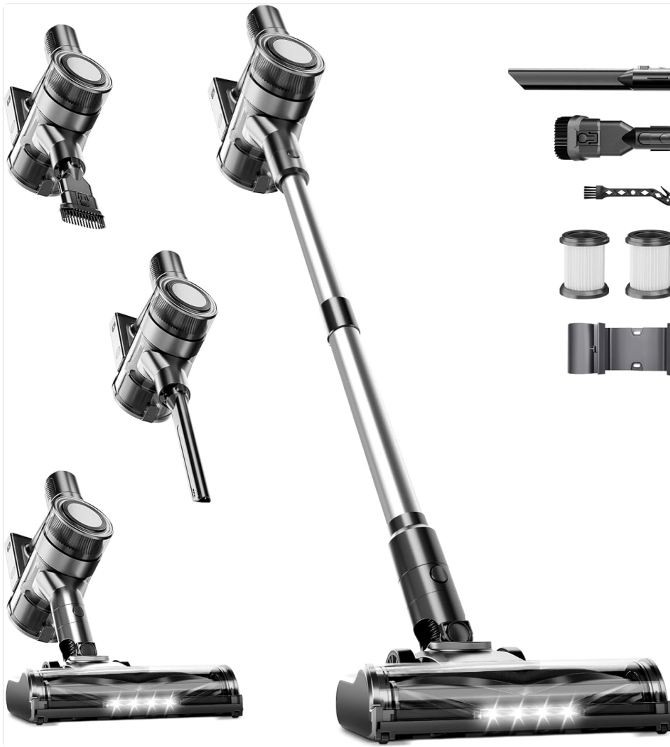
Figure 2.1: fenhua Cordless Vacuum Cleaner X8 and included accessories, showing the main unit, extension wand, motorized floor brush, 2-in-1 dusting brush, crevice tool, wall mount, and spare filters.