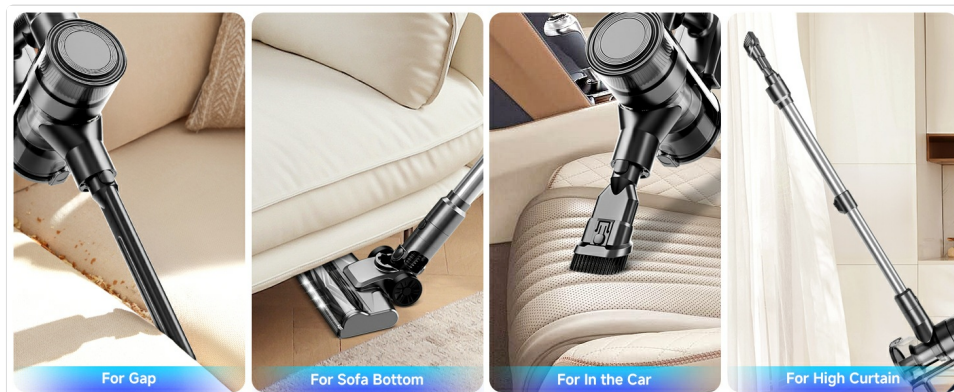
Figure 5.3: Four images demonstrating the versatile use of fenhua X8 vacuum attachments: cleaning narrow gaps, under sofa cushions, inside a car, and reaching high curtains.