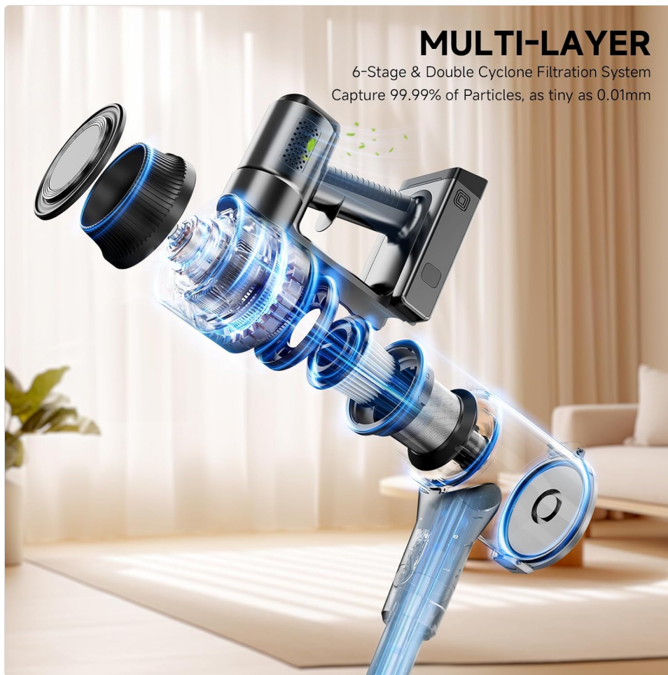
Figure 6.1: An exploded diagram of the feihua X8 cordless vacuum's 6-stage and double cyclone filtration system, showing the various components including the HEPA filter, designed to capture 99.99% of particles.