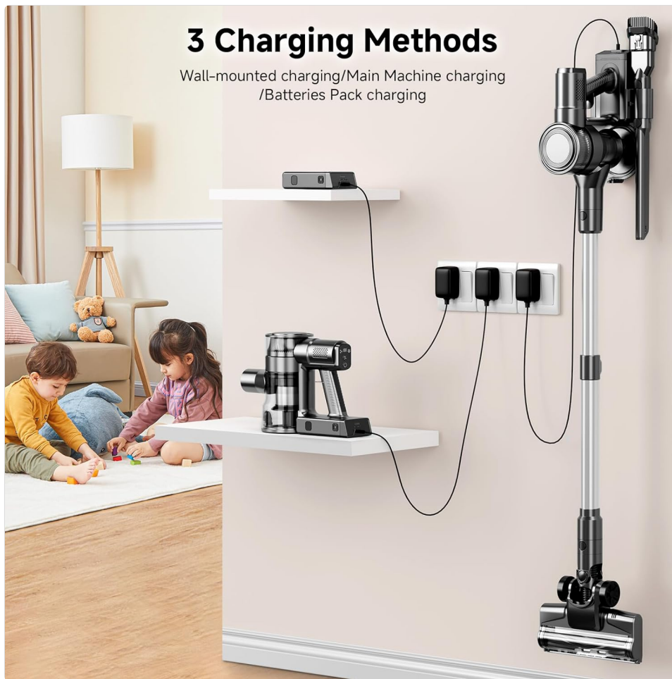
Figure 4.2: Illustration of the three charging methods for the fenhua X8 cordless vacuum: wall-mounted charging, main machine charging, and separate battery pack charging.