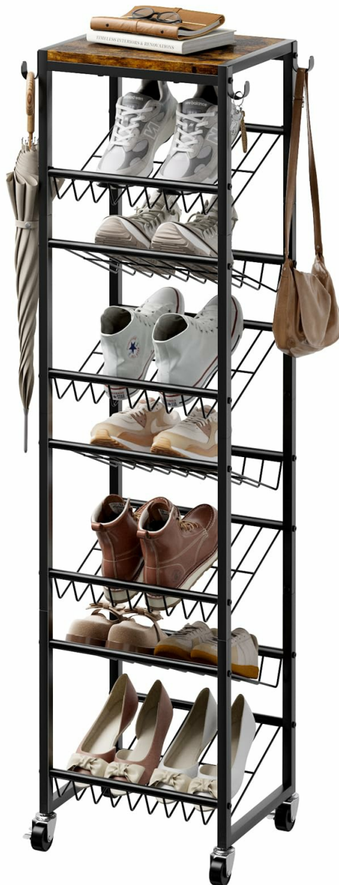
Image 1.1: The UNITSTAGE 8-Tier Rotating Vertical Shoe Rack Tower in a closet, showcasing its compact design and storage capacity.