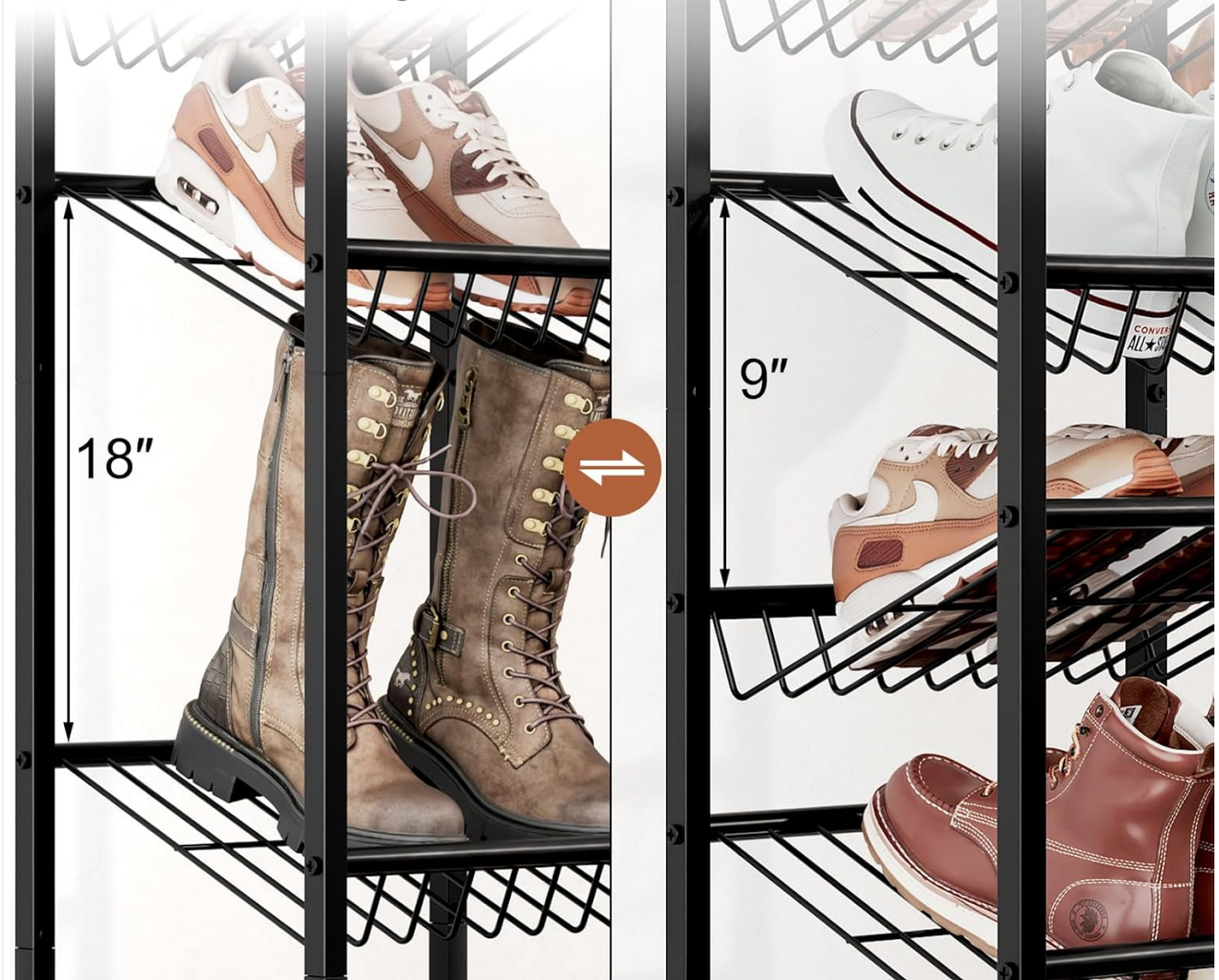
Image 4.2: Example of adjustable shelf configuration to accommodate different shoe heights, such as boots.

Detachable shelves are designed to accommodate shoes of different heights.