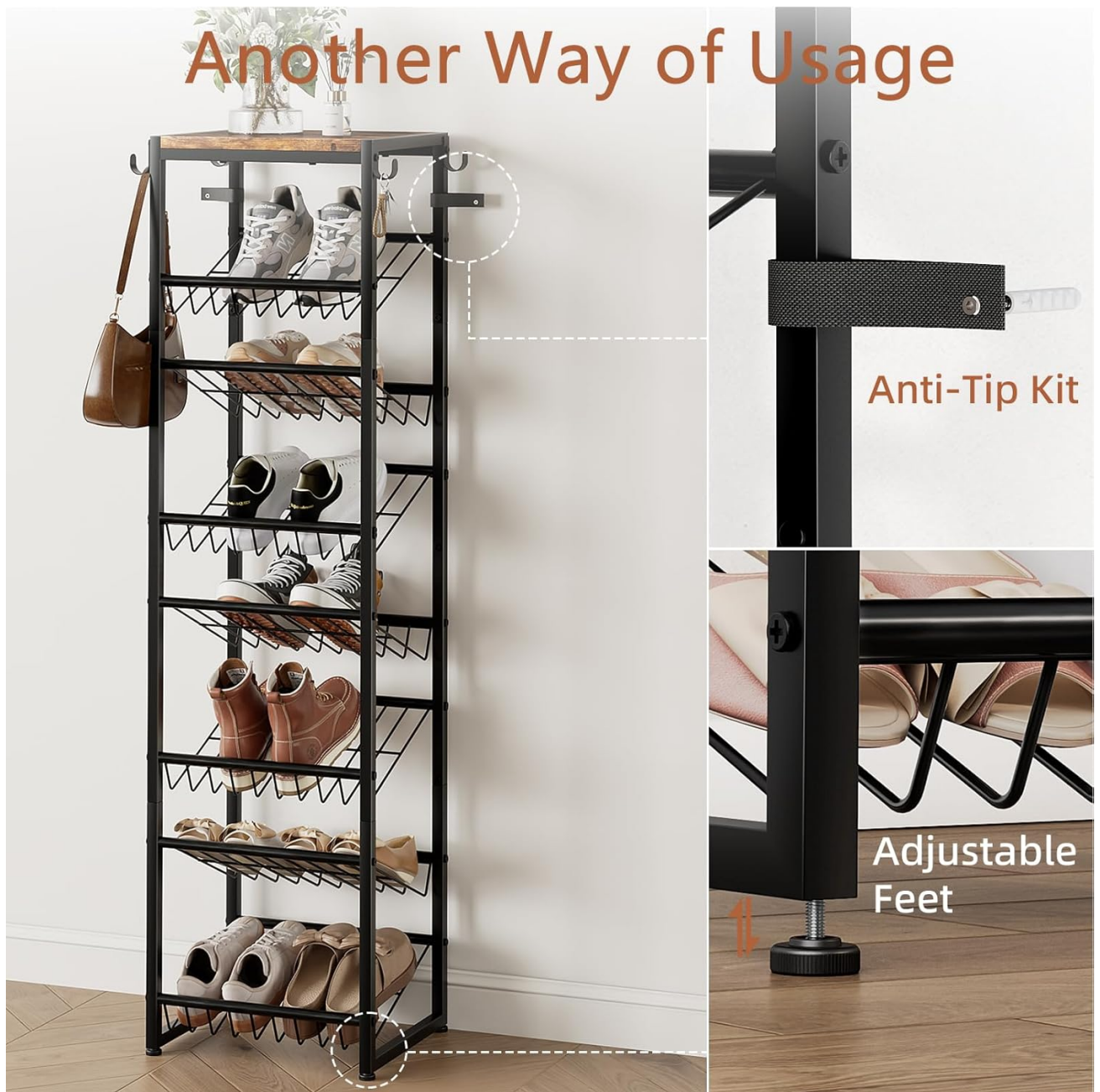
Image 2.1: Detail showing the anti-tip kit for wall attachment and adjustable feet for stability on uneven surfaces.