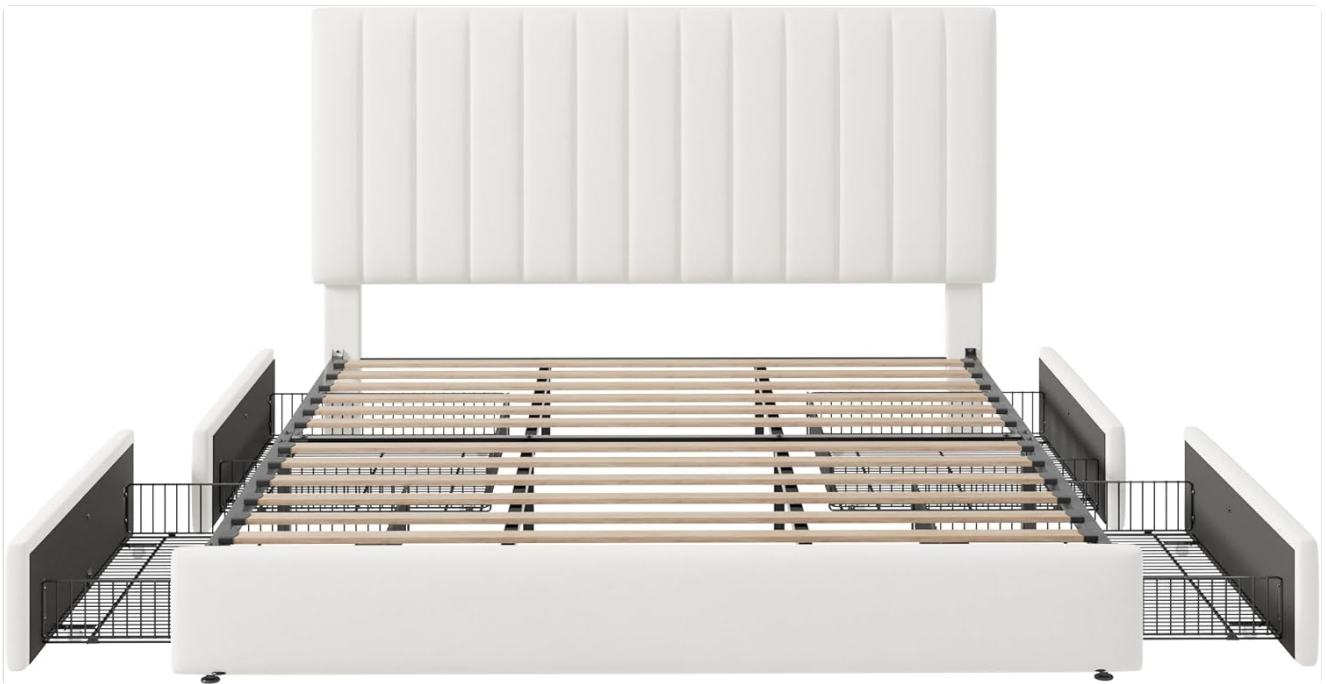
Image: An overhead view of the Allewie bed frame structure, highlighting the robust wooden slat support system and the four underbed storage drawers.