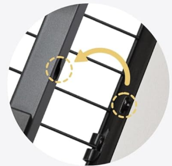
Exquisite Latch Design