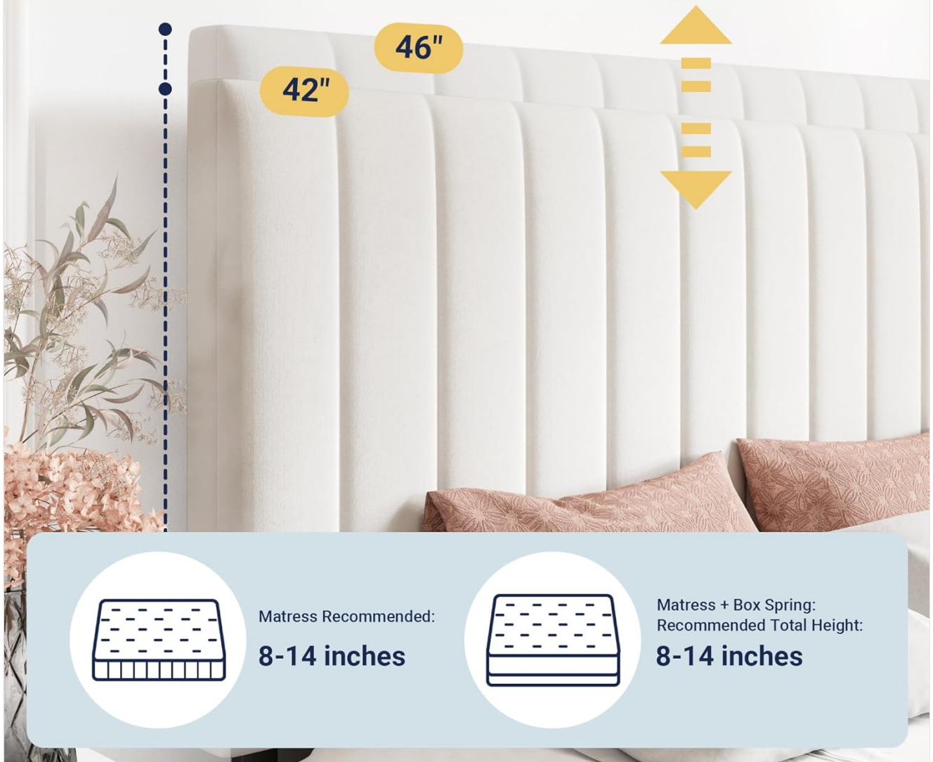
Image: Diagram illustrating the adjustable height feature of the headboard, showing the 42-inch and 46-inch settings and recommended mattress heights.