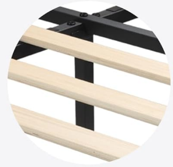
Robust Wooden System