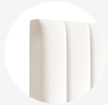
Modern & Chic Design