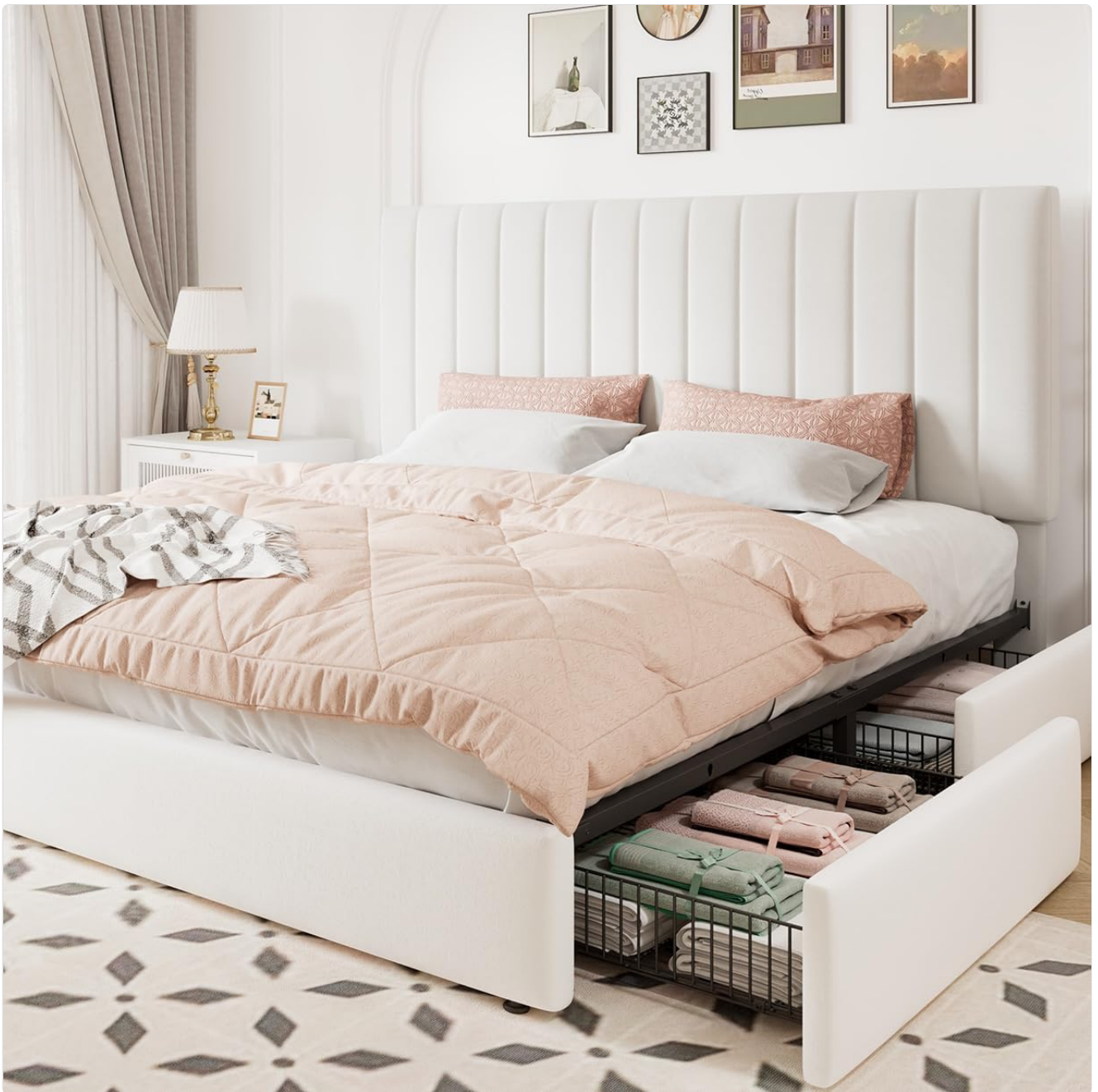
Image: The Allewie King Size Storage Bed Frame in a bedroom setting, showcasing the integrated underbed storage drawers.