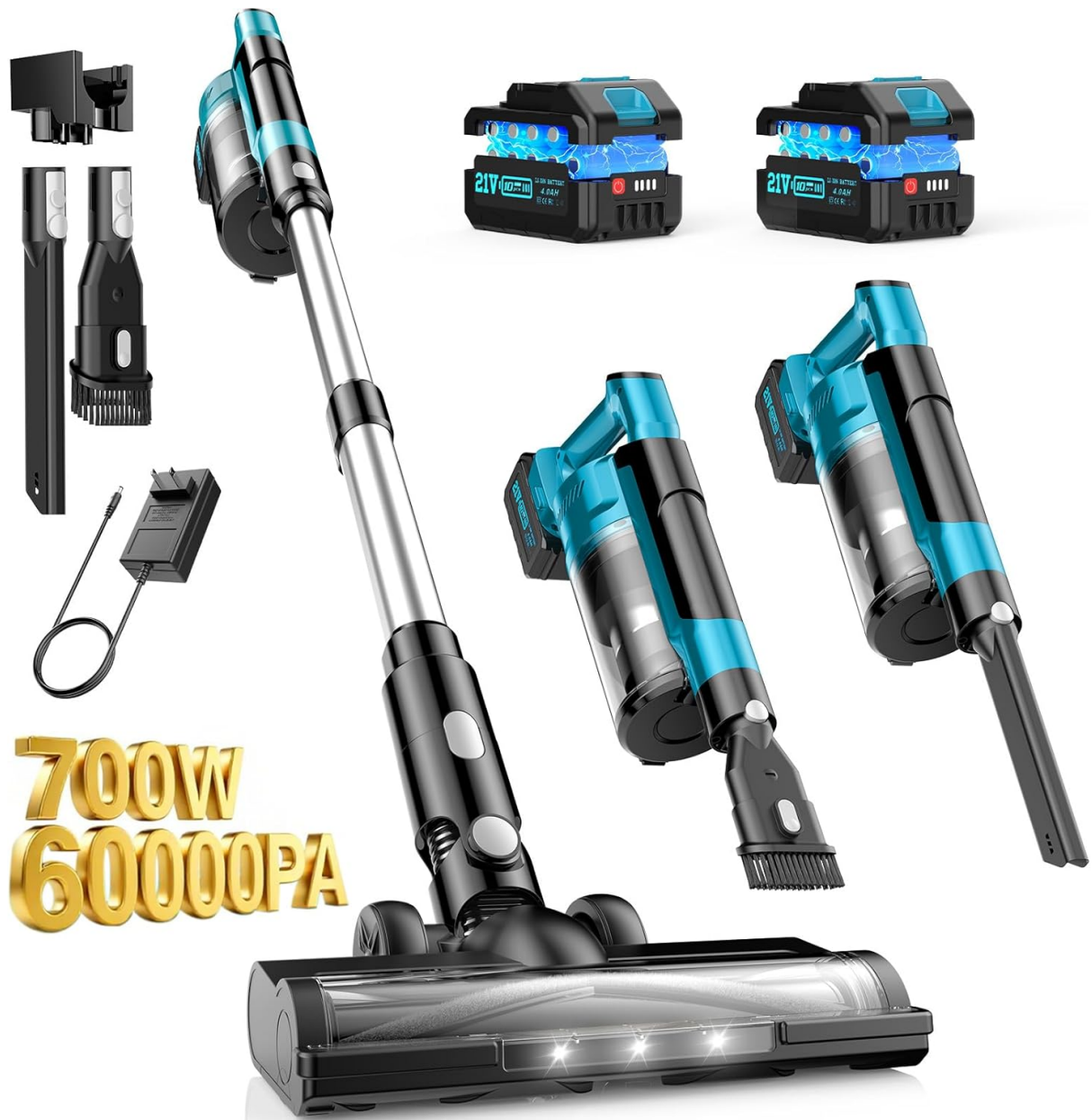
Figure 1: denqir 700W Cordless Vacuum Cleaner with included accessories.