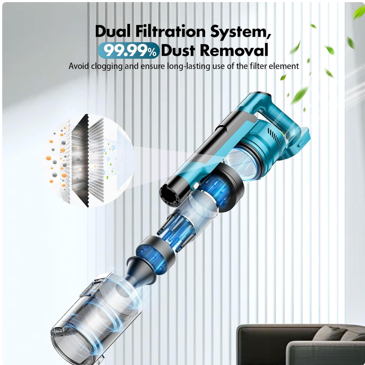
Figure 7: The 8-layer filtration system ensures efficient particle capture.