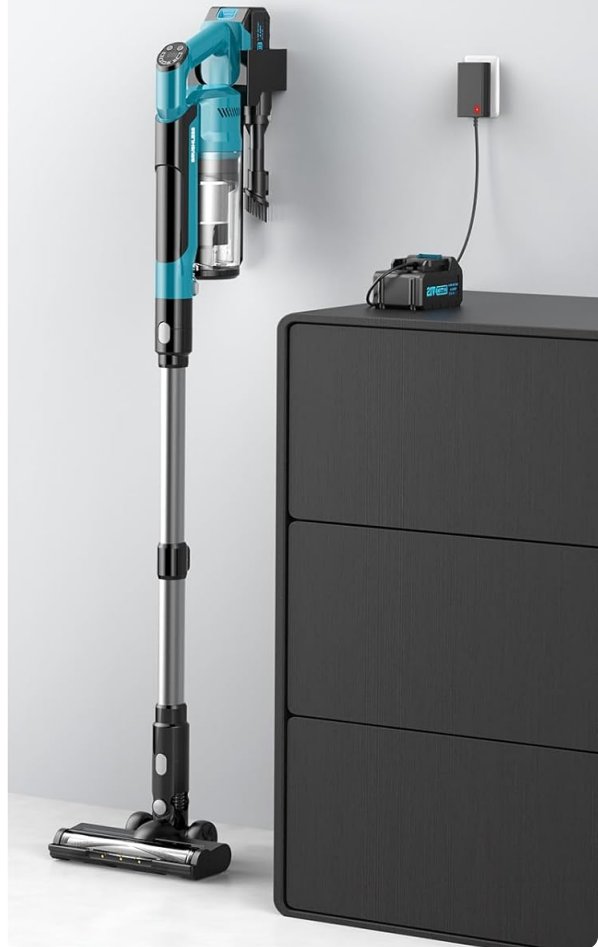
Figure 6: The dust cup can be emptied with a single click.