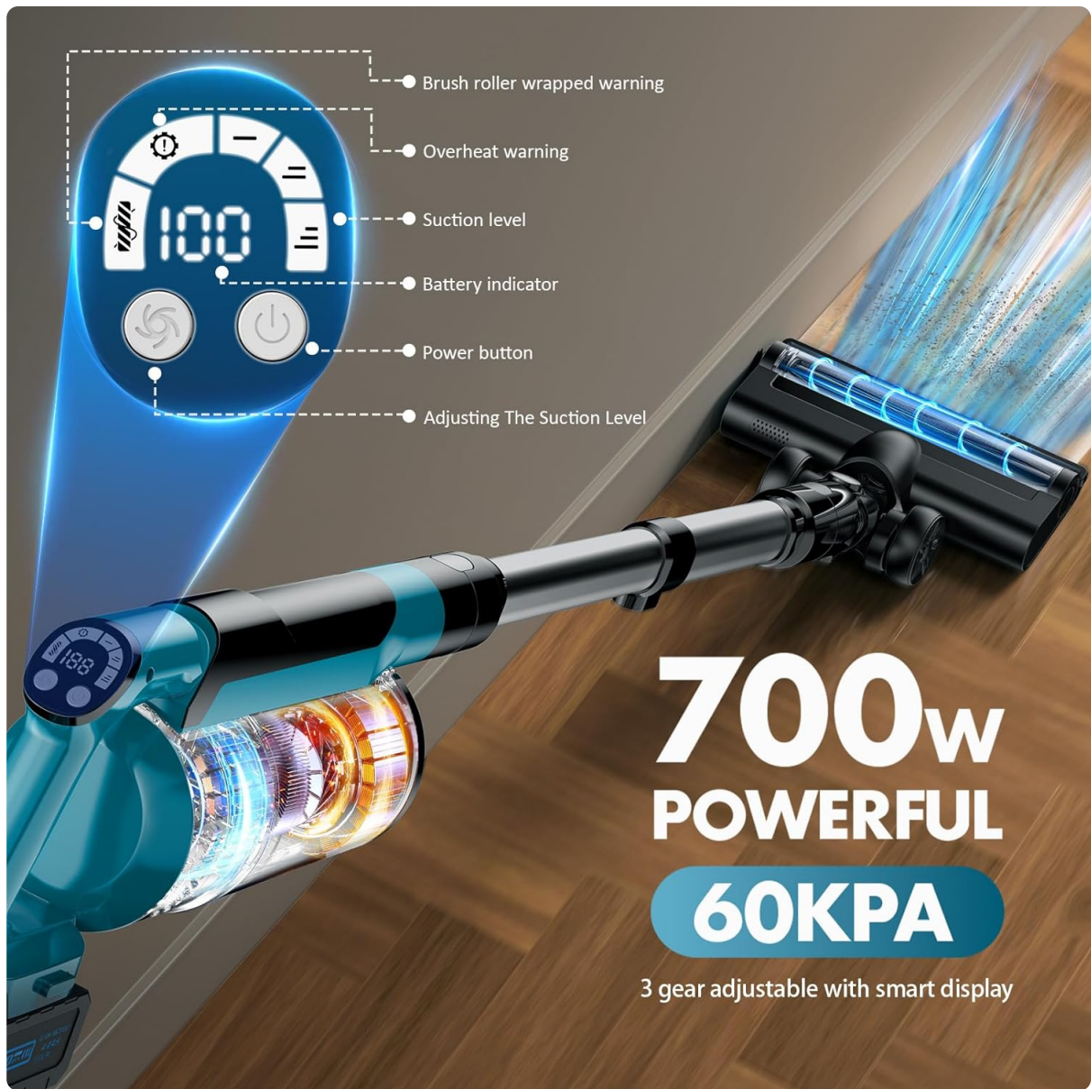
Figure 2: Close-up of the intelligent LED display on the main unit.