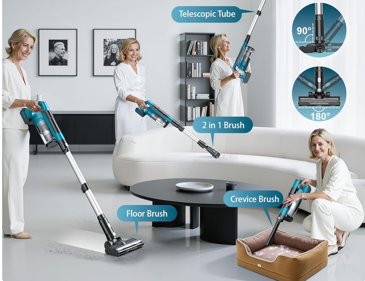
Figure 5: The vacuum can be configured with different attachments for various cleaning tasks.

Video 3: Full review of the vacuum cleaner's features and operation.