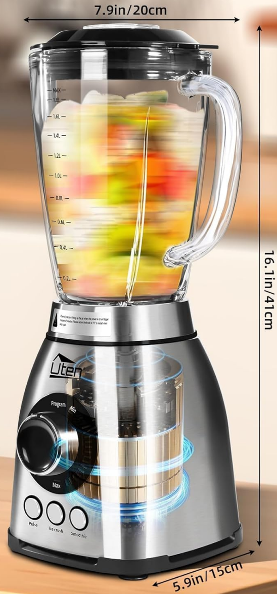
Image: Detailed view of the Uten Blender's 800W motor, 42000 RPM, 6-blade assembly, and overall dimensions. Also shows the retaining ring wrench and the safety lock mechanism for the jar.