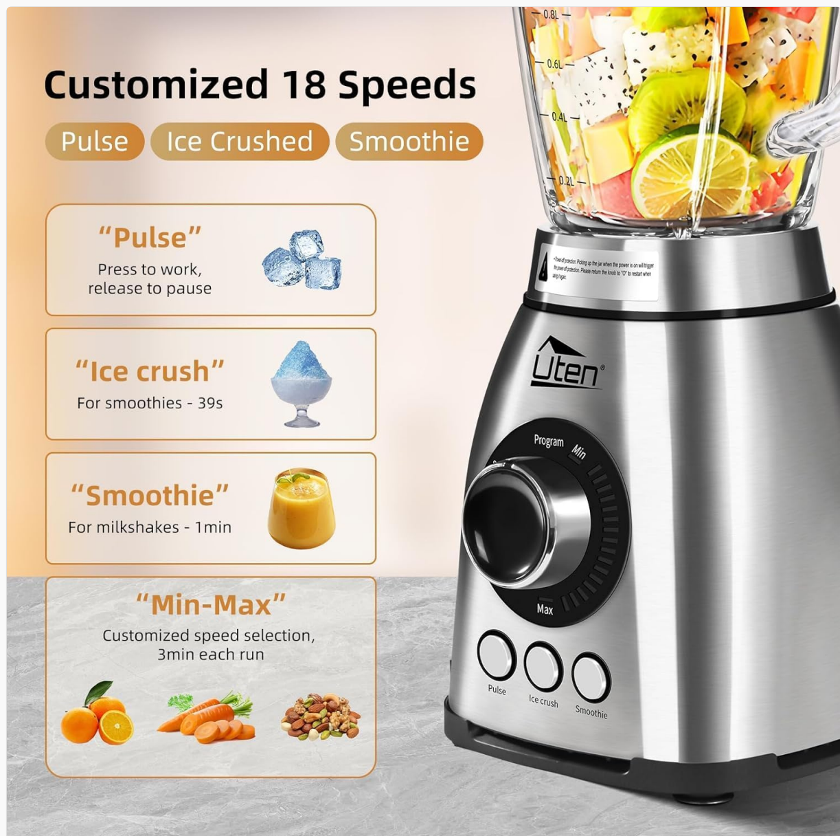
Image: The Uten Blender's control panel, highlighting the 18-speed dial and three dedicated program buttons: Pulse, Ice Crush, and Smoothie. Descriptions for each program are also shown.

The Uten Blender offers 18 variable speed levels and 3 automatic programs for versatile blending.