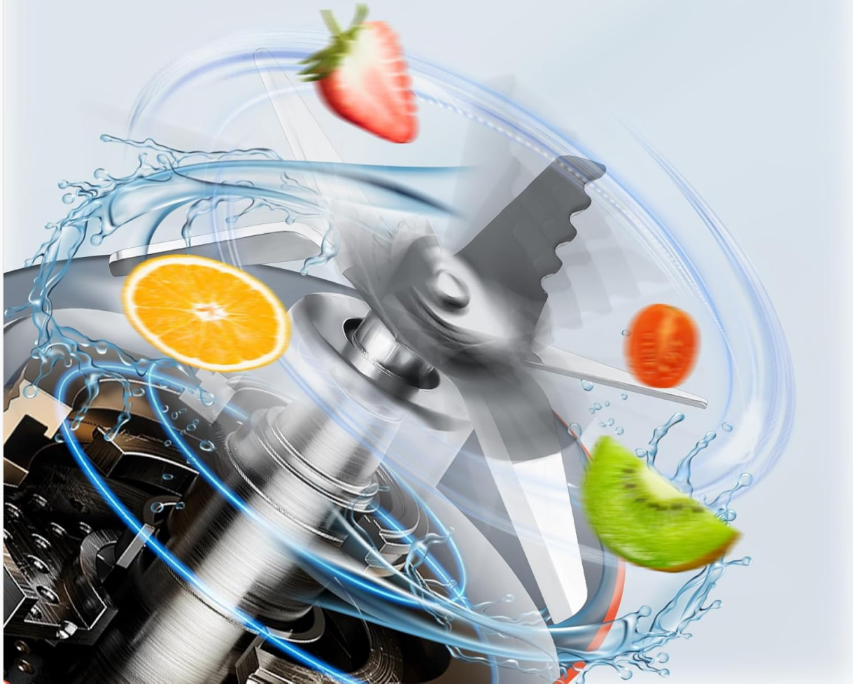
Image: Close-up illustration of the Uten Blender's 6-blade system, demonstrating its high-efficiency mixing capability with fruits like strawberry, orange, and kiwi being blended.