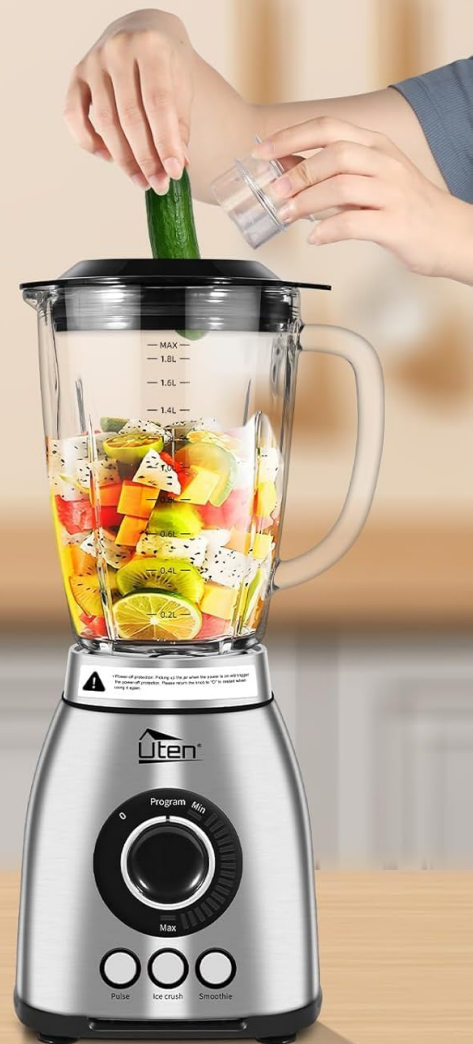
Image: Uten Blender showcasing food-grade materials and safety features like overheating protection, heat dissipation, non-slip base, and a durable glass jug. Fresh fruits are visible around the blender.