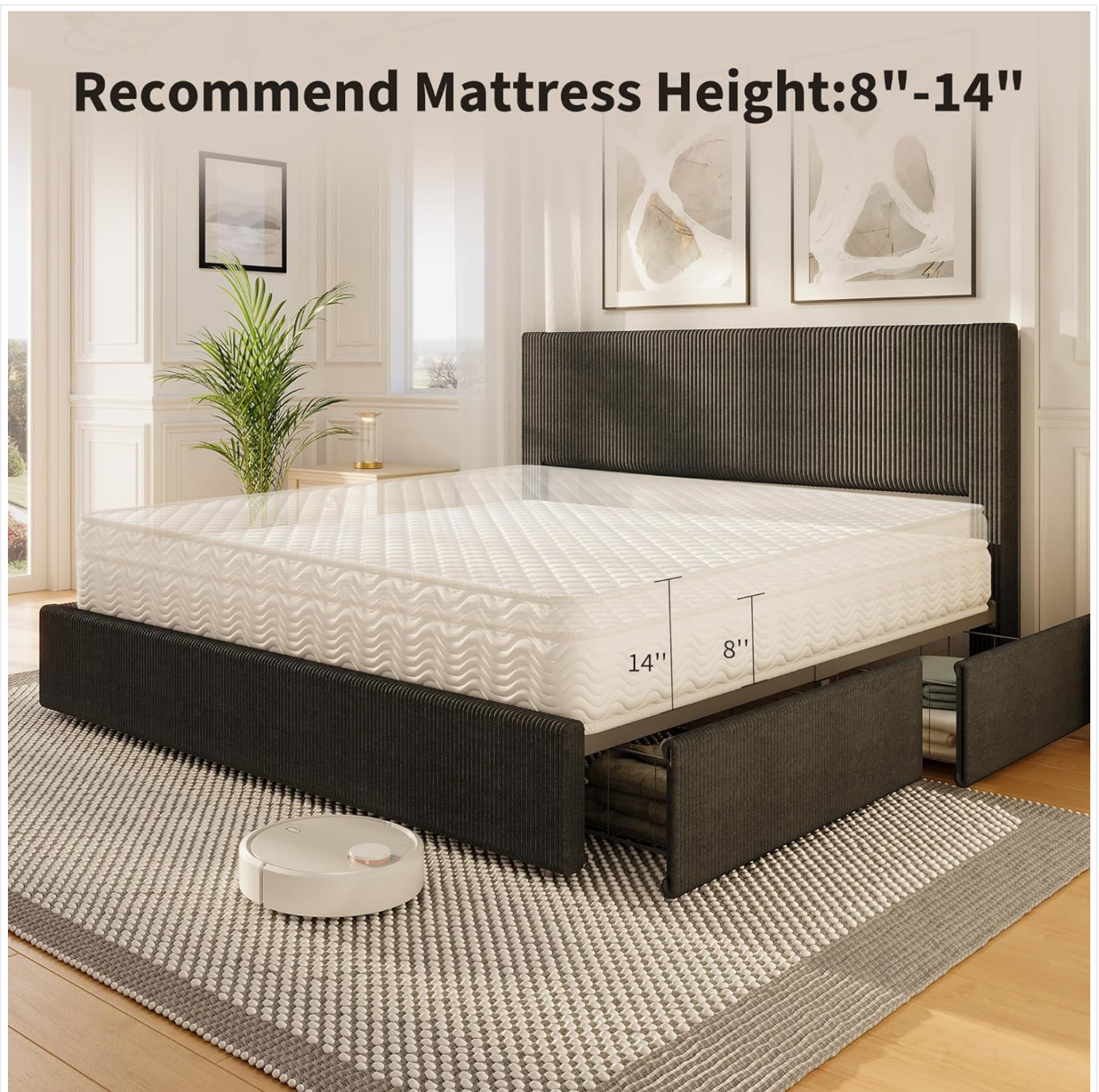
Image 4.2.1: An illustrative image showing the recommended mattress height range of 8 to 14 inches for the IDEALHOUSE bed frame, ensuring proper fit and appearance.