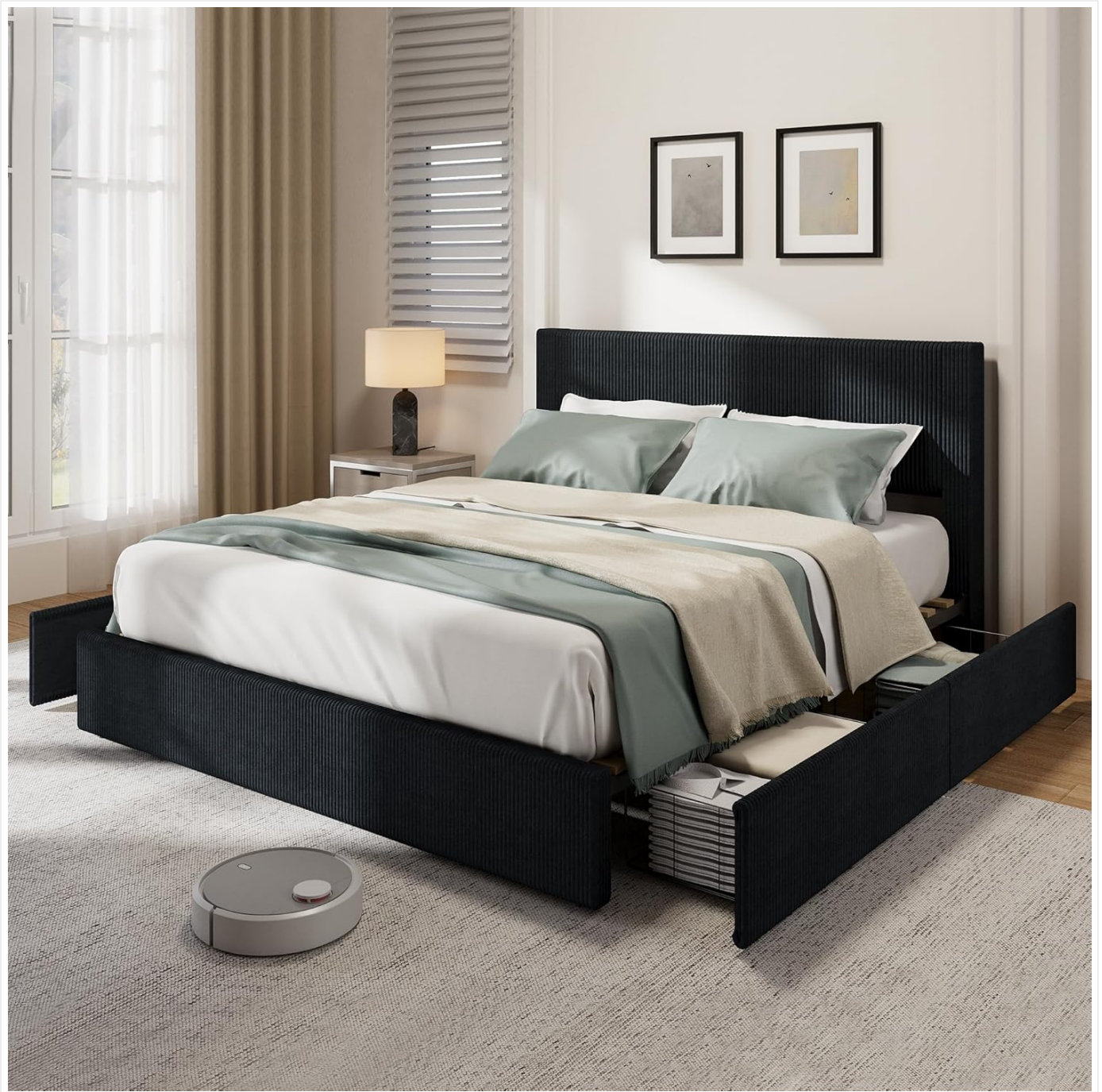
Image 4.1.1: The IDEALHOUSE Full Size Bed Frame in a bedroom, demonstrating the functionality of the four storage drawers, with two drawers partially pulled out to show stored items.