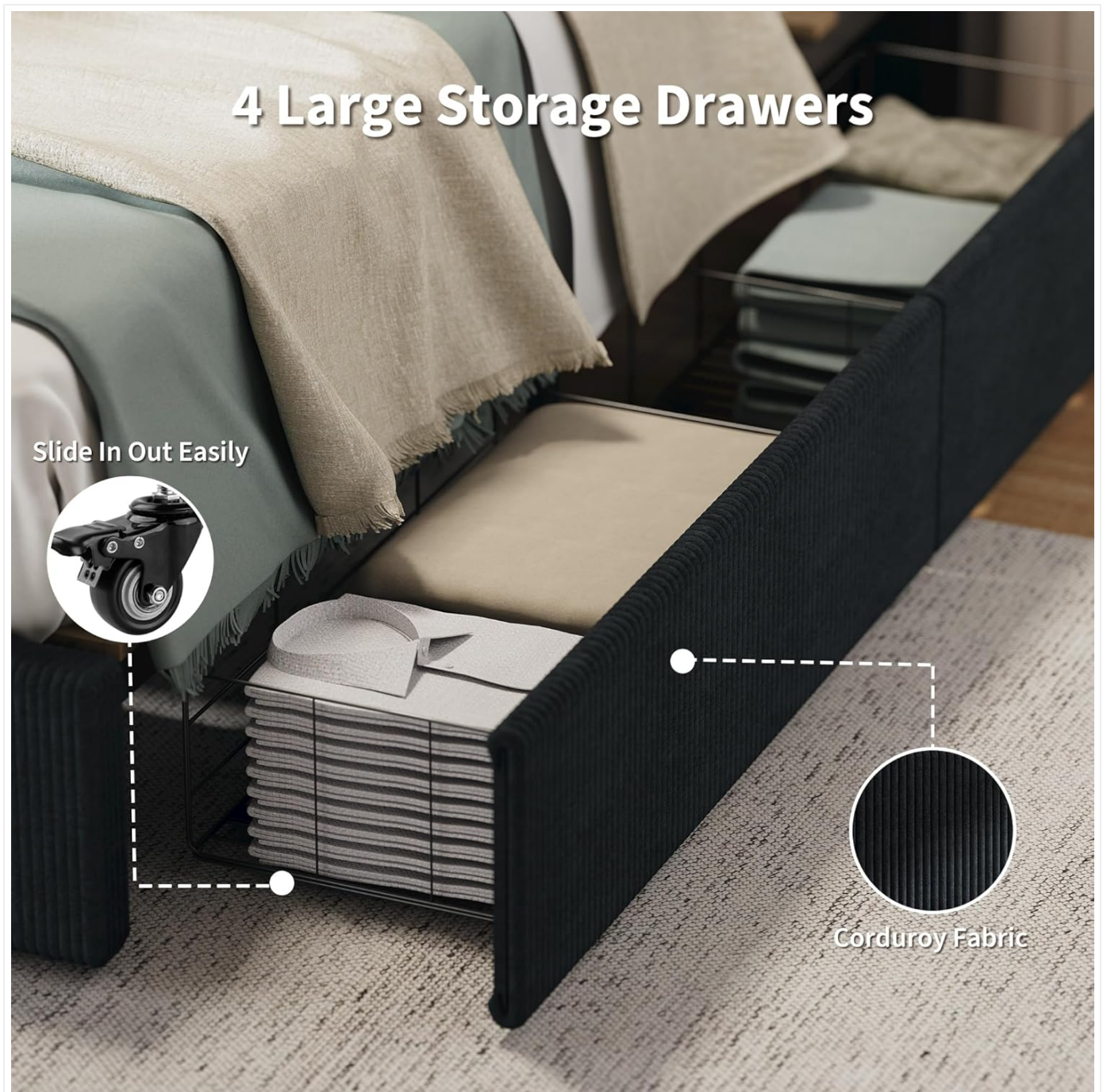
Image 3.5.1: A detailed image of one of the four large storage drawers, showcasing its corduroy fabric exterior and the integrated wheels designed for smooth operation.

Your browser does not support the video tag.