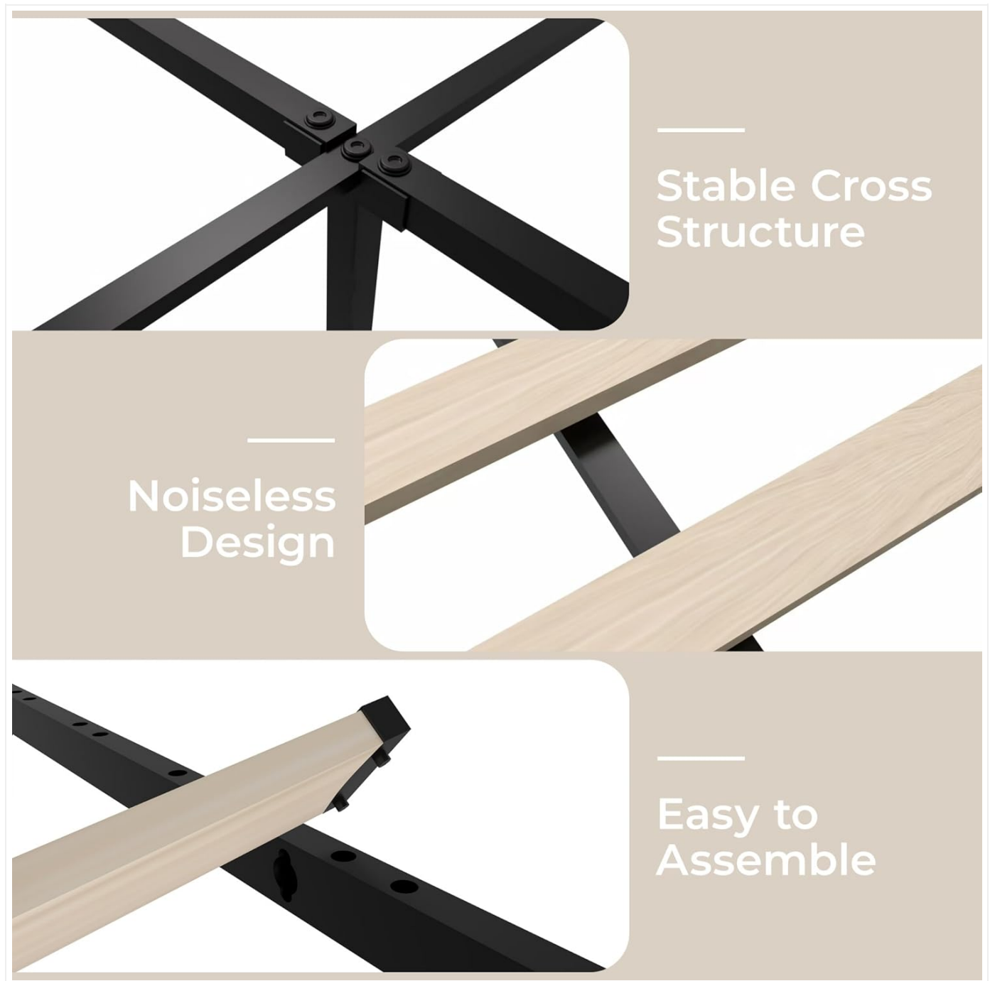
Image 3.3.1: Detailed view of the bed frame's construction, highlighting the stable cross structure, the noiseless design of the wooden slats, and the simple assembly mechanism.

Connect the side rails to the headboard and footboard. Insert the center support beam and attach the support legs. Ensure all connections are firm.