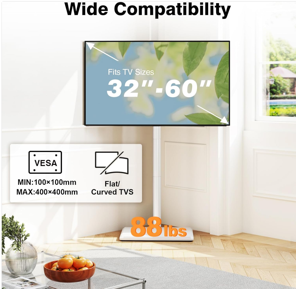
Image: Visual guide for TV compatibility, including screen size, VESA patterns, and weight limit.