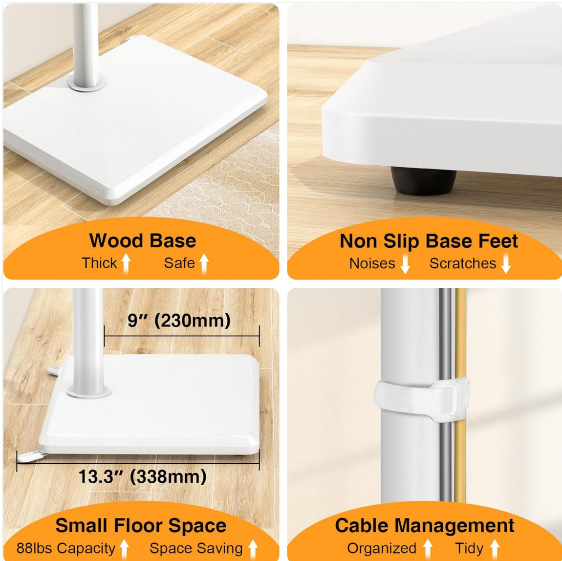
Image: Overview of stand components including the wood base, non-slip feet, and cable management features.