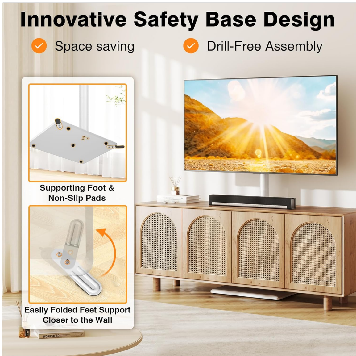
Image: Details the foldable supporting feet and non-slip pads for versatile placement and stability.