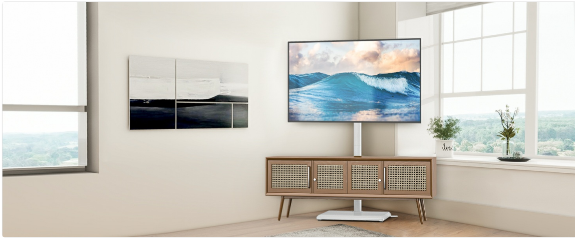
Image: Detailed compatibility check for TV size, weight, and VESA mounting patterns.