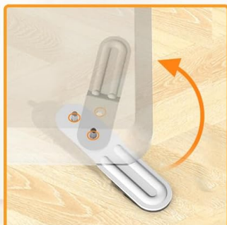
Easily Folded Feet Support Closer to the Wall