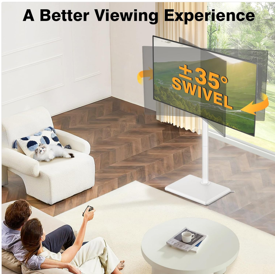
Image: Illustrates the swivel capability of the TV stand.

The TV mount allows for a smooth swivel of up to \pm 35 degrees (70 degrees total range) left or right. This feature enables you to adjust the viewing angle for optimal visibility from various positions in the room.