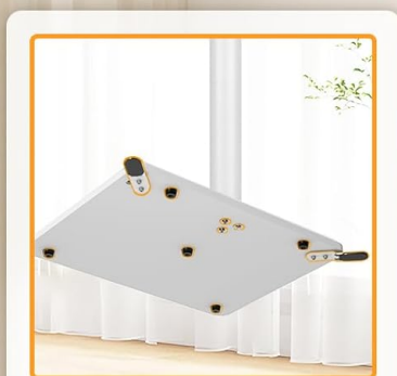
Supporting Foot & Non-Slip Pads