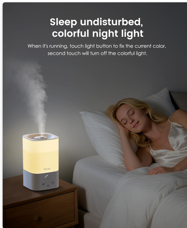
Figure 5.2: Humidifier in sleep mode. This image shows the humidifier emitting a gentle mist with a warm yellow night light, placed on a bedside table next to a sleeping woman, illustrating its quiet operation and soothing light for sleep.