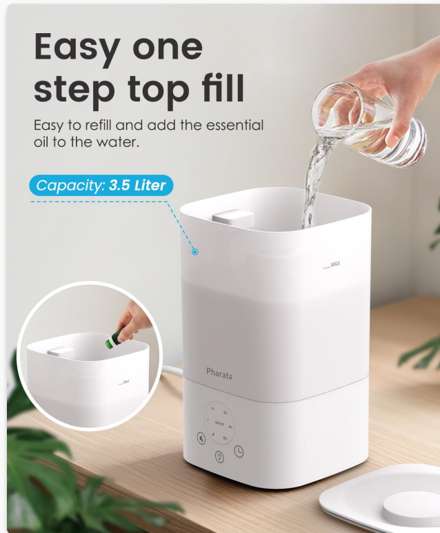
Figure 4.1: Easy top-fill design. This image illustrates a hand pouring water directly into the open top of the humidifier, highlighting the convenience of its design.